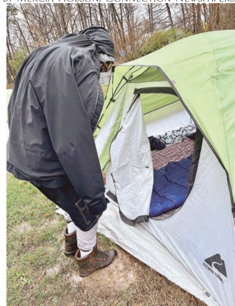
A tent resident opens the tent flap but pauses. He goes to a puddle to wash off his muddy boots. Inside, his possessions are neatly arranged.