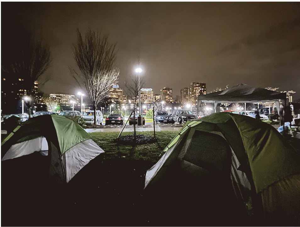
The skyline of Reston Town Center gleams outside their tent doors.