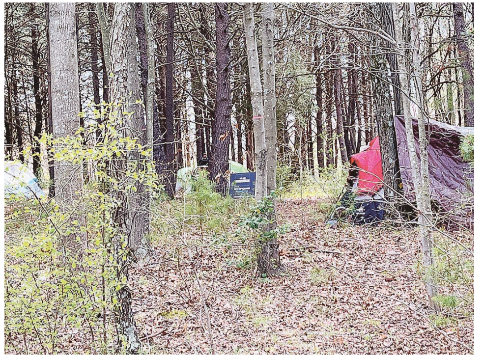
Another tent "city" in Reston.