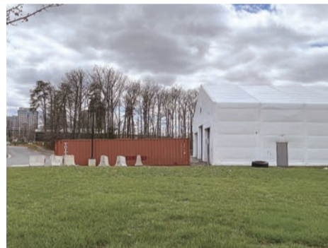
The former temporary Reston Fire Station within view of North County Governmental Center- could it be used for temporary shelter?

"Emergency shelters are not a solution to eradicating homelessness in our area,