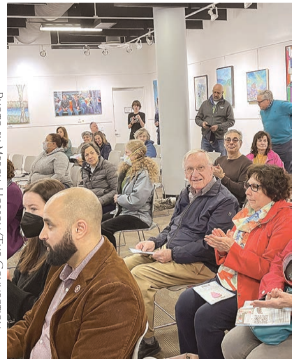
The early crowd attending Founder's Day 2022.