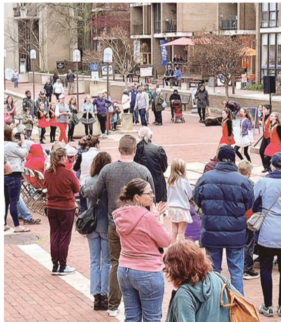
The early crowd attending Founder's Day 2022 appears smaller than during its pre-pandemic celebrations. The Foley Irish Academy of Dance performs.