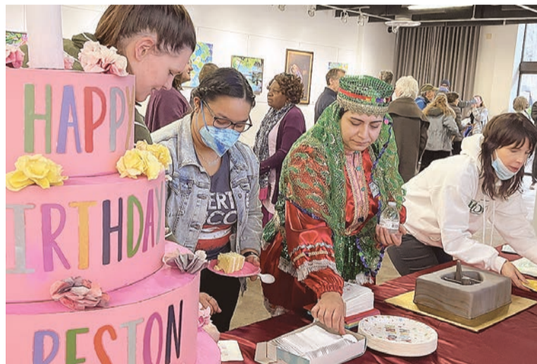
It's birthday cake for all at Founder's Day 2022.