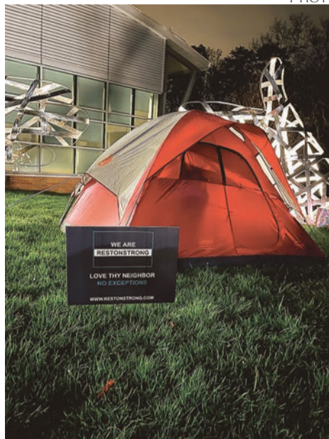
Outside of North County Governmental Center in Reston, two hands of the welded stainless steel sculpture by m.l. duffy titled Mutual Understanding/Mutual Respect reach out to each other in a welcoming gesture.

"Every single person we put in a tent is quiet and sleeping. The only sounds are airplanes, and I've got these three flags that keep whacking in the wind. ... It's 50 degrees, but it feels like it's insanely cold. ... I'm so freezing, and I can't imagine others who do this every single night," Selvaraj-D'souza says that this is not what Reston Strong set out to do when organizers