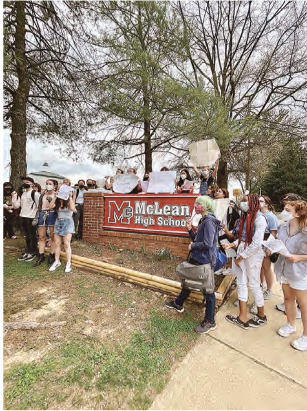
Students stages walk out protests at McLean, Westfield and Mount Vernon High Schools, among others.