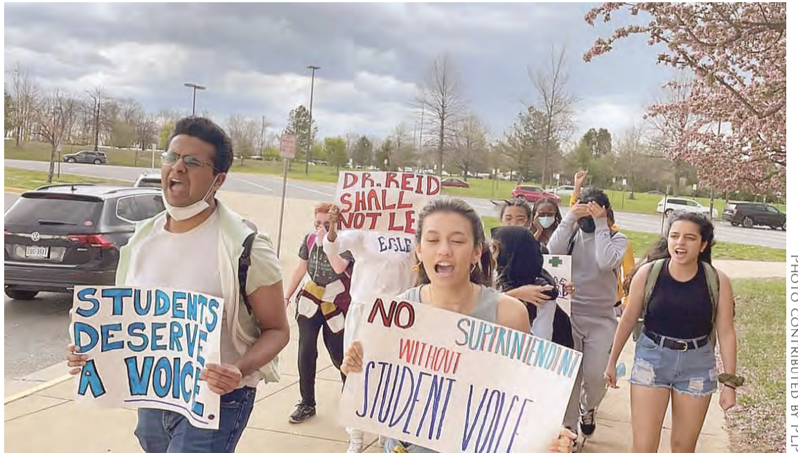
Student protestors at Westfield High School.