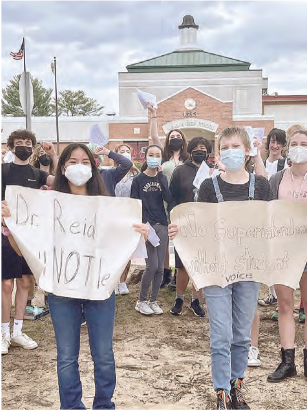
Student protest over the superintendent selection process at McLean High School last week.