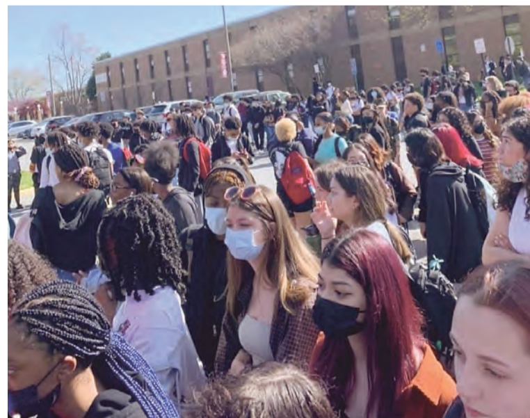
Student protest at Mount Vernon High School.