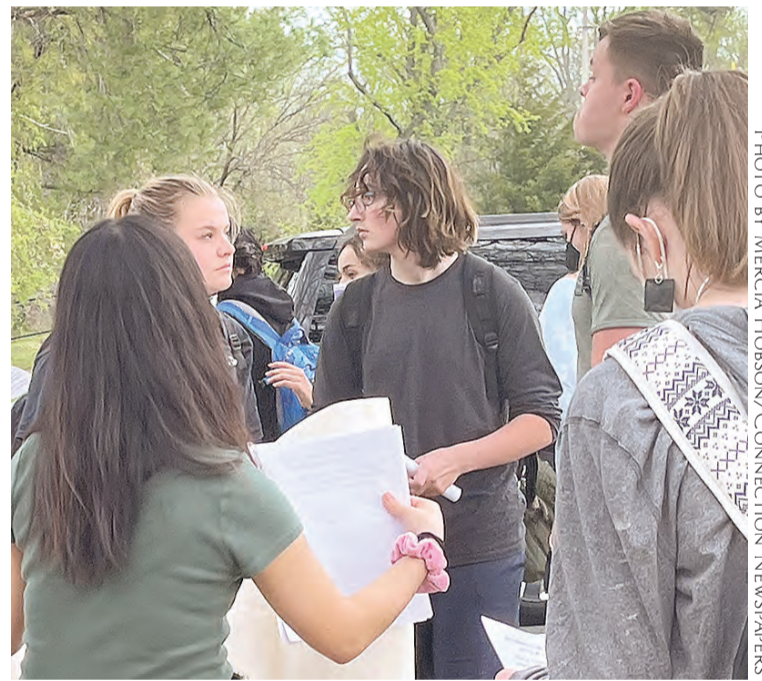
Student protestors at McLean High School