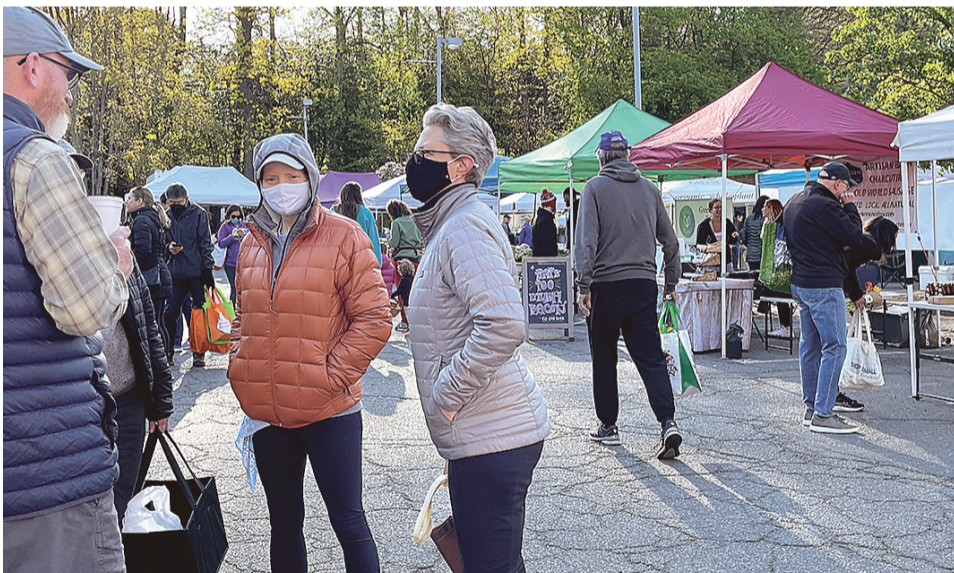
Come meet your friends at the Reston Farmers Market.

The market also offers a master gardener's booth, where experts are available to answer horticultural inquiries. SNAP participants are eligible for a match of up to $20 at Reston Farmers Market.