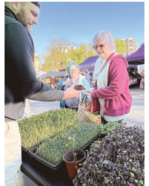
Shoppers visit the vendor booths at the Reston Farmers Market.