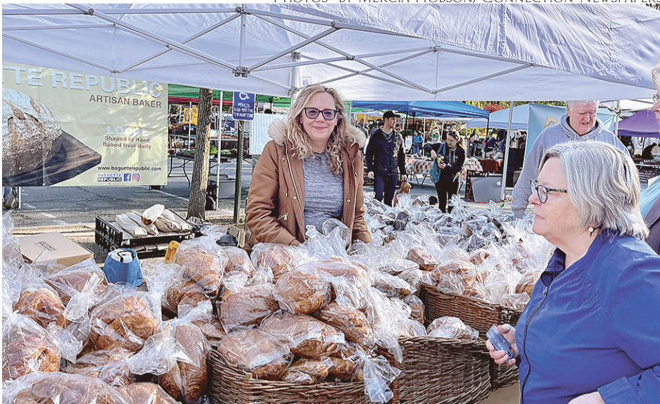
Shoppers check out the baked goods at the Reston Farmers Market.