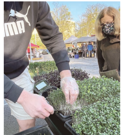
Microgreens at the Reston Farmers Market.