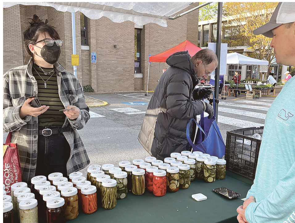
Shoppers visit the vendor booths, including a variety of pickled veggies, at the Reston Farmers Market.

When asked what he intended to purchase at the market, Bouie said he would look for