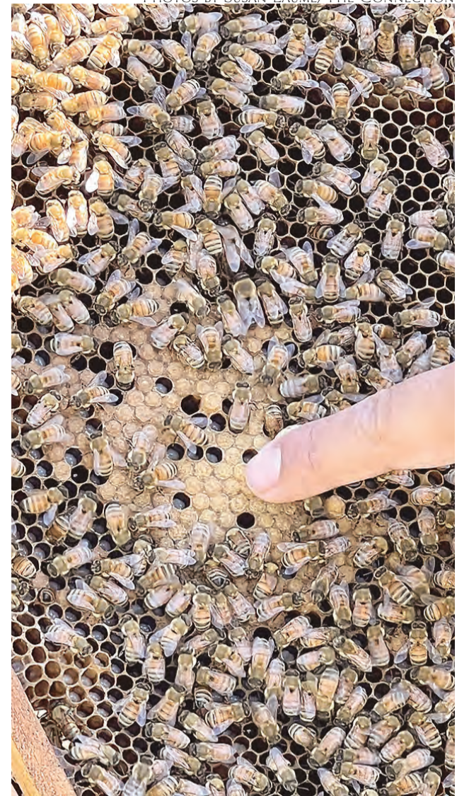
Hive frame shows a mix of raw pollen, honey, and larvae