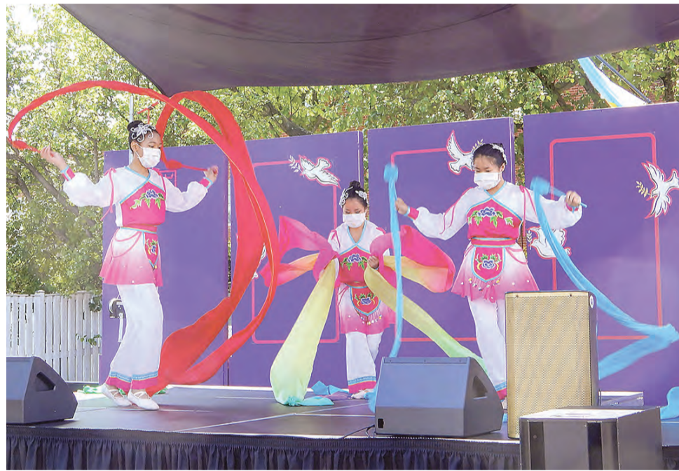
Performers with the Fairfax Chinese Dance Troupe do the ribbon dance.