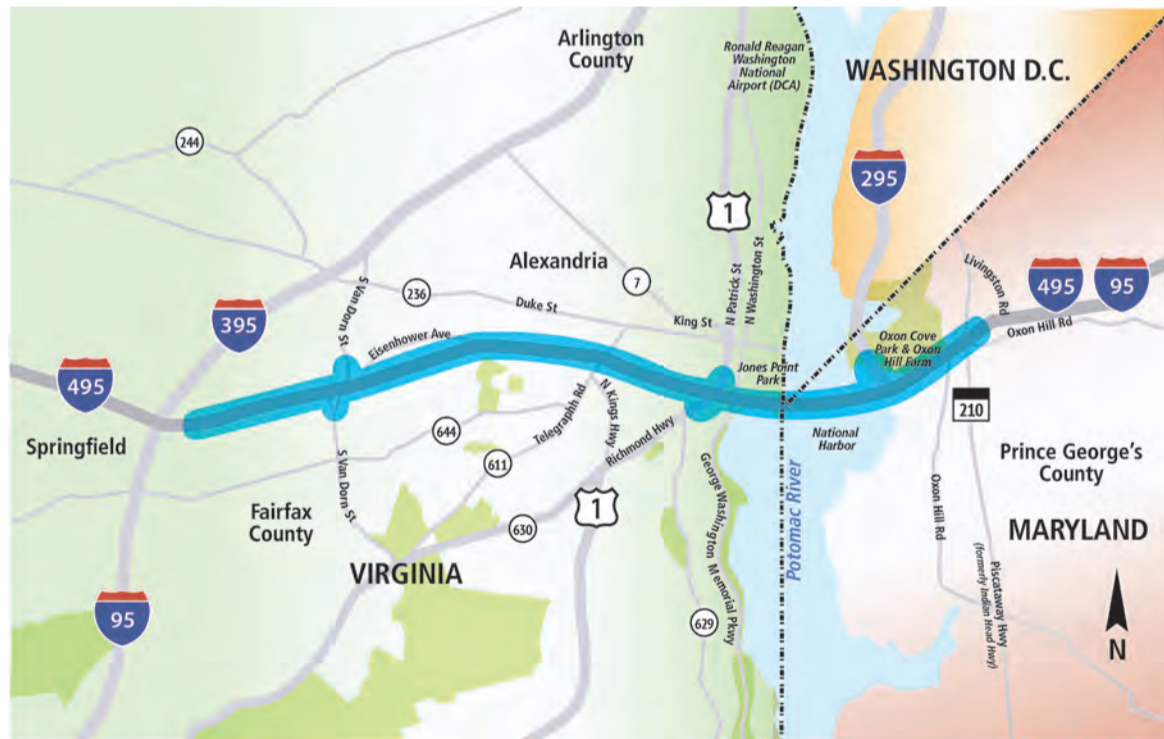
MAP BY VIRGINIA DEPARTMENT OF TRANSPORTATION

When the rebuilt Woodrow Wilson Memorial Bridge opened to traffic in May 2008 it included additional space for future transportation needs which included transit across the bridge. This study is being coordinated with surrounding stakeholders including localities and the Maryland Department