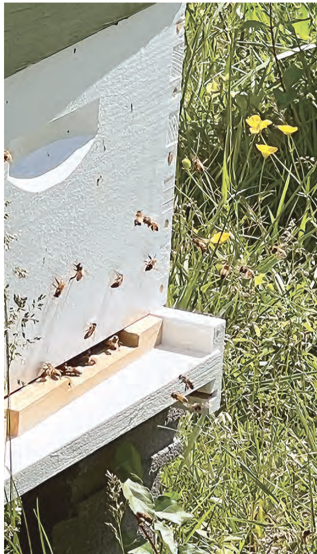
Every stack is an independent hive with one queen, with boxes added to the stack to provide more space as hive member numbers grow.