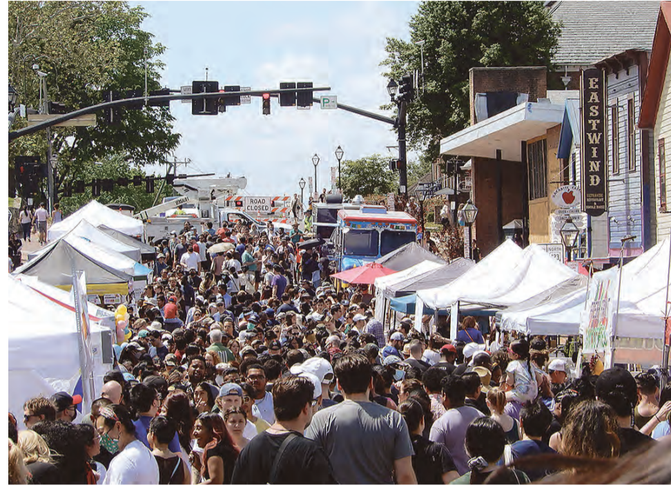
More than 18,000 people filled Fairfax's Main Street during the Asian Festival.

Fairfax City's 2nd annual Asian Festival on Main was Sunday, May 15.