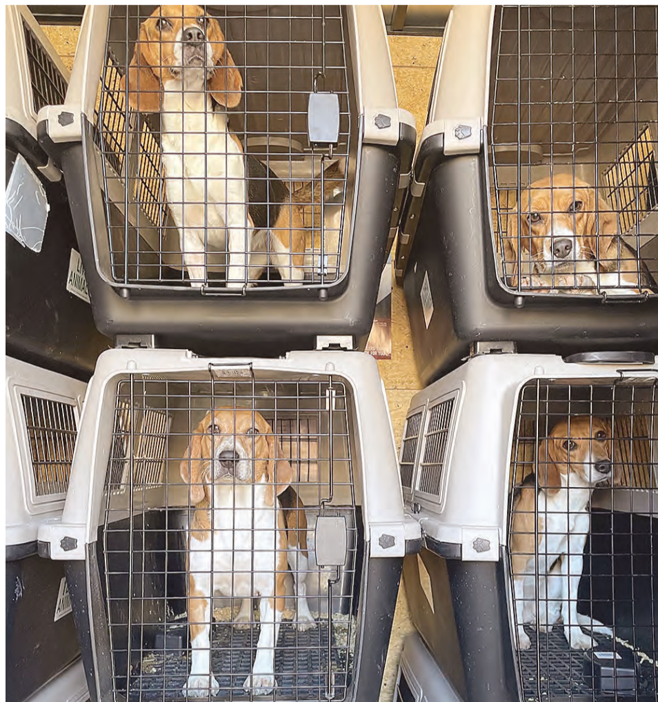
Beagles released from Envigo research breeding facility on their way to adoptions in March this year in accordance with Virginia's revised law.

Similarly, treatment of beagles at Inotiv, Envigo's sister company in Indiana, was revealed in April, after a seven-month long undercover operation by the Human Society of the United States (HSUS). Their under-