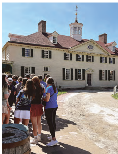
Tourists line up to view George Washington's Mount Vernon.