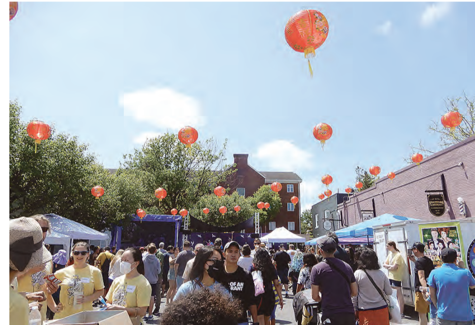
Colorful, orange lanterns adorn the main-stage and beer-garden area.