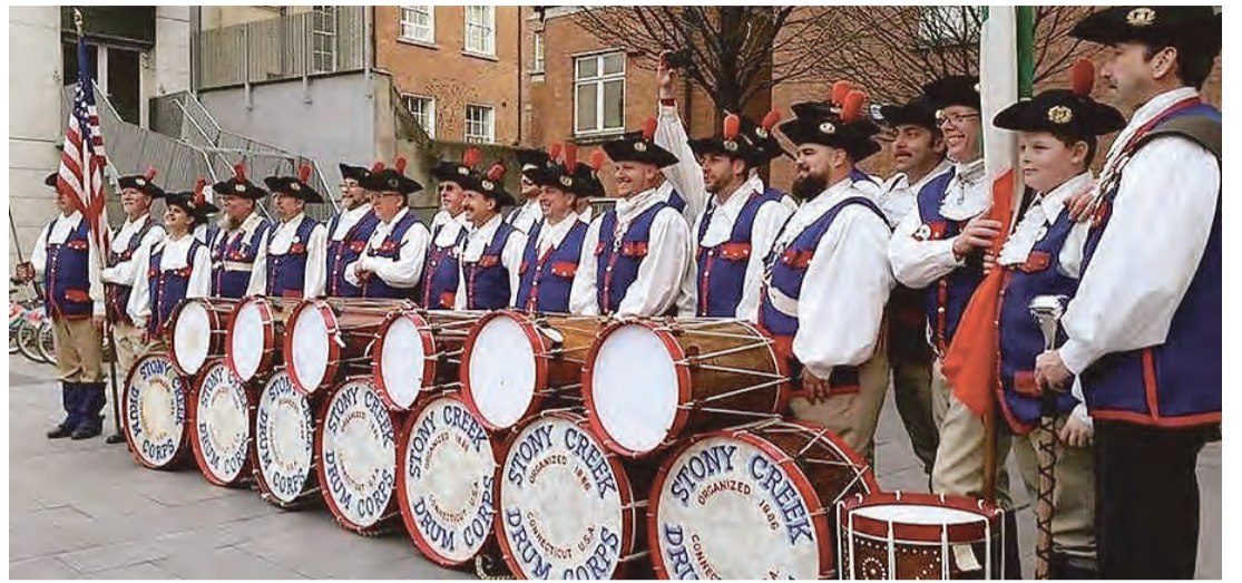
The Fairfax Muster Fife will take place on Thursday, May 19 in Fairfax.