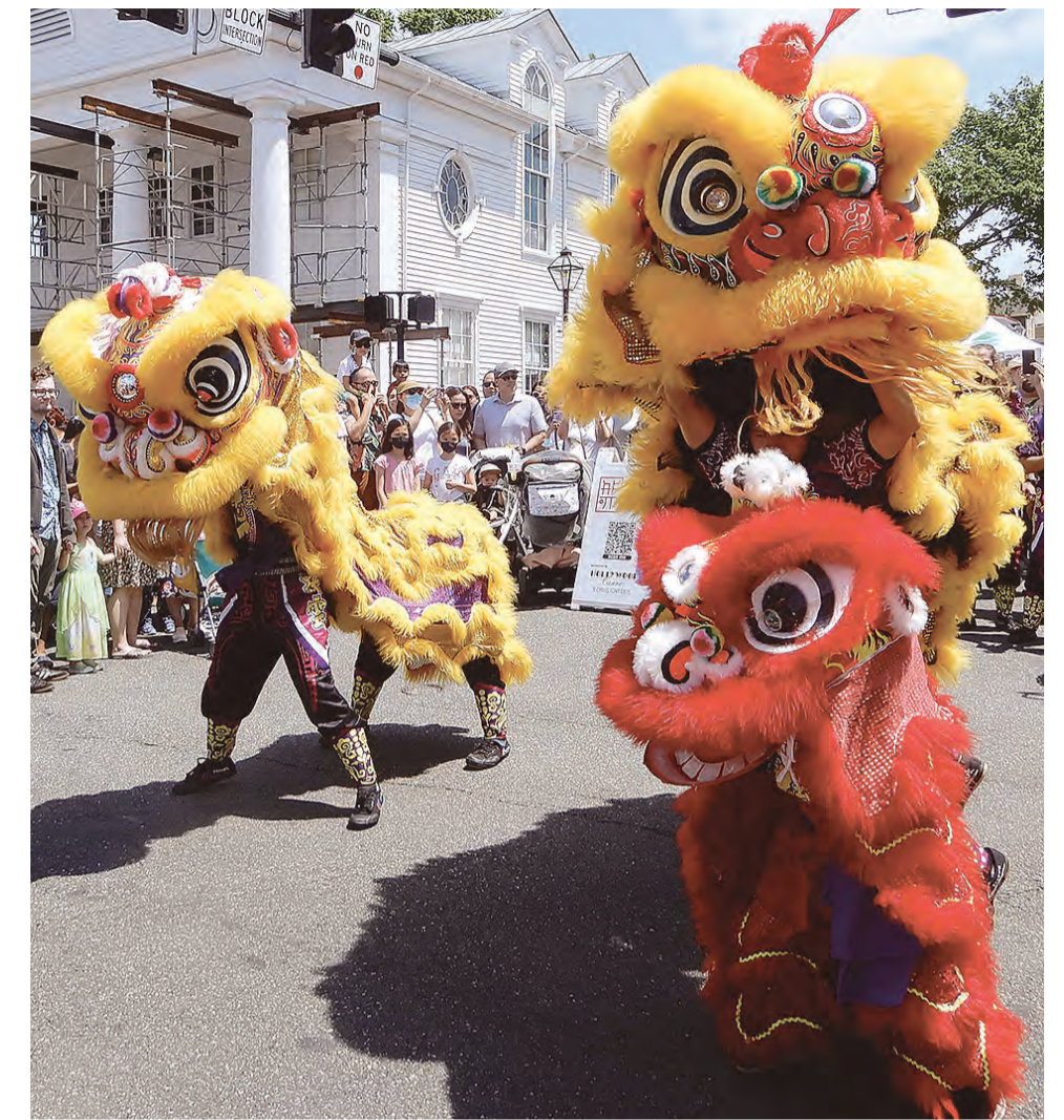
The Choy Wun Lion Dance Troupe thrills the crowd.