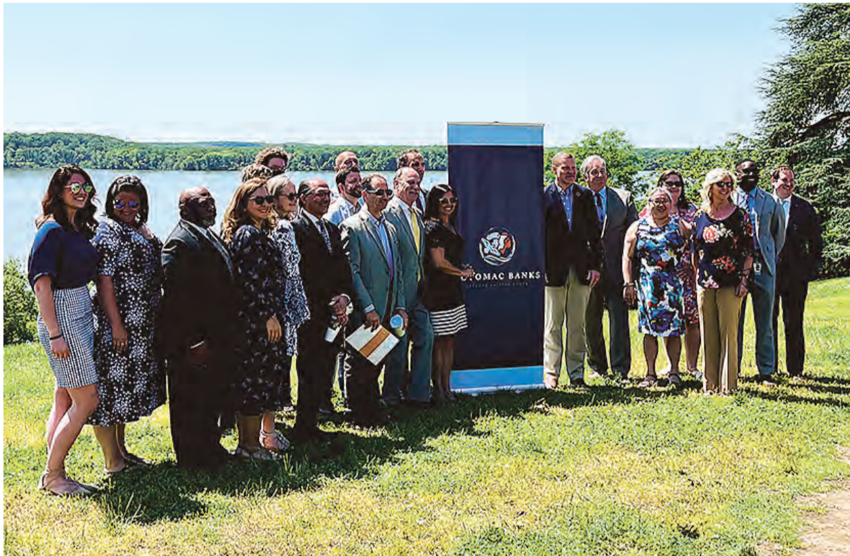
Local leaders and elected officials gather after announcing the new tourism branding initiative and unveiling its logo.