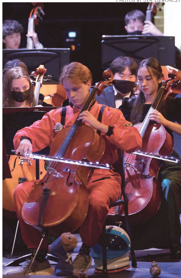
With bows wrapped in LED lights, Langley HS Orchestra's senior musicians performed space-age music in their final concert.