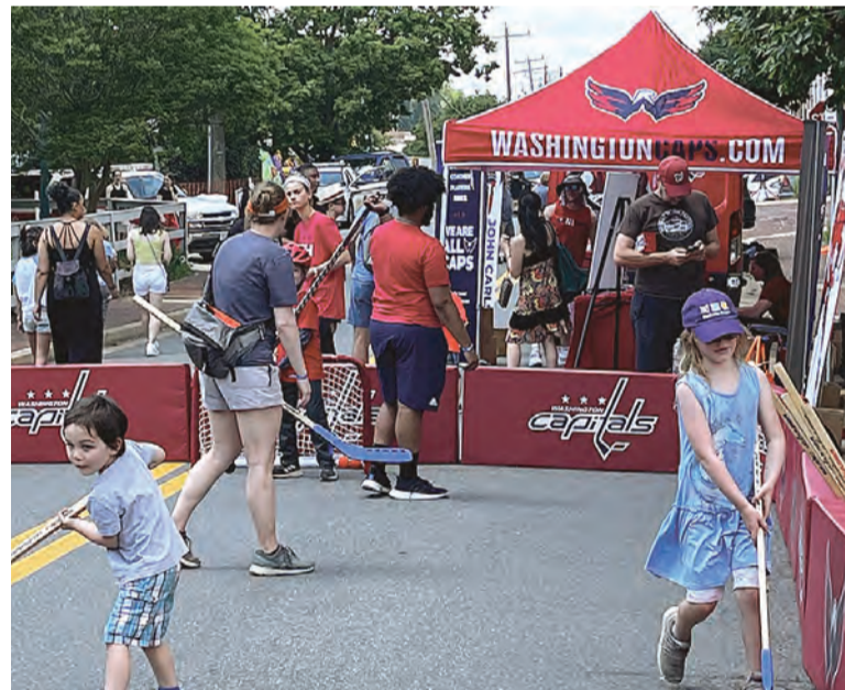
Games are always a draw.