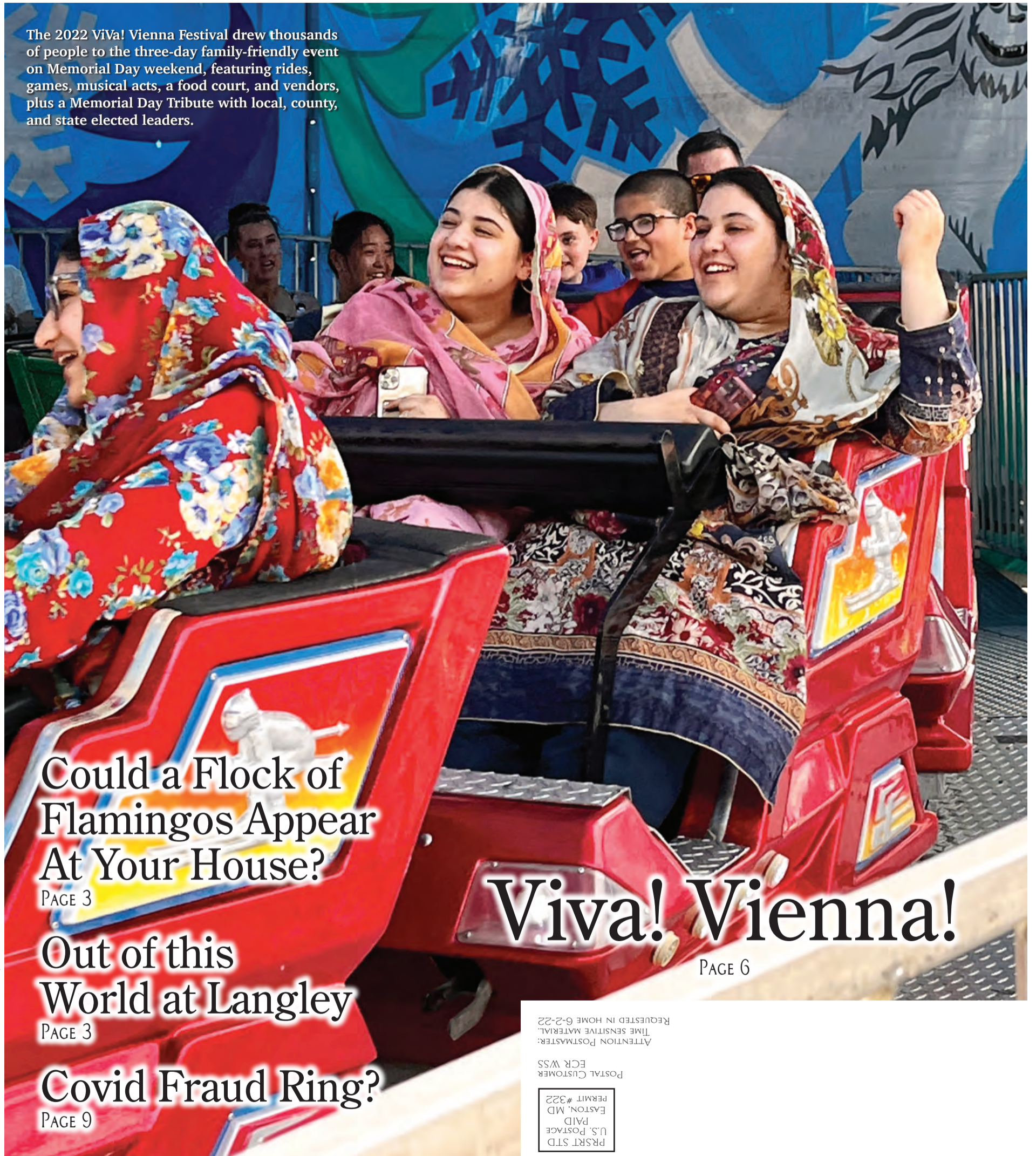
ENTERTAINMENT, PAGE 8 ♦ CLASSIFIED, PAGE 10

The 2022 ViVa! Vienna Festival drew thousands of people to the three-day family-friendly event on Memorial Day weekend, featuring rides, games, musical acts, a food court, and vendors, plus a Memorial Day Tribute with local, county, and state elected leaders.