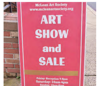
McLean Art Society show at Walker Chapel May 13-14