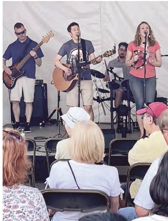
The Coozies perform on the Lawyers Road Stage.