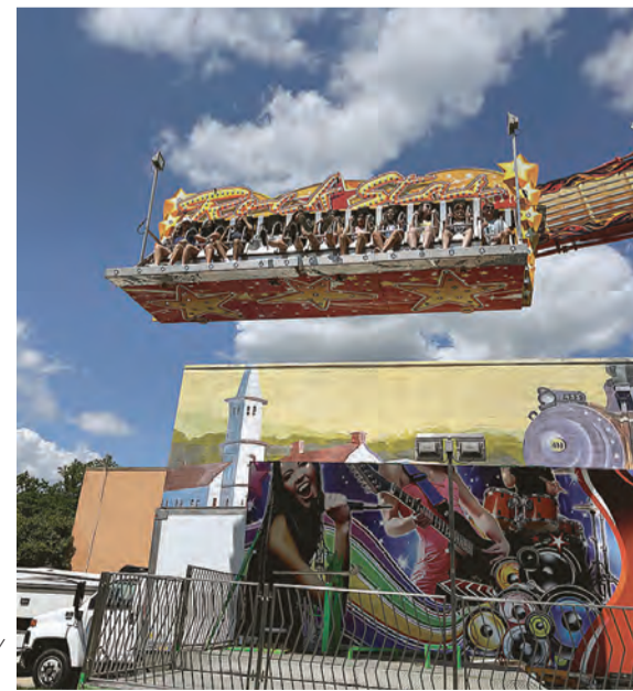
Amusement Rides by partner Cole Amusements