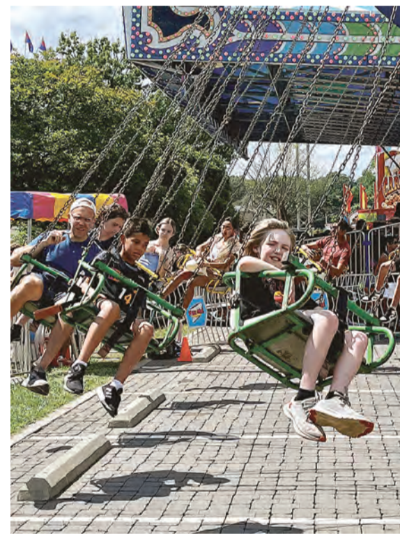
Amusement Rides by partner Cole Amusements