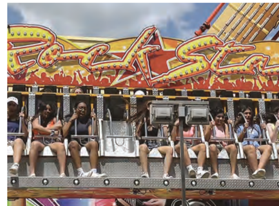
Amusement Rides by partner Cole Amusements

above all, their sacrifice and live in gratitude each and every day for the precious gift they have given us. Freedom is not free," Youngkin said.