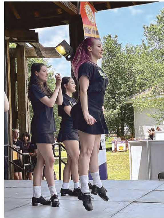
Maple Academy of Irish Dance performs on the Town Green Stage.