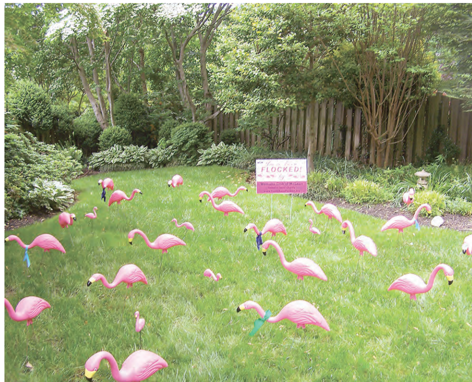
Could this happen to you?