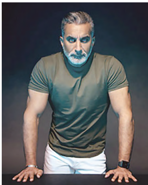
The political comedian Bassem Youssef will appear at the Alden Theater in McLean on Friday, June 10, 2022.

HomeAid Diaper Drive. At HomeAid Office, 3684 Centerview Drive, Suite 110B, Chantilly. HomeAid Northern Virginia is currently hosting their annual Builders for Babies diaper drive. With the drive closing on Father's Day (June 19th) they encourage everyone to get involved to reach our collection goal of 50,000 diapers and wipes. Then, on June 24th, they will be