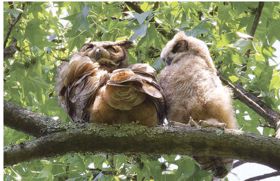
Great horned owl at Dyke Marsh and young.