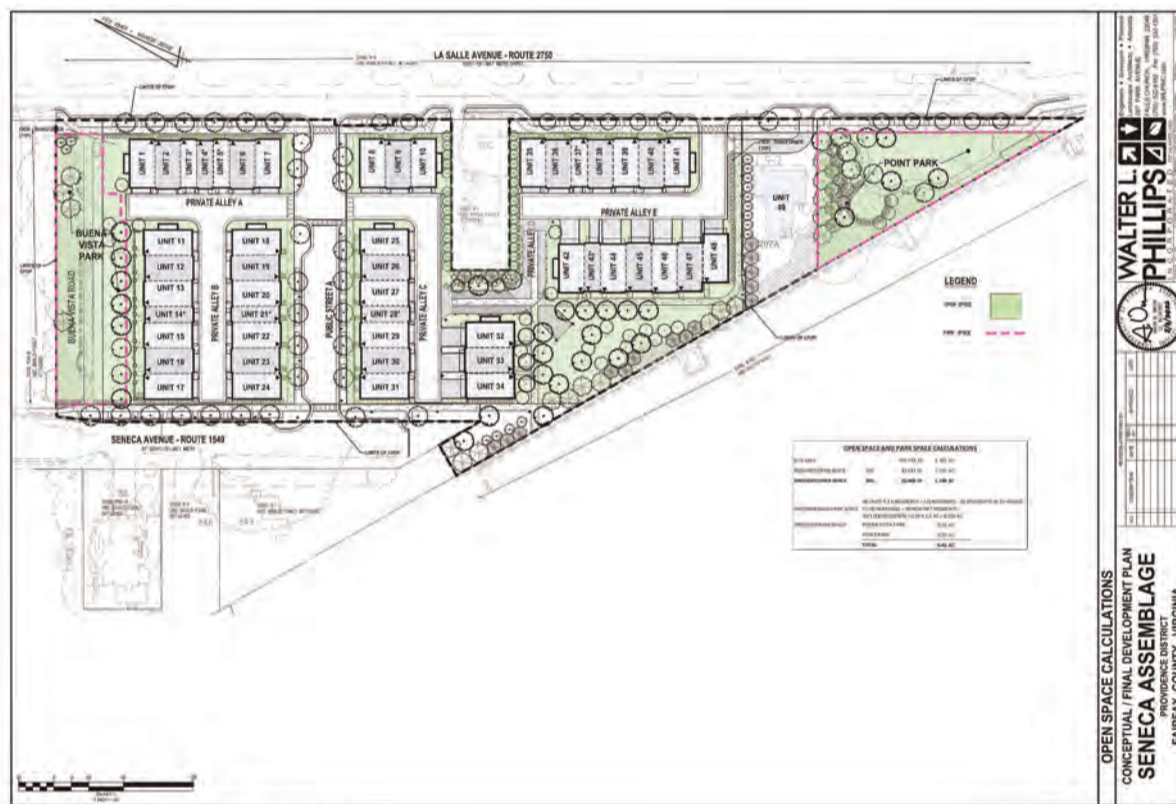
Conceptual/Final Plans: Seneca Assemblage by Applicant Toll Mid-Atlantic LP Company, Inc.