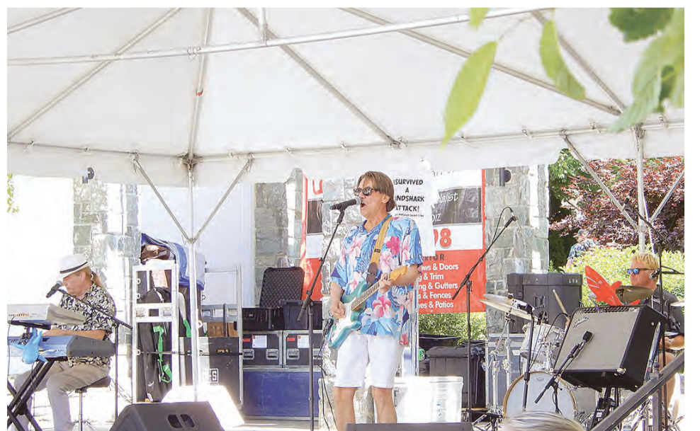
The Landsharks performing “Brown-Eyed Girl.”