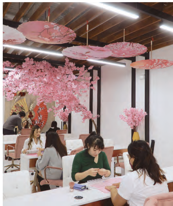
Nail technicians and customers inside Raizun Nail Spa