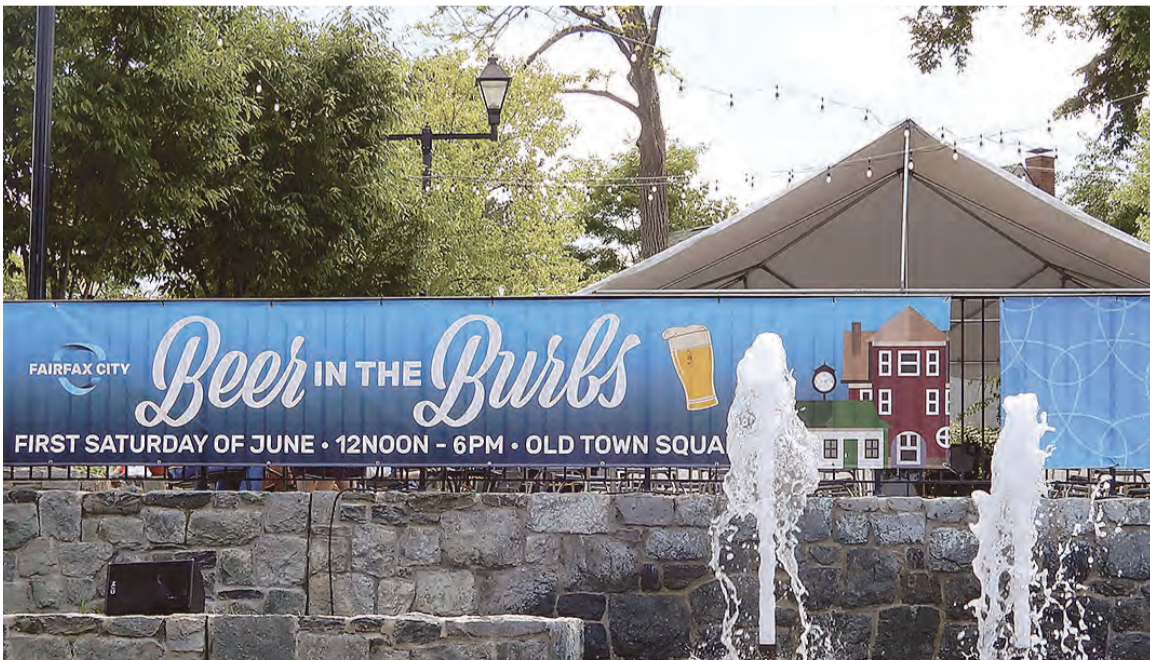
Beer in the 'Burbs was held in Old Town Square.