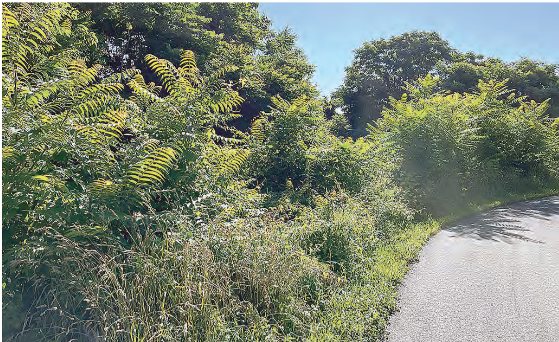
What's wrong in this picture? Unnoticed by most walkers on this pleasant trail in Laurel Hill Park's Central Green area, the invasive plant, Tree of Heaven, is at work excluding native trees on which native insects and birds depend.