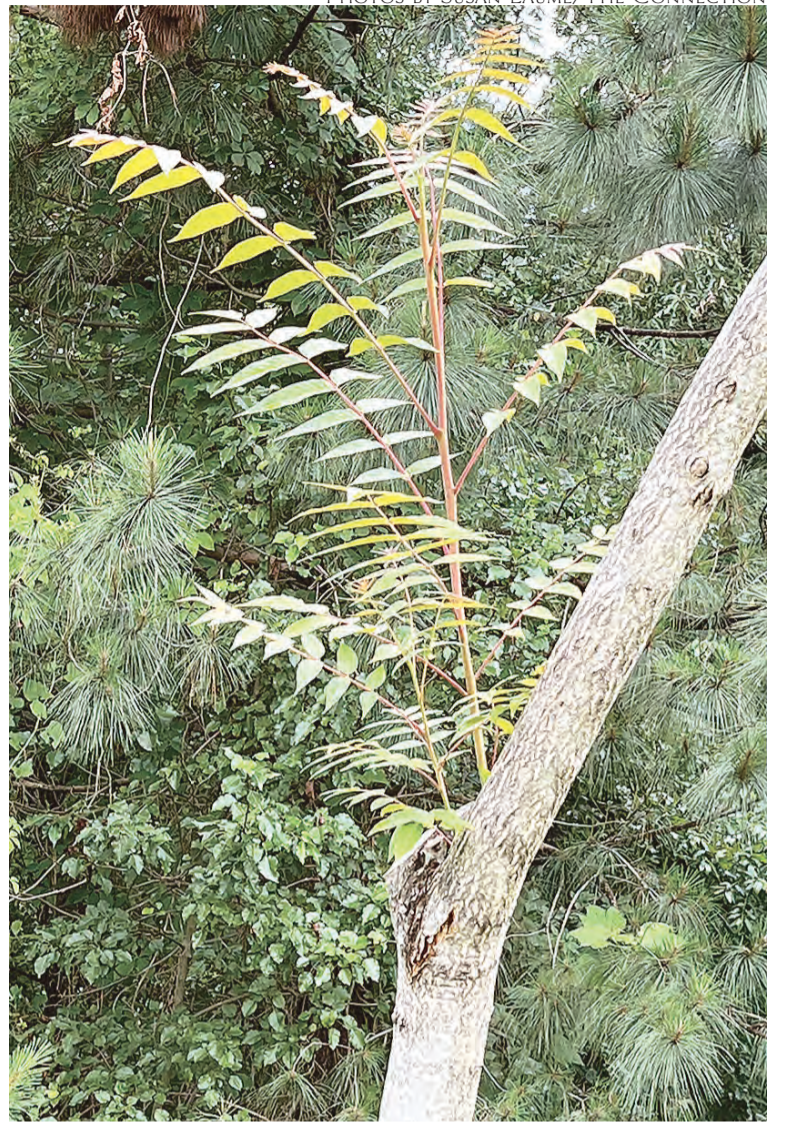
Capable of growing from seed, rhizomes, or as shown here from sprouts, Tree of Heaven, has an impressive set of survival adaptations making it very difficult to control.