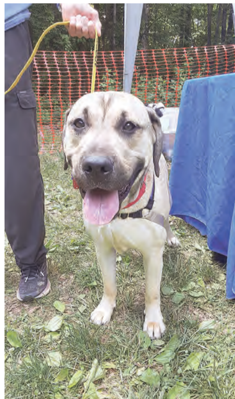
The owner was told “Luke,” was part terrier but it’s not very apparent.