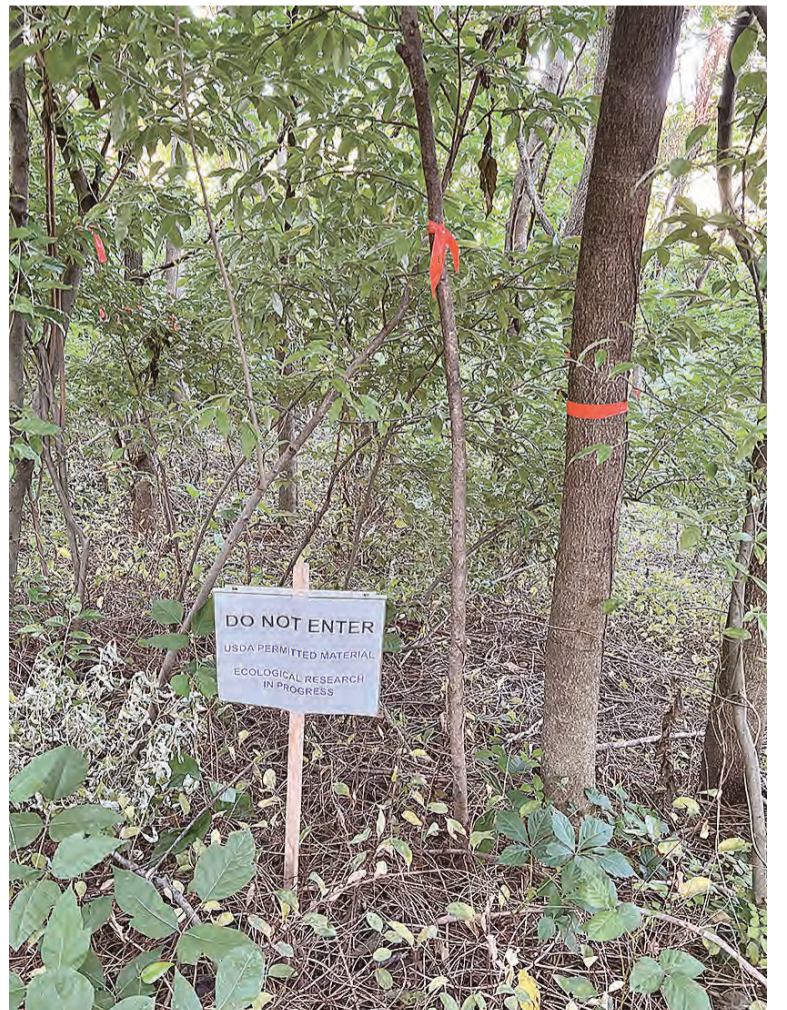
One of three test patches in Laurel Hill Park, managed by Virginia Tech, two using fungal control and one control patch

THE FUNGUS , named Verticillium nonalfalfae , was discovered naturally killing Tree of Heaven in Pennsylvania, Ohio, and Virginia, by causing a vascular wilt disease in the tree. Studies of the fungus to date, suggest that it could be used as a safe and effective biological control agent, where only herbicides or hand-pulling methods were previously available as control methods. Work continues to register the pathogen, using the Pennsylvania tree variant, through the EPA as a bio-pesticide, but is still likely several years away.