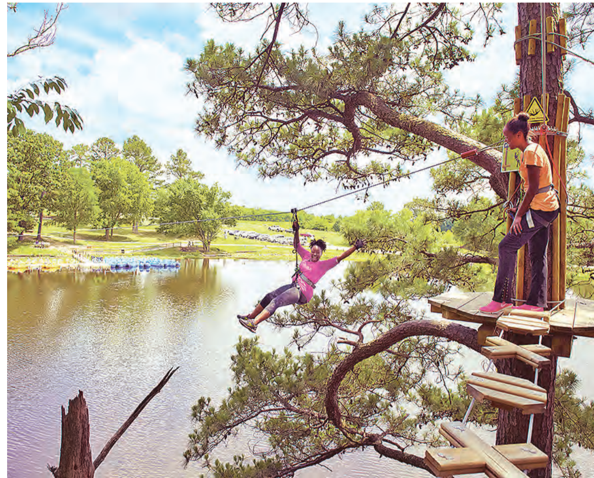
She's living life adventurously at the "Go Ape," park in Fairfax Station.