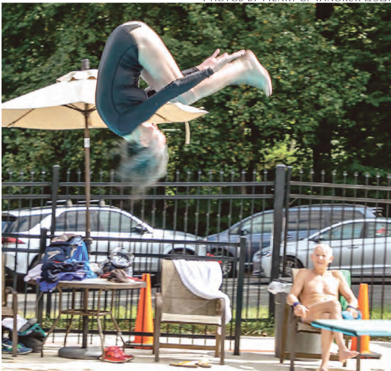
Competitors in the 2021 Northern Virginia Senior Olympics diving competition.