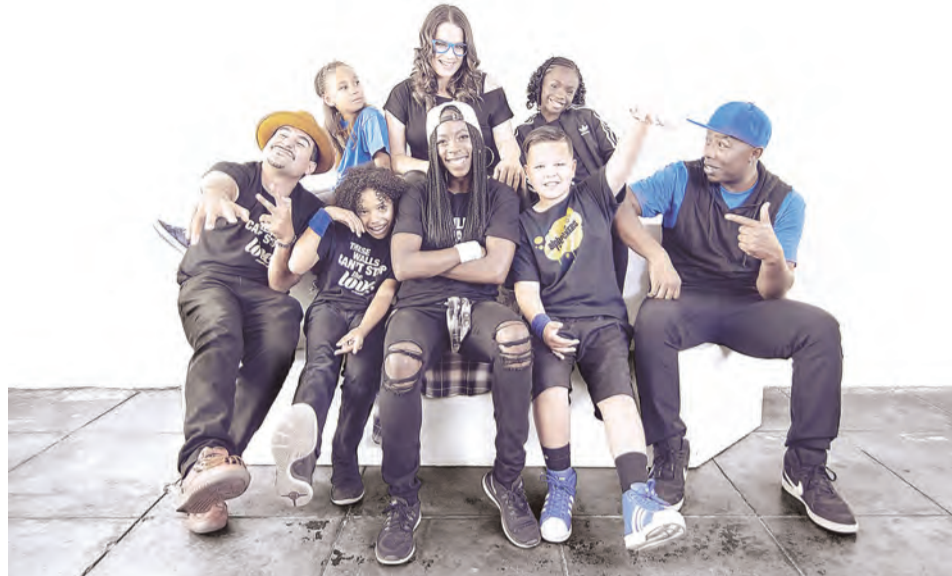
The Alphabet Rockers will appear at MCC's Celebration of Juneteenth on Sunday, June 19, 2022 in McLean.