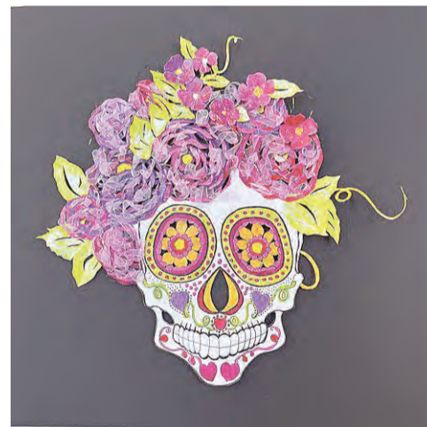
You never know what is on display at the Workhouse Arts Center in Lorton.

After all that activity, time to grab a bite to eat, and it's all about