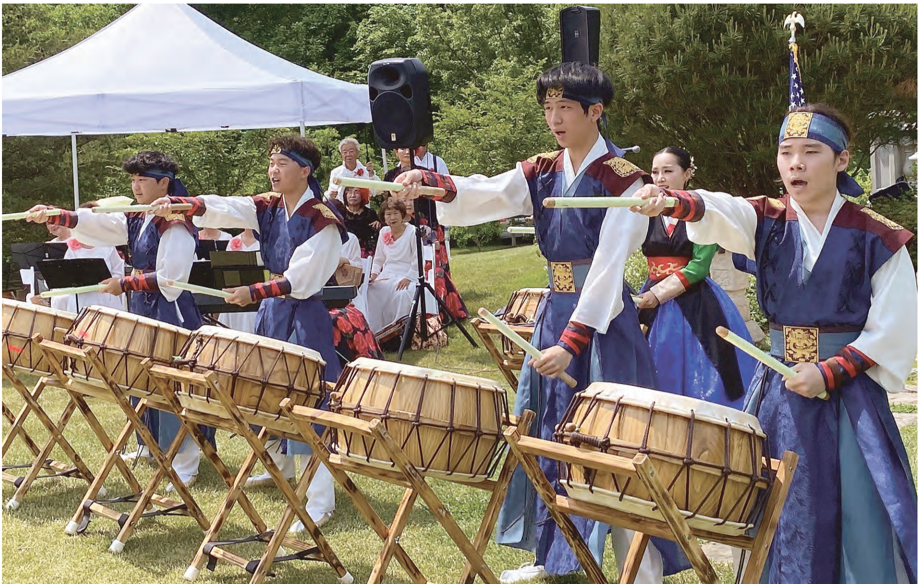
The drums played on May 27 for the 10th anniversary celebration of the Korean Bell Garden at Meadowlark Botanical Gardens in Vienna. Check for events all summer for your StayCation visit.