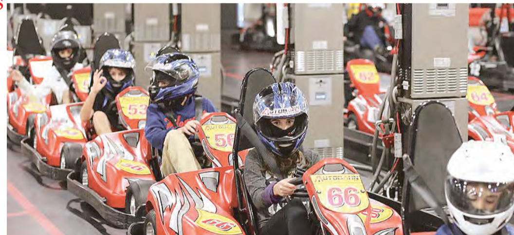
Racers at the Autobahn Indoor Speedway near Dulles rev their engines.

In the South Run Rec Center, there's another climbing course called "Go Ape," with five activities depending on the skill level. There are 70 obstacles at South Run and a 320-foot zip line.