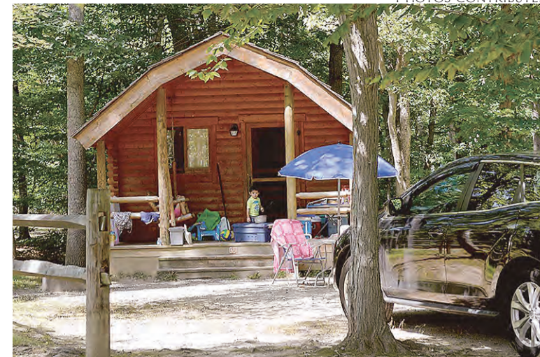
Camping out at Pohick Bay could be in a camper or one of the cabins that are for rent.