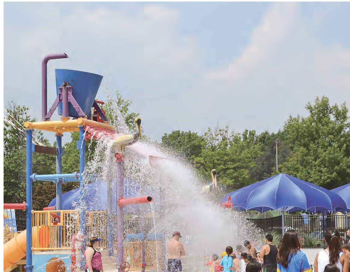
Ocean Dunes Water Park at Upton Regional Park in Arlington, which also offers climbing adventures and mini-golf.