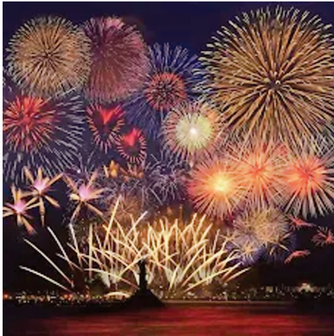
The Town of Vienna will hold its Independence Day Celebration on Friday, July 1 in Vienna.

Broadway in the Park. 8 p.m. At Wolf Trap Center for the Performing Arts, 1551 Trap Road, Vienna. Experience a night of stellar show tunes and memorable performances under the stars this summer at Wolf Trap. Two of Broadway's Tony-Award winning leading ladies, Kelli O'Hara ("The King and I") and Adrienne Warren ("Tina: The Tina Turner Musical"), join some of your favorite Signature Theatre artists for an incredible night of musical theater featuring songs from "West Side Story," "The Wiz," "Gypsy," "Funny Girl" and more.