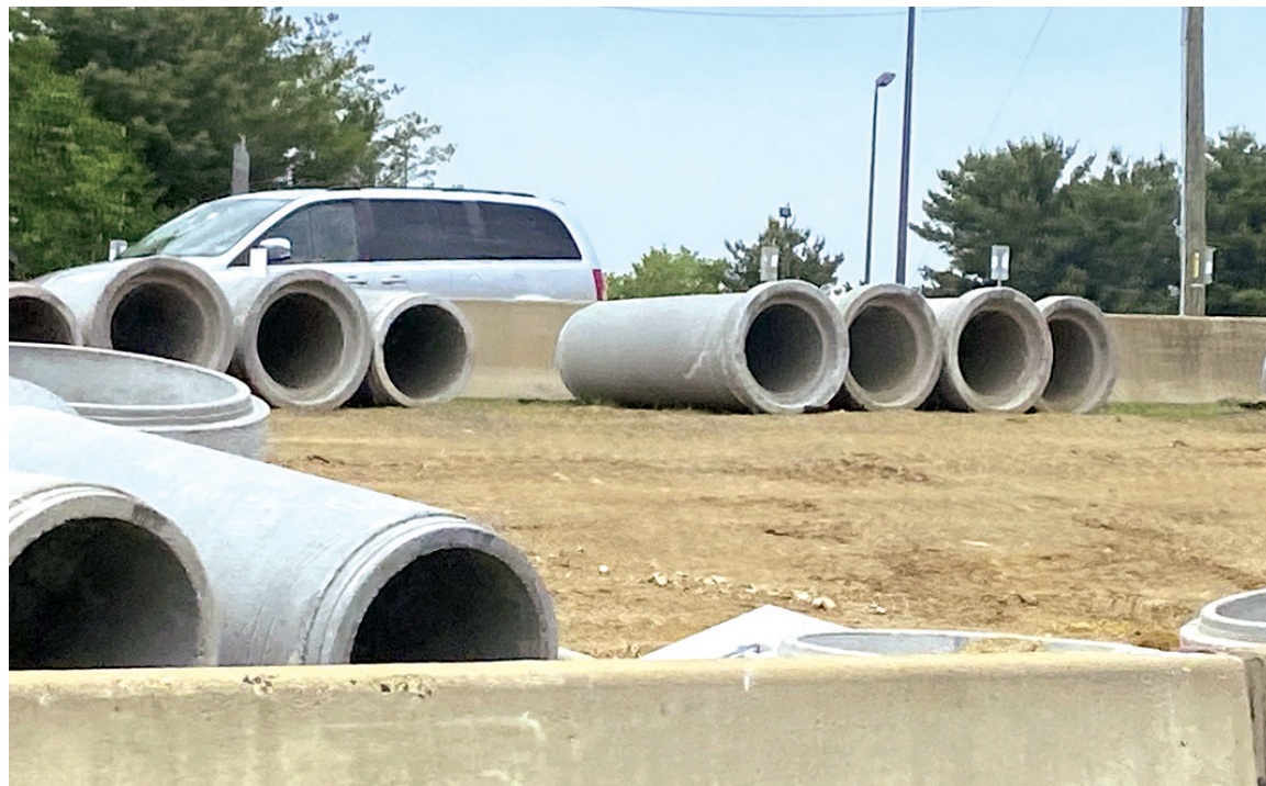
Huge pipes between jersey walls in one section of the median along Route 28.