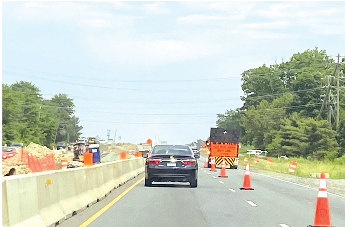
Route 28 southbound traffic traveling in a single lane, while the other lane is closed.