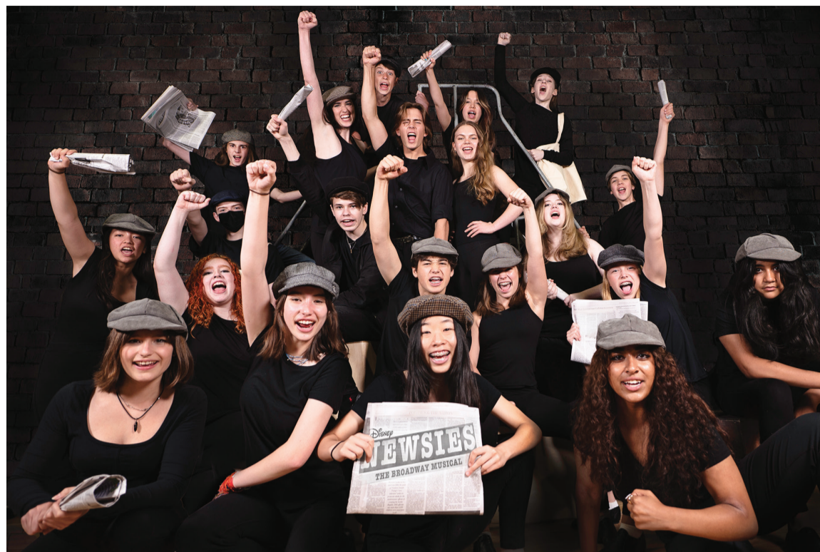
"Newsies" will be featured July 8-17, 2022 at Capital One Hall in Tysons Corner.

Town of Vienna Independence Day Celebration. At Yeonas Park, Vienna. The U.S. Navy Concert Band will perform at 8 p.m., and a 20-minute fireworks display will begin at 9:30 p.m. Visit www.vienna.gov/fireworks .