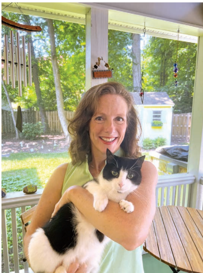
Celebrating Vienna's Pets