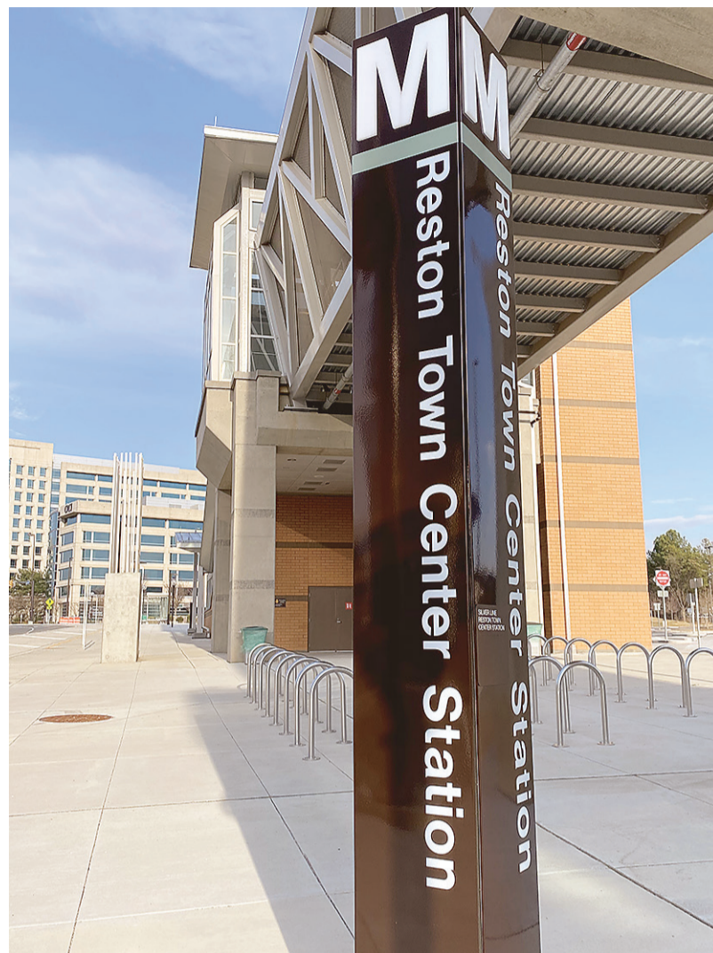
Metro marker to Reston Town Center Station.