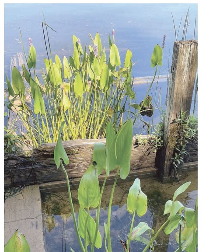
Pickerelweed, a native aquatic plant blooms within the wetlands of Accotink Bay in the park