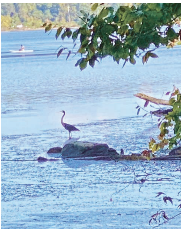
Parks in the regional system provide recreation and viewing an abundance of wildlife within their areas of conservation