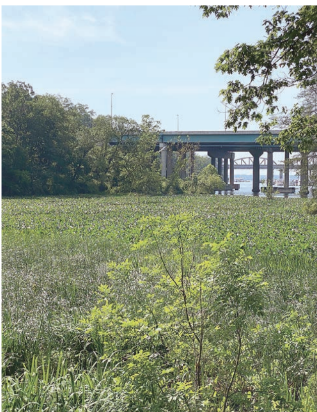
The five year plan could include a new wetland park for environmental education