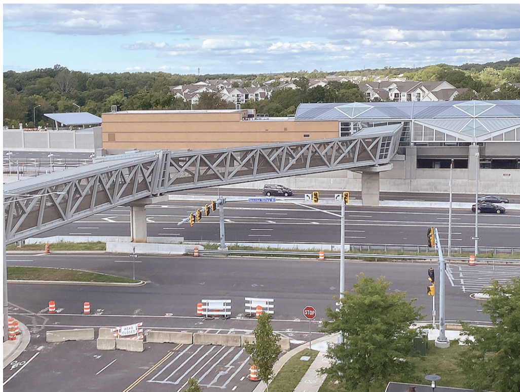
Innovation Center Station