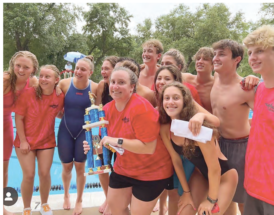
On Wednesday, July 6, 2022, the Hunter Mill Sharks won the NVSL Division 8 Relay Carnival.

To learn more about the Traveling Players Ensemble or to purchase tickets, go to the company's website, https://www.traveling-players.org/performances/ . Masks are required during all studio performances.