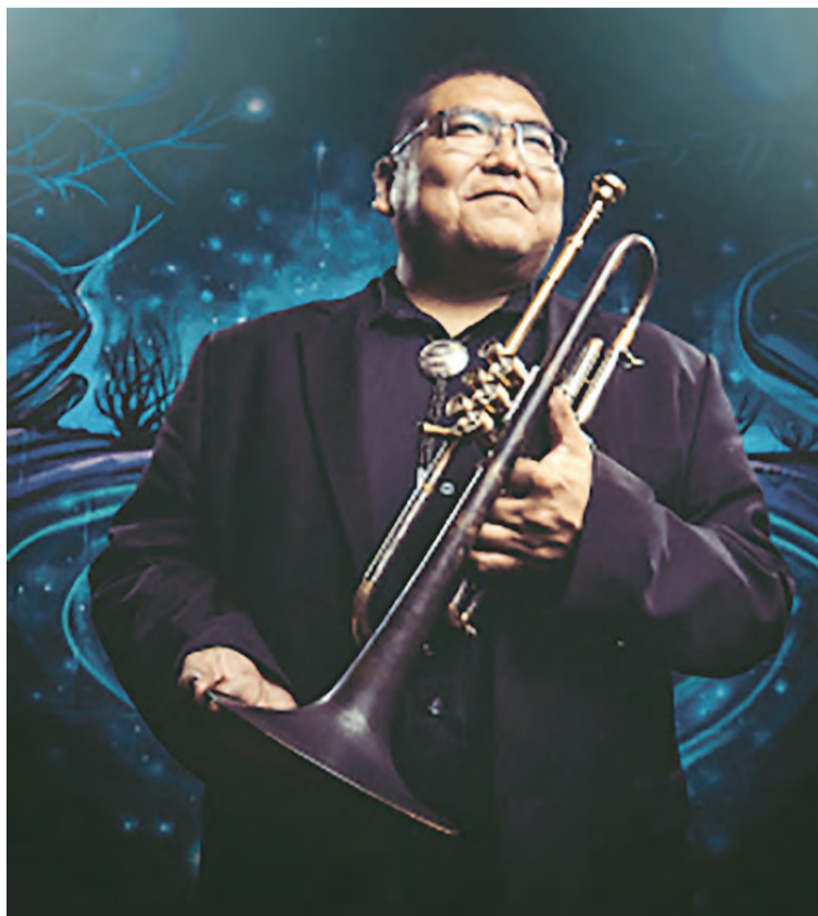
D'DAT will appear Sunday, July 17, 2022 at 1468 Dolley Madison Blvd. in McLean.

Project Locrea. 7:30-8:30 p.m. At Nottoway Park, 9537 Courthouse