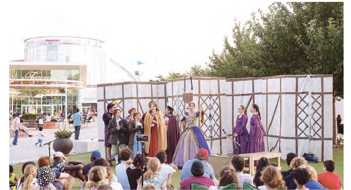
An outdoor performance on the Plaza at Tysons Corner Center by the Traveling Players.