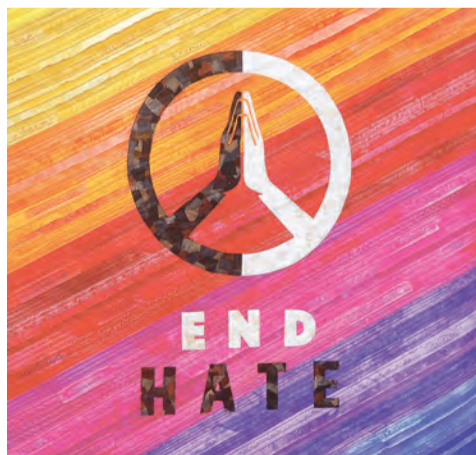
Peace & Brotherhood: "Peace in our Hands" is self-explanatory.