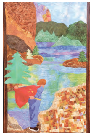
Inspiration: "Learning to Fly" is about this quilter's grandson, who has autism, but keeps trying new things.