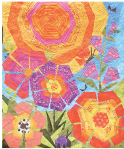
Joy: "Wild and Wonky Garden."