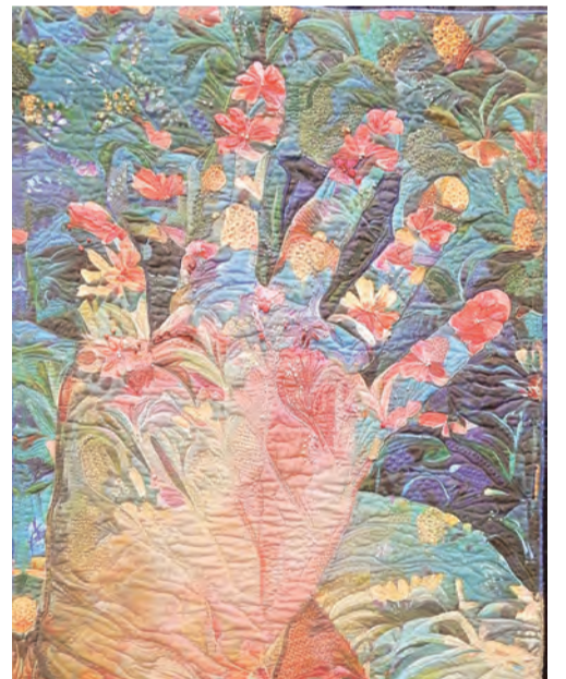
Inspiration: "The Creative Hand."