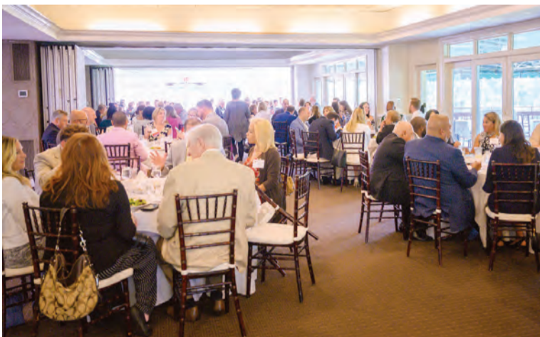
Attendees at GRCC's 2022 Awards for Chamber Excellence.

Hospital, Northwest Federal Credit Union, Dominion Energy, and Verity Commercial Real Estate sponsored the event. For more information about GRCC, visit RestonChamber.org or call 703-707-9045.