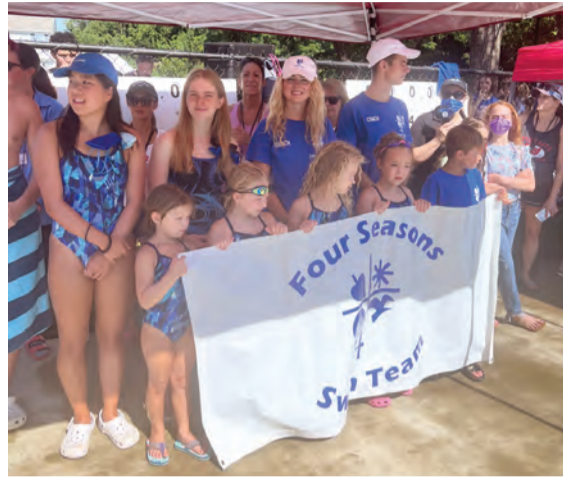
Four Seasons Swim Team.