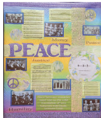
Peace & Brotherhood: "Peace and Harmony" honors voices worldwide joined for good.