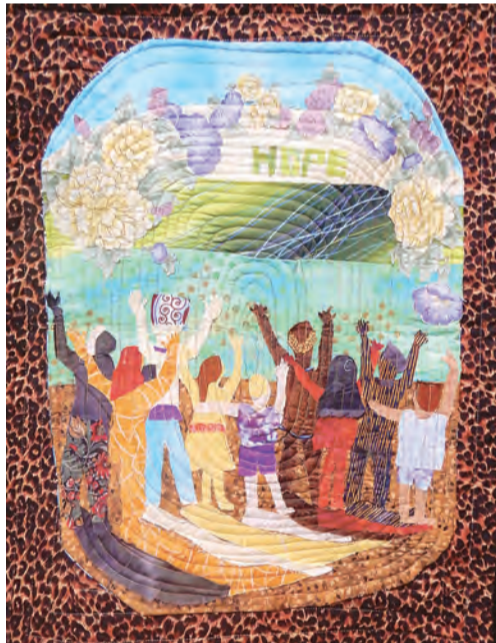
Peace & Brotherhood: "Hope" is in honor of the late Supreme Court Justice Ruth Bader Ginsburg.