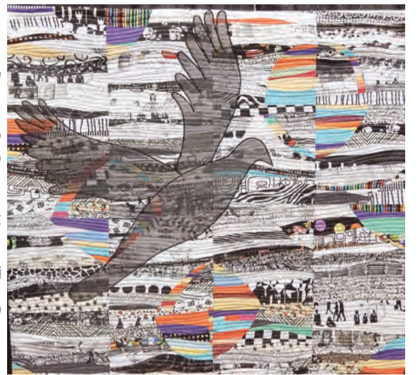
Inspiration: "The More Excellent Way: A Tribute to John Lewis," who promoted peace, love and nonviolence.