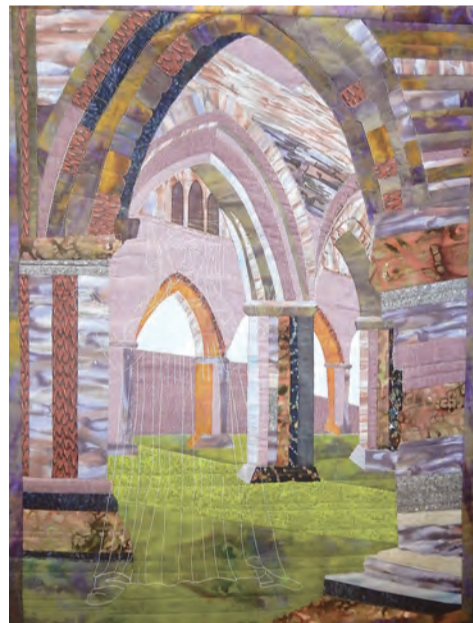
Inspiration: "Sweetheart Abbey" in Scotland.