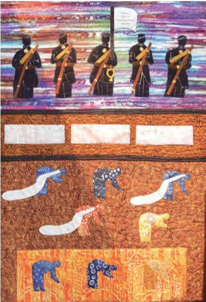
Peace & Brotherhood: "Up from Slavery" is about an enslaved couple who worked in the fields, but escaped to freedom in another state, where the husband joined the Union Army.