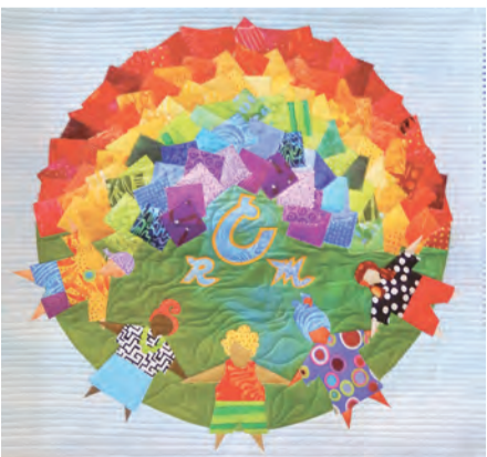
Peace & Brotherhood: "Remi's Rainbow" celebrates global diversity.