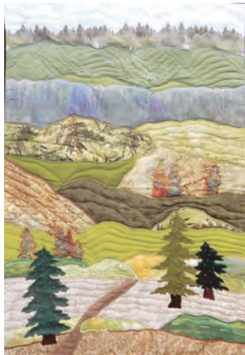
Joy: "Quiet Moment."