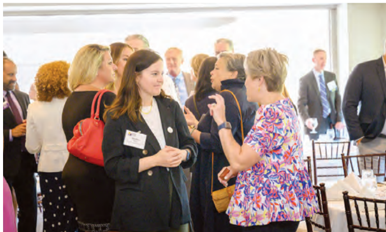
Attendees at GRCC's 2022 Awards for Chamber Excellence.