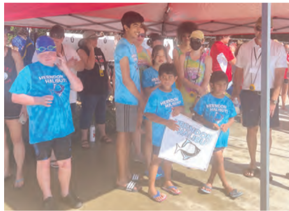
The Herndon Halibuts, Community Center.