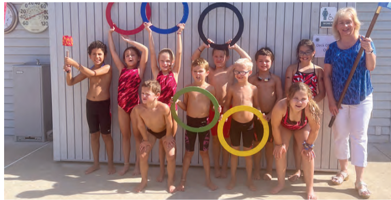
It is the Herndon Olympics for swimmers in the 2022 Herndon Swim League.

The final days of the Herndon Swim League season draw near. All-League Meets @ Four Seasons are July 23. Swimmers, take your mark.