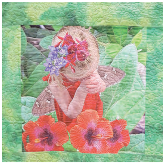
Joy: "Innocent Prayer" of a young girl.

❖ This week's photos, Part I, depict inspiration, peace and brotherhood, and joy. Part II, depicting the other themes, will be in next week's paper.