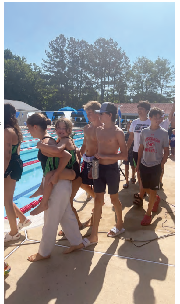
The 2022 Herndon Swim League swimmers at the July 23 Opening Ceremony of the Herndon Olympics.