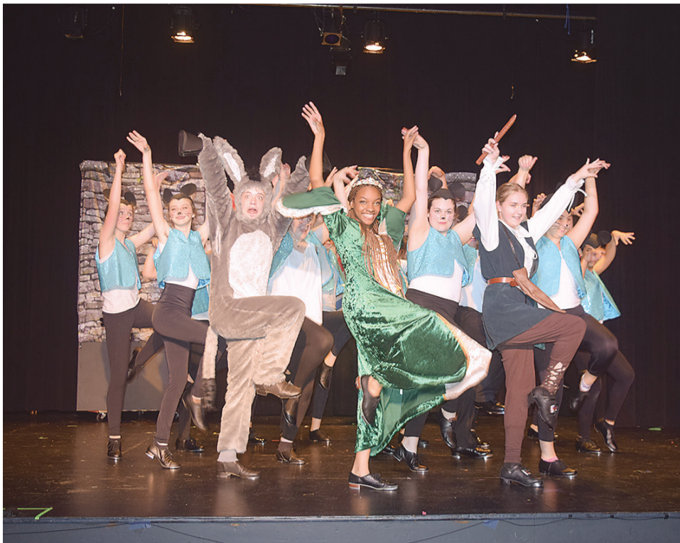
"Shrek the Musical!" will be performed on Aug. 5-7 at the Vienna Community Center in Vienna.