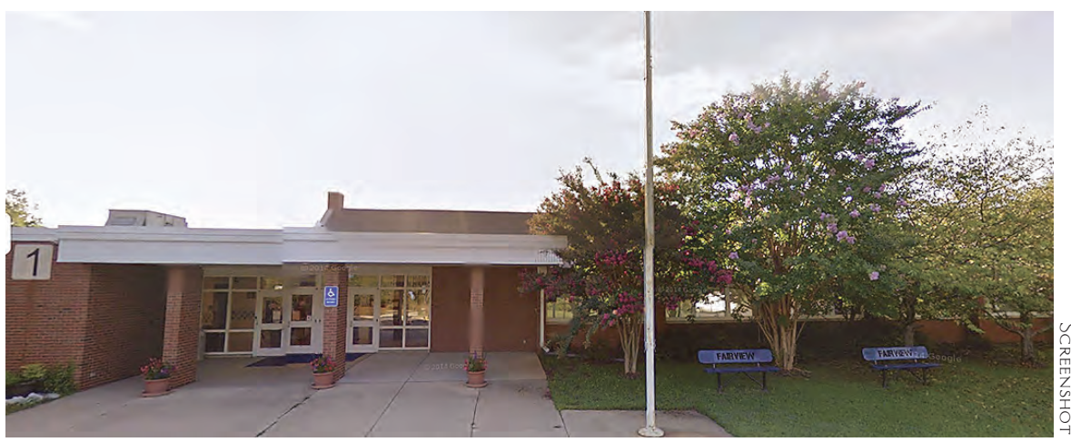
Fairview Elementary, Fairfax Station.