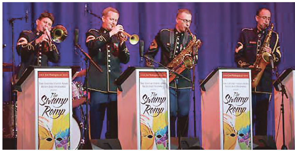
The Swamp Romp will play at Frying Pan Park in Herndon on Thursday, Aug. 18, 2022.