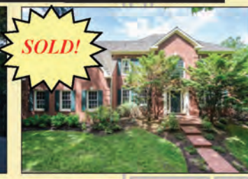
1506 Hardwood Lane McLean, 22101 $1,582,000