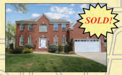
6932 Tyndale Street McLean, 22101 $1,905,000

We're seeing multiple contracts and escalations! Call to chat with JD today!