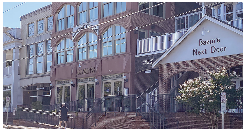
Historic Church Street