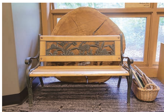
Wood from a tulip poplar tree that was struck by lightning was cut to make a bench.