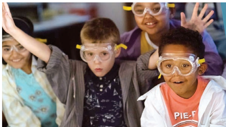
FCPS positions enhancements to eliminate gaps in equity and achievement for all students.

room for me (diversity-wise and employment-wise)? What will you say?