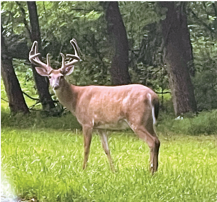
Fairfax County announced that its Deer Management Archery Program would begin Sept. 10, 2022, and run through Feb. 18, 2023.