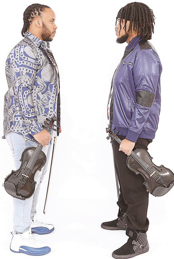
The Sons of Mystro will play at McLean Central Park on Saturday, Sept. 17, 2022.

Back to school supply drive. Drop off items at the National Council of Negro Women booth at the Reston Multicultural Festival, 11 a.m. - 6 p.m. Reston Town Center 11900 Market St., Reston. Collected by Reston-Dulles Section, National Council of Negro Women, Inc.