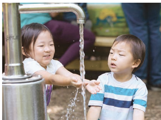
The water pump at Nature Playce.