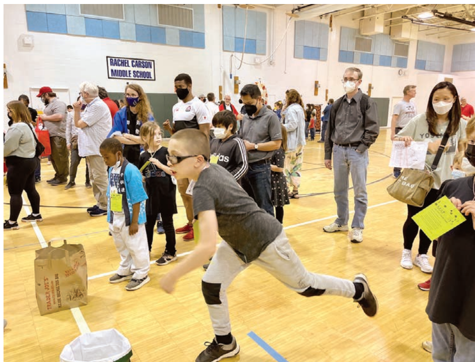
FCPS students—the Artemis generation.

Q2: The universe and the world beyond belong to all. Beyond being an astronaut or an engineer, how can students see a place for themselves in space-faring? Our children will ask inwardly and aloud, ‘Is there