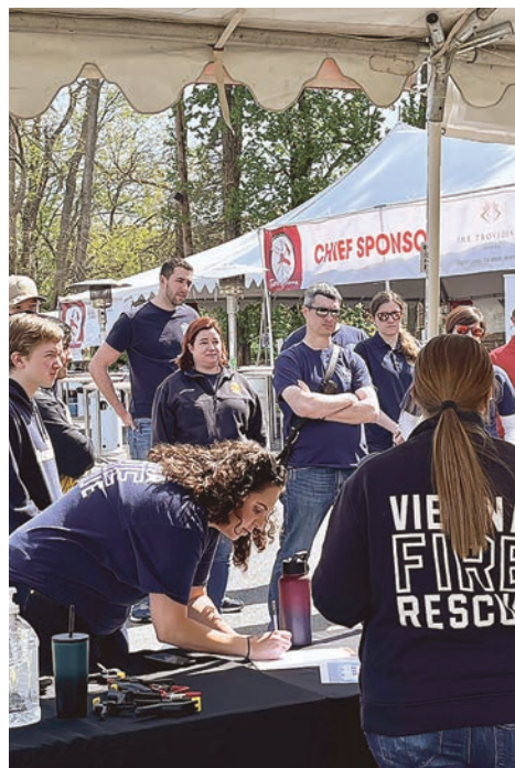
Vienna's volunteers are a town gem.