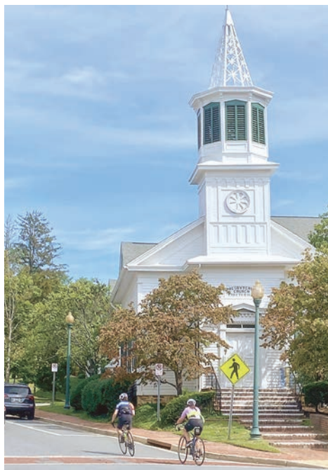
Vienna Presbyterian Church celebrated its 150th birthday in 2021.