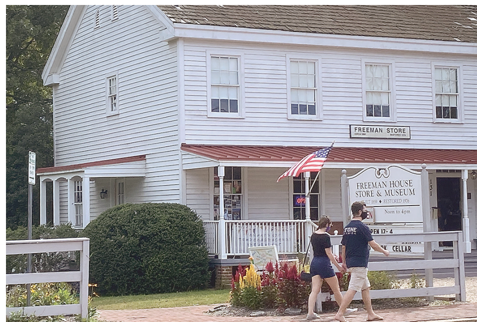
The Freeman Store and Museum, formerly the Lydecker Store, is a historic general store located in the Town of Vienna.