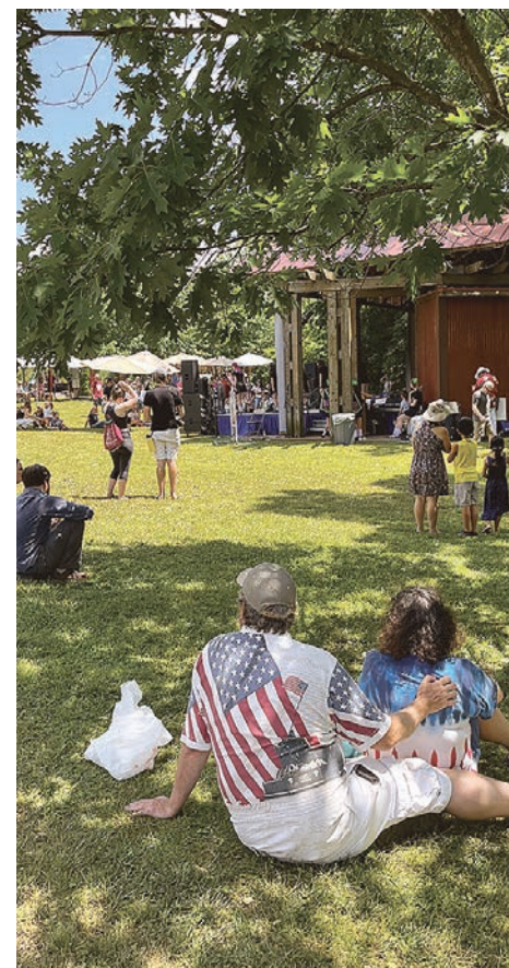
Vienna Town Green is a gem for concerts and sitting in the shade.