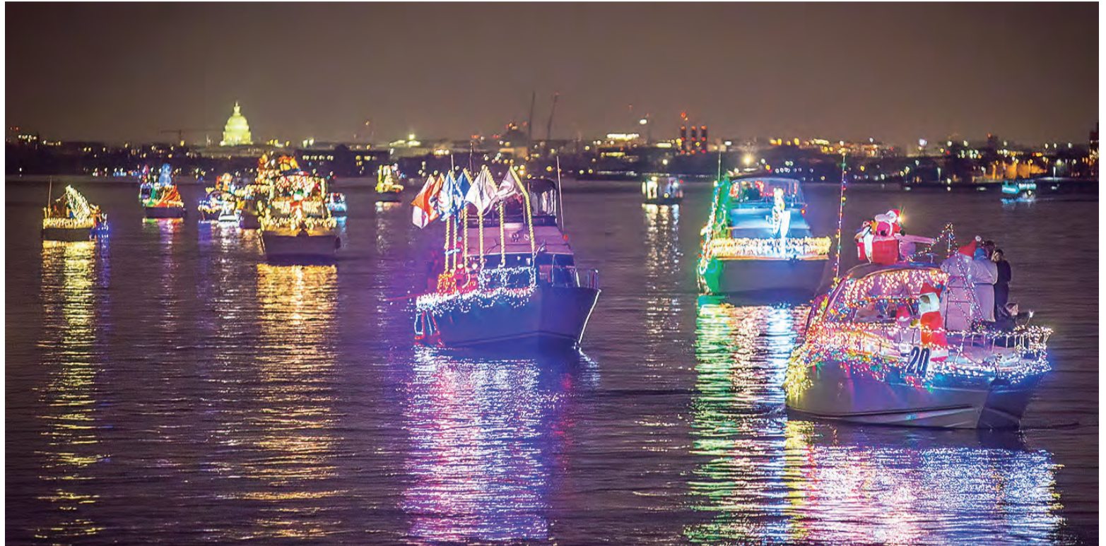
The Holiday Boat Parade of Lights will take place Saturday, Dec. 3, 2022 in Alexandria.

Fairfax City Holiday Market. Fridays, Saturdays and Sundays. The Fairfax City Downtown Holiday Market will be open the first two weekends of December on Friday, Saturday and Sunday. Shop at the market of craft vendors as you enjoy Old Town Square in the heart of Historic Downtown Fairfax covered in holiday lights. The festival will include live holiday music, hot drinks, heated tents and gourmet