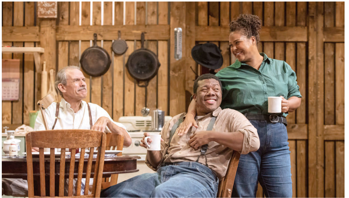
"The Rainmaker" will appear at 1st Stage in Tysons through Dec. 11, 2022.