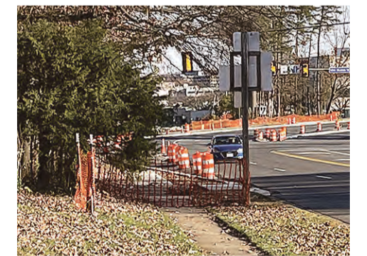
Construction for sidewalk access at the intersection of Van Buren Street and Herndon Parkway, located one block from the new Herndon Station on the Silver Line, is pending completion.

block from Herndon Station. “My goal was to have it completed when the station opened, but we couldn’t get it done,” Ashton said.