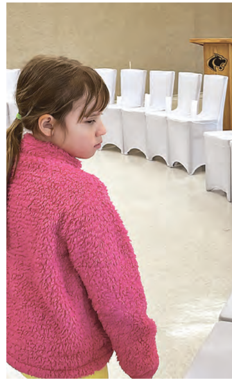
And looks back