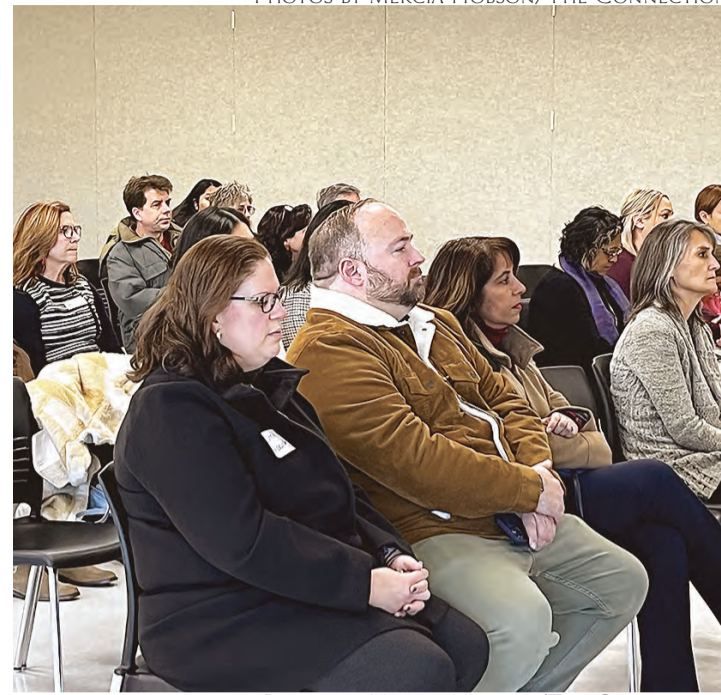
Representatives of the Fairfax County School Board at a day of remembrance for vulnerable pedestrians organized by Northern Virginia Families for Safe Streets. https://novasafestreets.org/