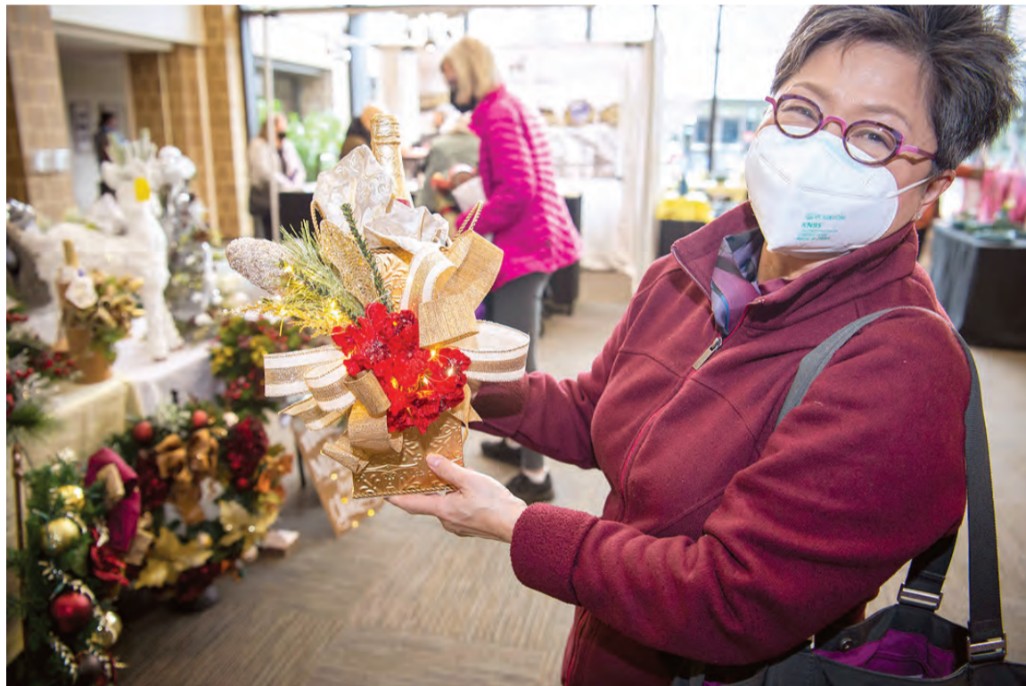
The McLean Holiday Art & Crafts Festival will take place Dec. 2-3, 2022 at the McLean Community Center.