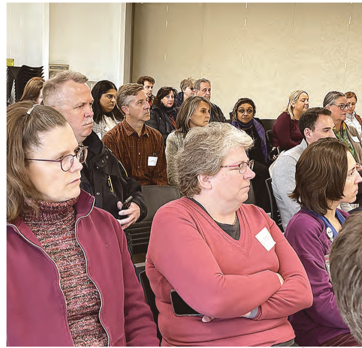
The crowd listens at a day of remembrance organized by Northern Virginia Families for Safe Streets. https://novasafestreets.org/ .