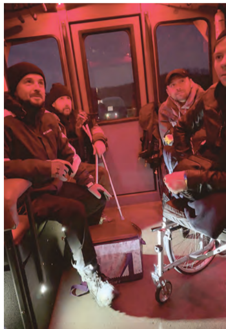
The group huddles in the warmth of the cabin after leaving the dock.