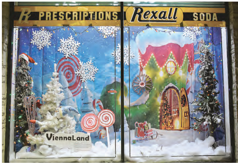
The Town of Vienna is sponsoring a Holiday Decorating Contest.