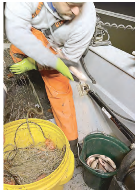
The crew hauls in the nets and removes Shad and Carp for use as bait during the day's fishing excursion.