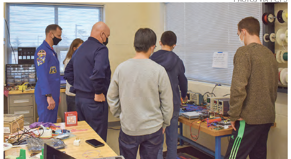
General John W. “Jay” Raymond checks out TJREVERB during a Space Force visit to TJ.

VIENNA/OAKTON / MCLEAN CONNECTION ❖ NOVEMBER 30 - DECEMBER 6, 2022 ❖ 3