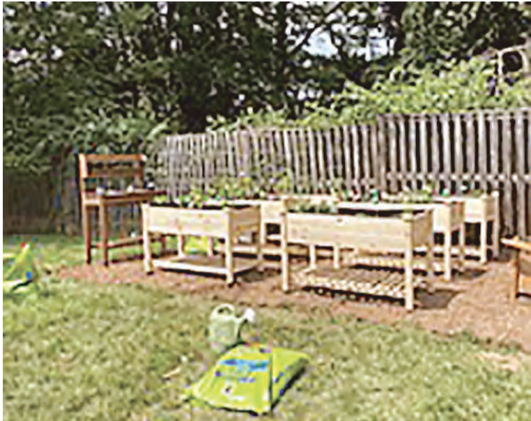
FILE PHOTO CONTRIBUTED

OPEN NOW THROUGH EARLY JANUARY PURCHASE YOUR TICKETS TODAY! NOVAPARKSLIGHTS.COM