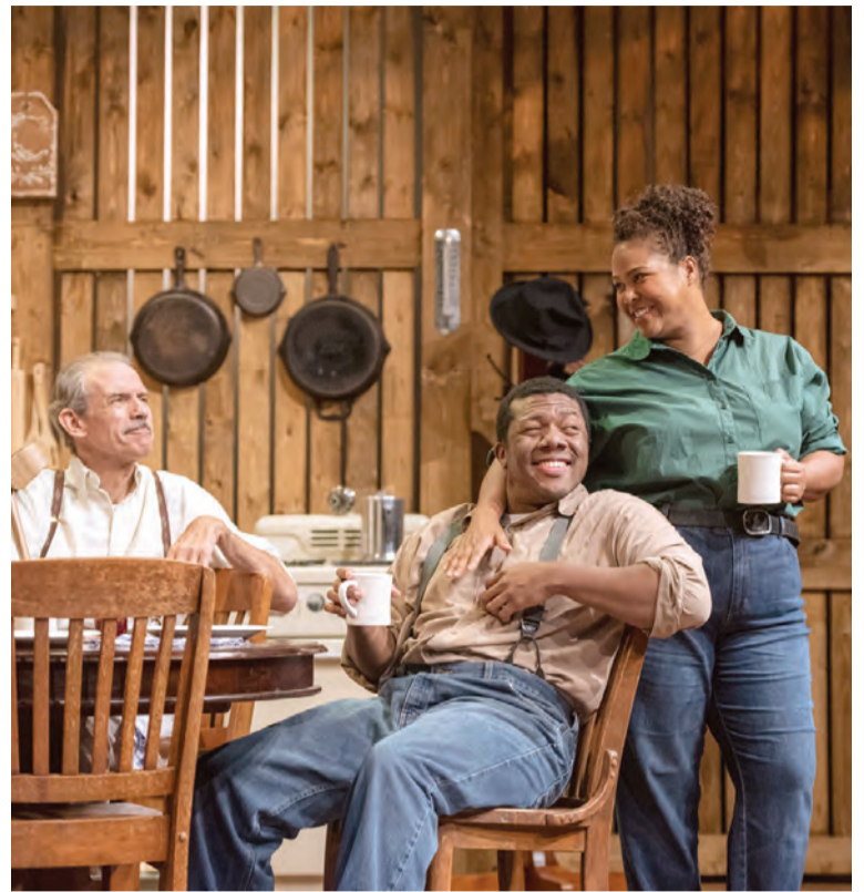
"The Rainmaker" will appear at 1st Stage in Tysons through Dec. 11, 2022.

Langley High Feaste. 7 p.m. At Langley High School, McLean. With the approach of the holidays, students