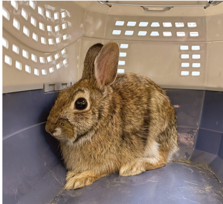
Tuesday morning April 11, AWLA Officers Elpers and Murray were able to catch one of the rabbits shot with a blow dart on N Barton Street.

Reminder: if you have any information about this situation, or you see another rabbit with a dart embedded, please call AWLA immediately at 703-931-9241.