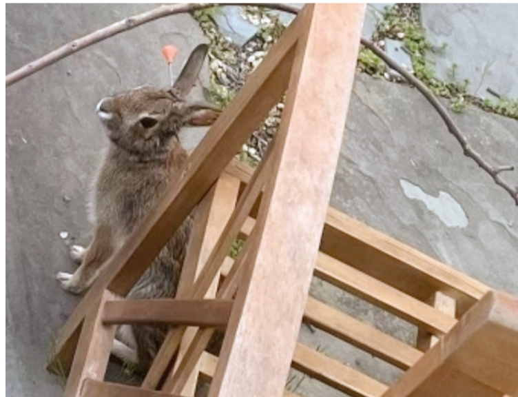
Blow dart visible on the side of the rabbit's head.