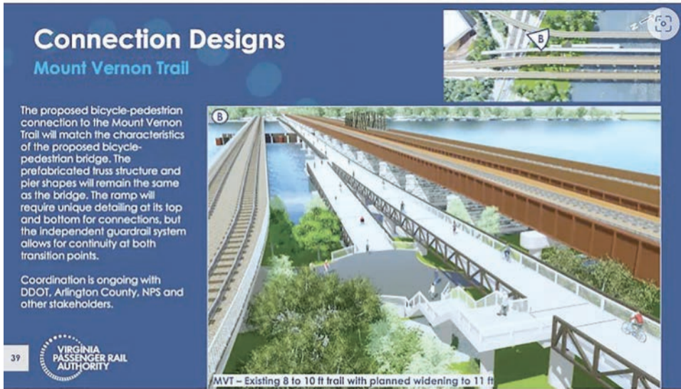
The Arlington Mount Vernon Trail side plan, as explained on one of the slides.