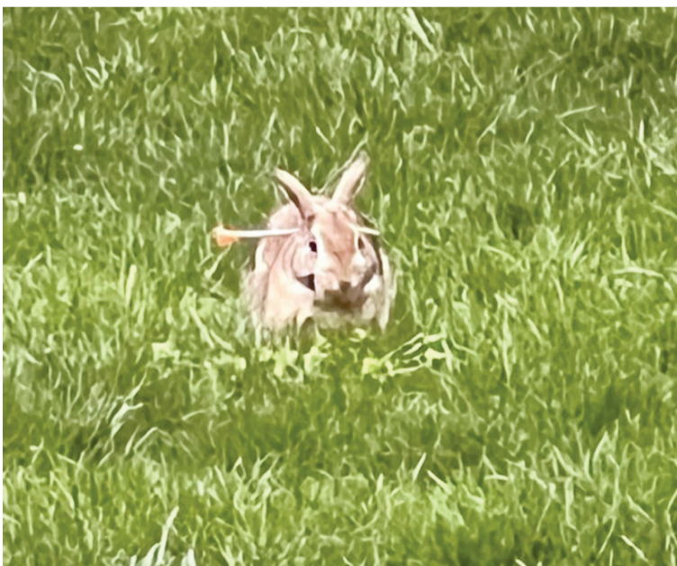
This rabbit had a blow dart stuck through the head area.