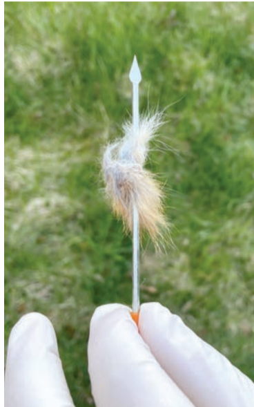
The dart dislodged itself while the rabbit was in the net, but the rabbit's fur is still attached.

past 12 months AWLA has discovered the use of projectiles or blow darts on wildlife. AWLA asks that anyone with knowledge of these incidents or sightings of these rabbits please contact Animal Control immediately at 703-931-9241. Please do not attempt to chase the rabbits.