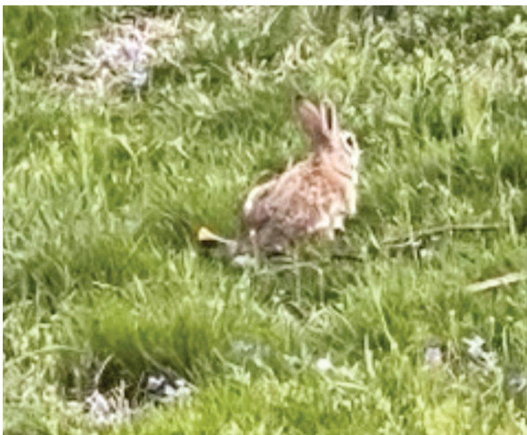
This rabbit had a blow dart stuck in its side.