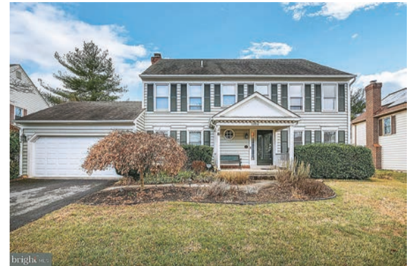
7 1006 Willowleaf Way — $929,500