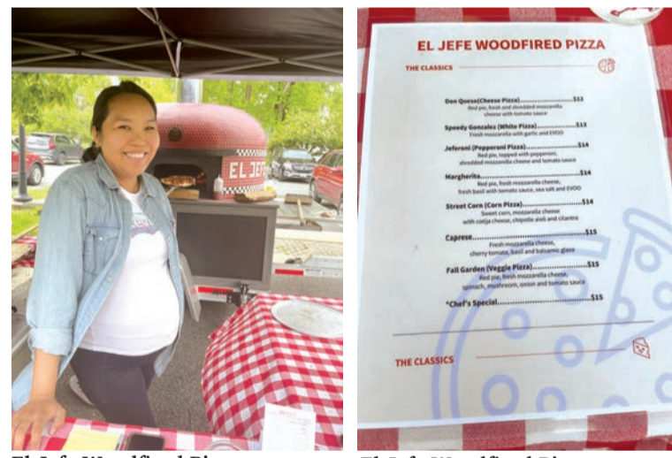
El Jefe Woodfired Pizza