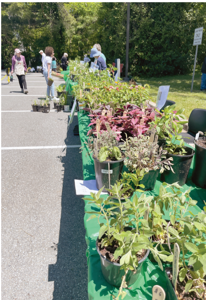
Plant sale by the Potomac Garden Club held at the Potomac library last Saturday, May 6. Large selection of native plants and other plants, raising funds to help maintain the grounds of the Potomac Library.