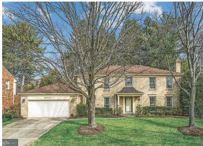
4 8725 Wandering Trail Drive — $1,025,000