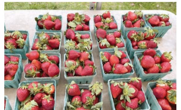
Strawberries from McCleaf Orchards

Potomac Village Farmers Market is hosted by the Potomac United Methodist Church at 9908 S Glen Rd, Potomac, MD 20854, at the corner of S. Glen and Falls roads. The market offers fresh seafood, art, plants and cut flowers, fruit and vegetables, fresh baked desserts, breads and rolls, home made meals, wood fired pizza and more. It's a small market, not too small, not too big, just right.