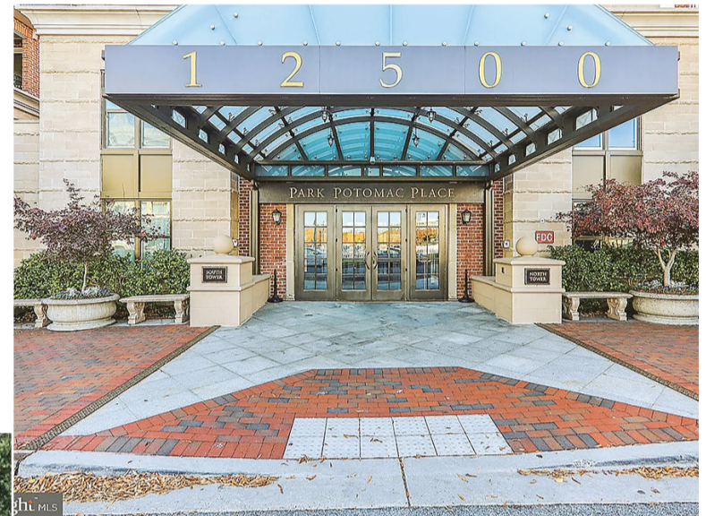
2 12500 Park Potomac Avenue #702N — $1,060,000 3 12500 Park Potomac Avenue #208 — $1,040,000