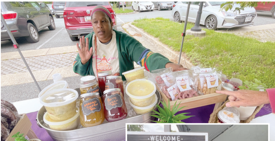
Kora Lee's Dessert Cafe, https://www.koralees.com/