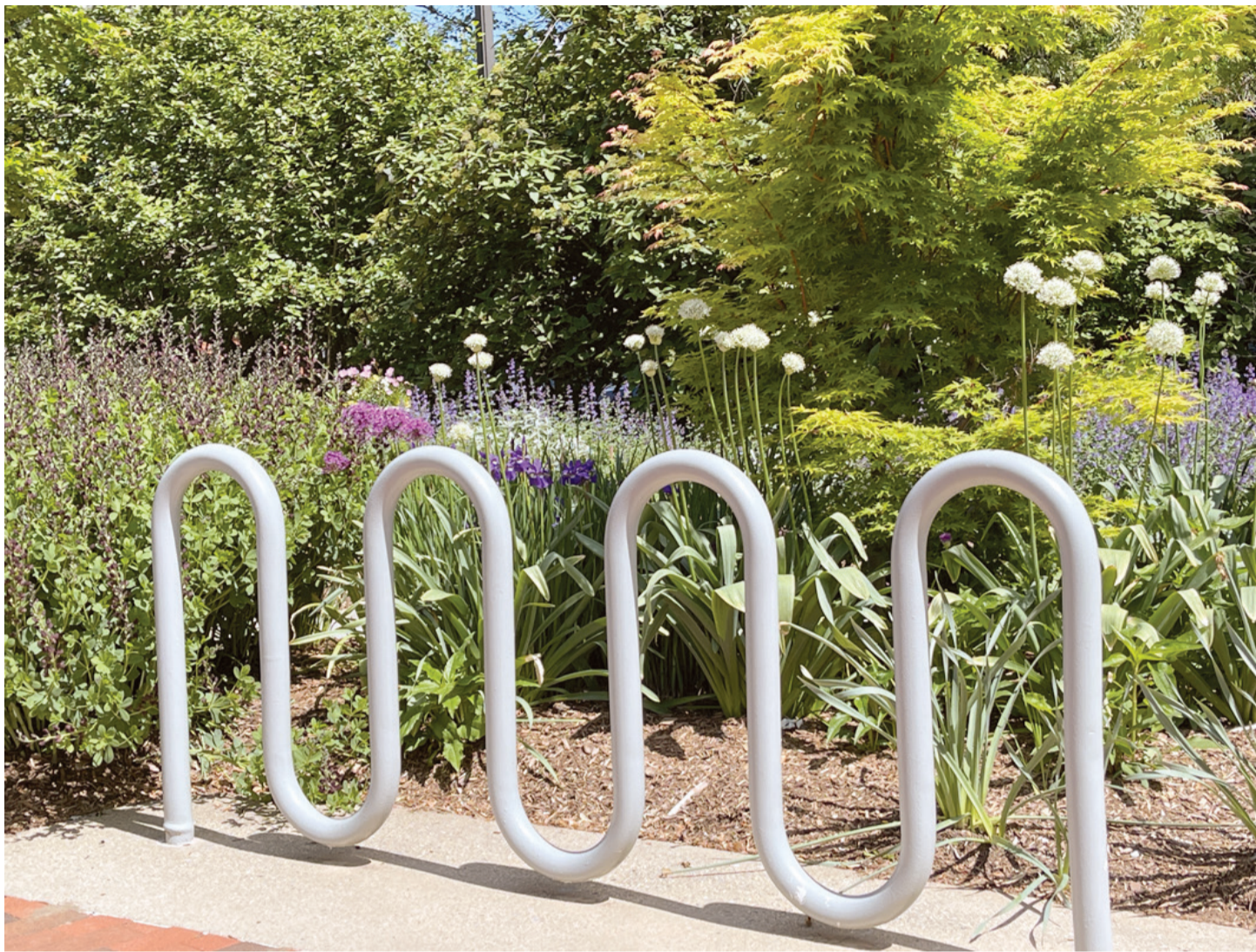
The Potomac Garden Club plants and maintains the grounds of the Potomac Library.