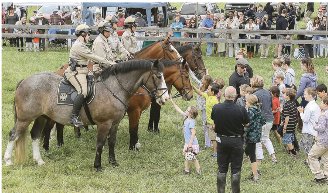
Mounted police offer a chance for families to greet horses.

BENEFITTING TAPS. The Tragedy Assistance Program for Survivors (TAPS) is the national organization providing compassionate care for the families of America’s fallen military heroes and has offered support to more than 100,000 surviving family members of our fallen military and their caregivers since 1994. TAPS provides peer-based emotional support, grief and trauma resources, grief seminars and retreats for adults, Good Grief Camps for children, case work assistance, connections to community-based care, online and in-person support groups, and a 24/7 resource and information helpline for all who have been affected by a death in the Armed Forces. Services are provided free of charge. For more information and resources go to TAPS.org or call the 24/7 TAPS National Military Survivor Helpline at 800-959-TAPS.