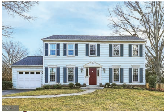
8 6 ROYAL OAK Court — $908,000