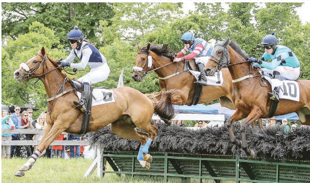
Horses race around the turf jumping steeplechase fences at top speed together.