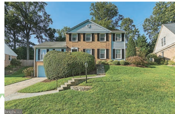
6 8112 Whites Ford Way — $950,000

Address.....BR FB HB Postal City.....Sold Price... Type.....Lot AC. Postal Code ... Subdivision..... Date Sold