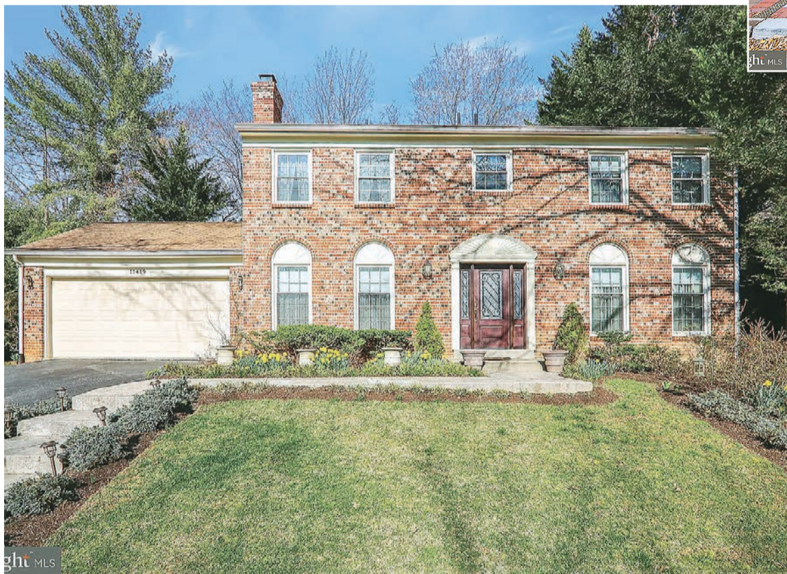
1 11419 Bedfordshire Avenue — $1,165,000