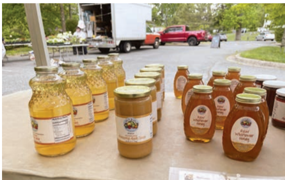
Honey and juice from McCleaf's.

Westmoreland Produce is a family owned and operated farming business that offers a good variety of fresh local produce, with over 20 years of experience with farmers markets around the area. https://www.westmorelandproduce.com/