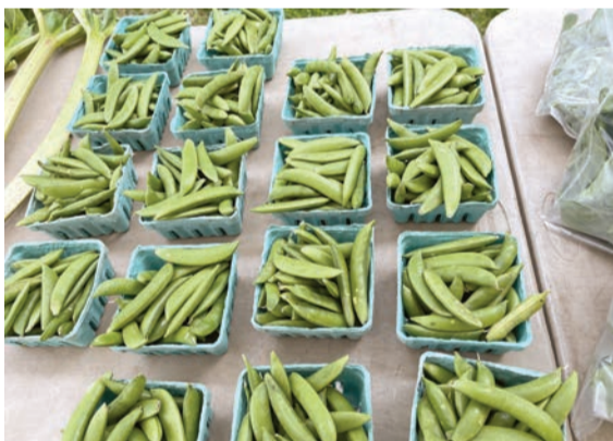
Snap peas from McCleaf