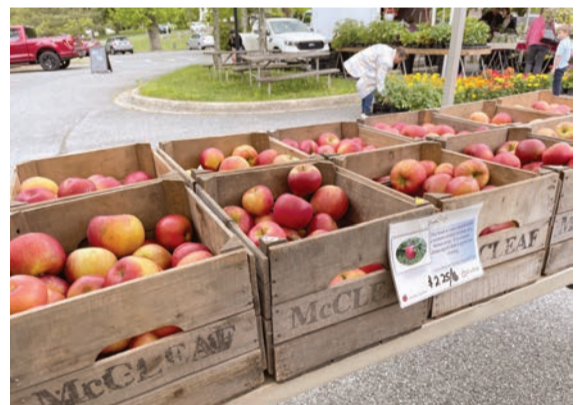
Apples from McCleaf Orchards