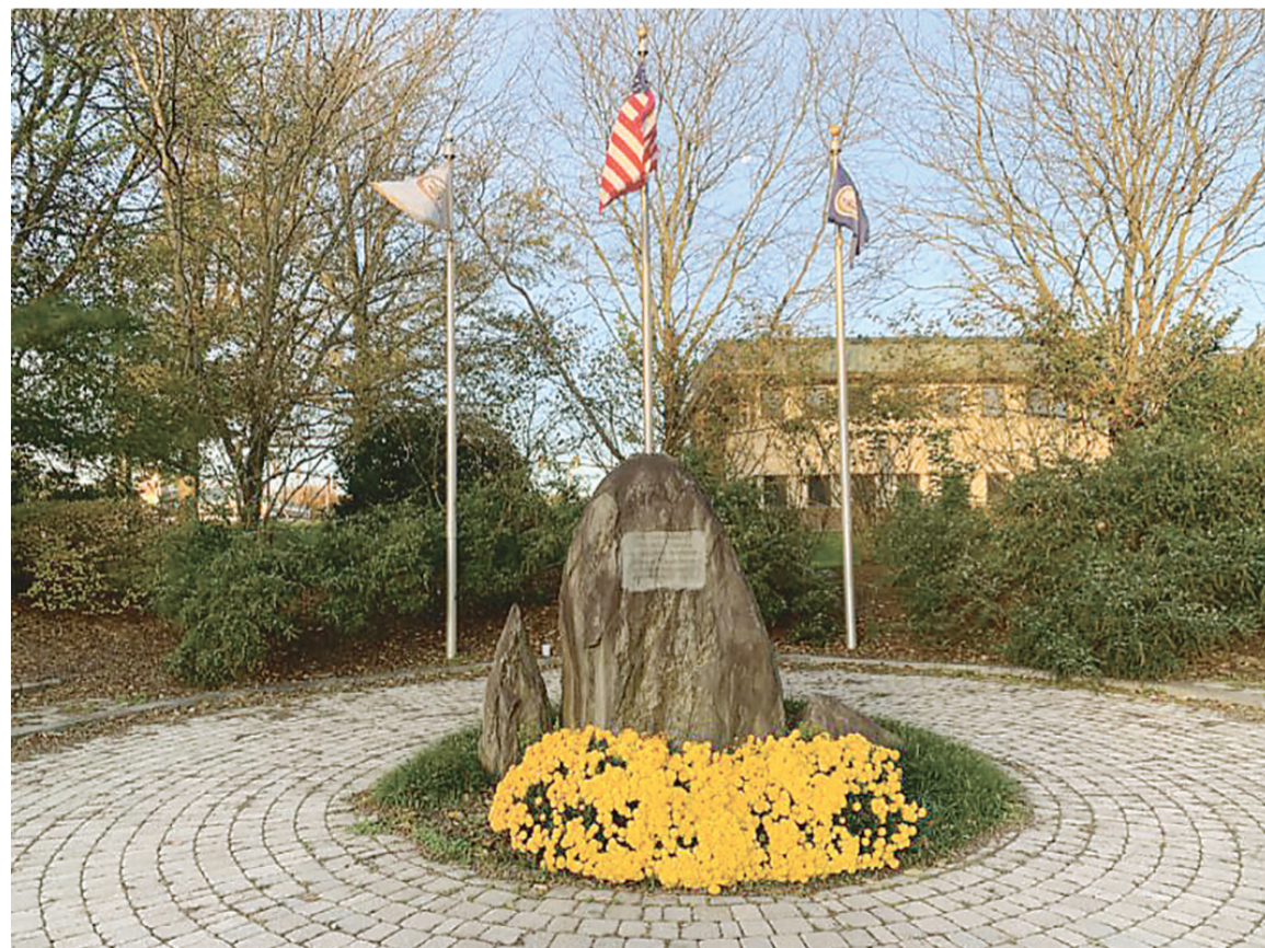
A Memorial Day Ceremony will take place Monday, May 29, 2023 at the Great Falls Freedom Memorial in Great Falls.