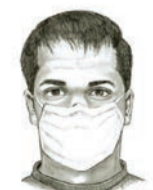
Sketch of Suspect

Anyone with information about this event is asked to call the Major Crimes Bureau at 703-246-7800, option 3. Tips may also be submitted anonymously via Crime Solvers by phoning 1-866-411-TIPS (866-411-8477).