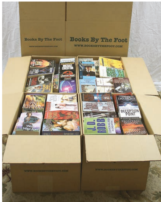
Used book sales will be held June 1-4, 2023 at Tysons Pimmit and Richard Byrd Libraries.