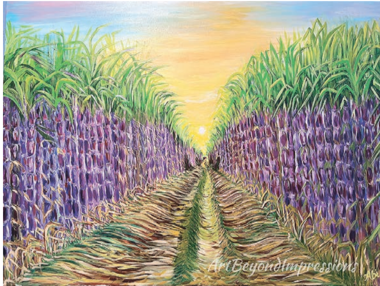
The Falls Church Arts All Member Show L-Z will be held May 27 to June 25, 2023 in Falls Church.

"Urinetown." 7:30 p.m. At Workhouse Arts Center, 9518 Workhouse Way, Lorton. In a Gotham-like city, a terrible water shortage, caused by a 20-year drought, has led to a government-enforced ban on