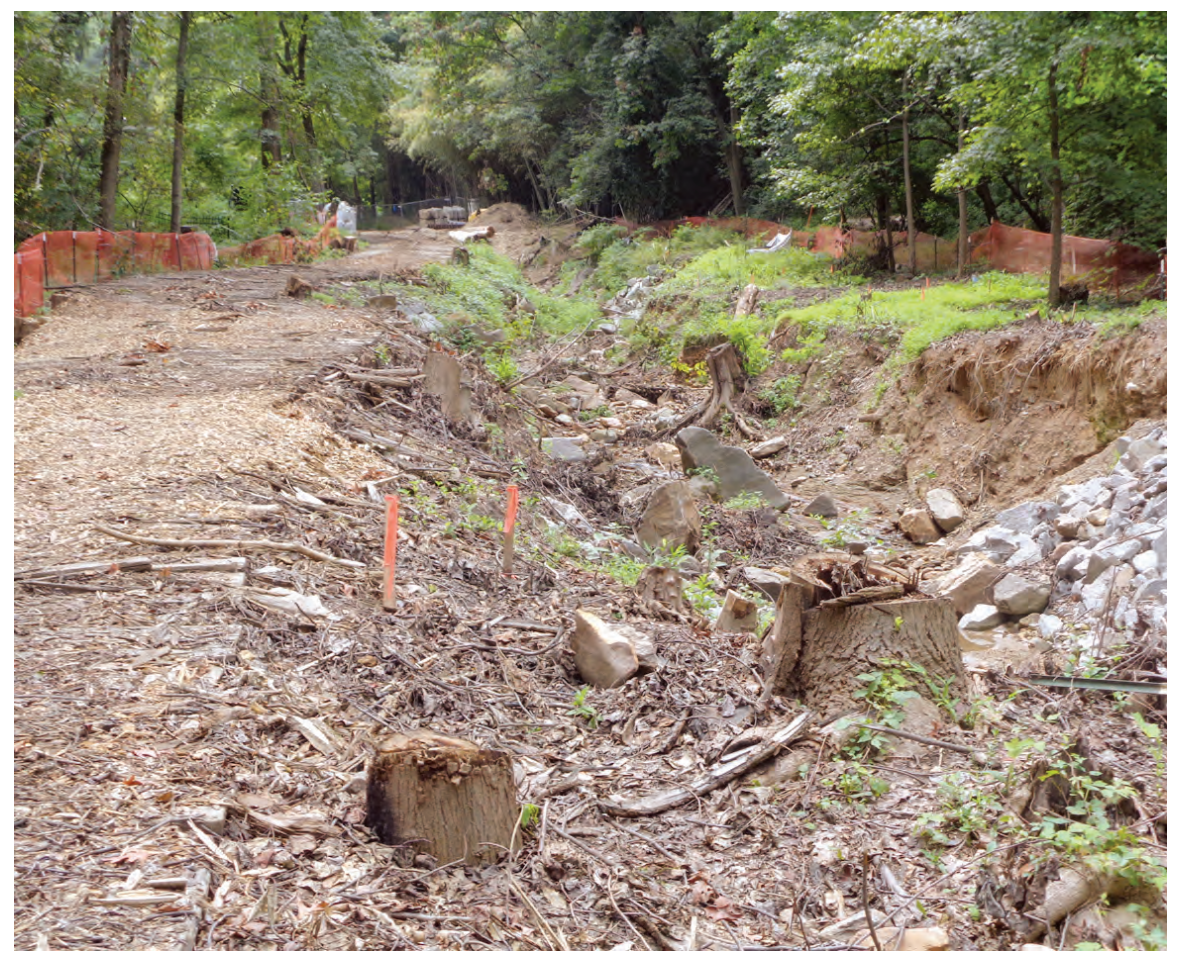
AFTER: Trib B of the Donaldson Run after the tree removal as the "restoration" process begins.