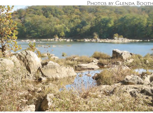
The Potomac River near Great Falls.