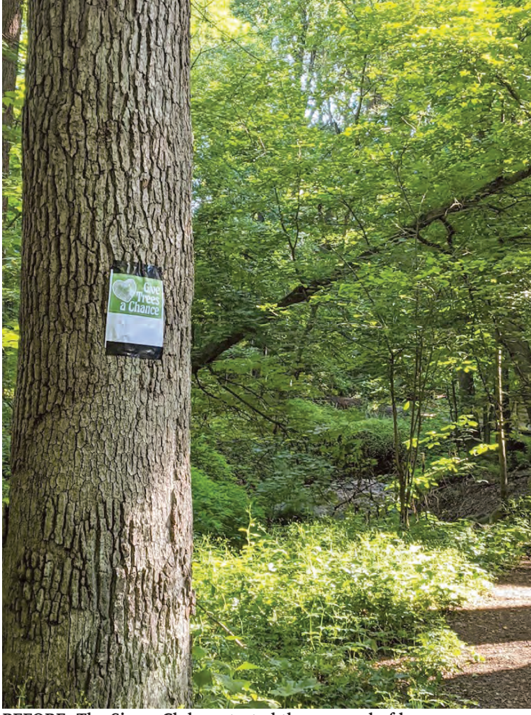
BEFORE: The Sierra Club protested the removal of large canopy trees like this one with a sign: Give Trees a Chance.

amined but the Donaldson Run impervious cover, such as perme- ably notes, protecting the buried