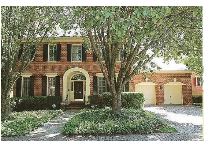
6 7805 Hidden Meadow Terrace