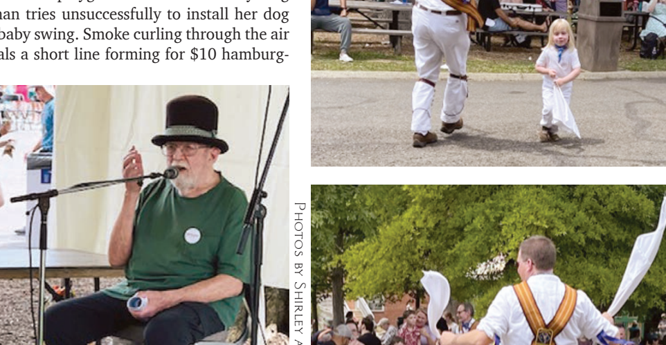
entertaining the audience with captivating stories.