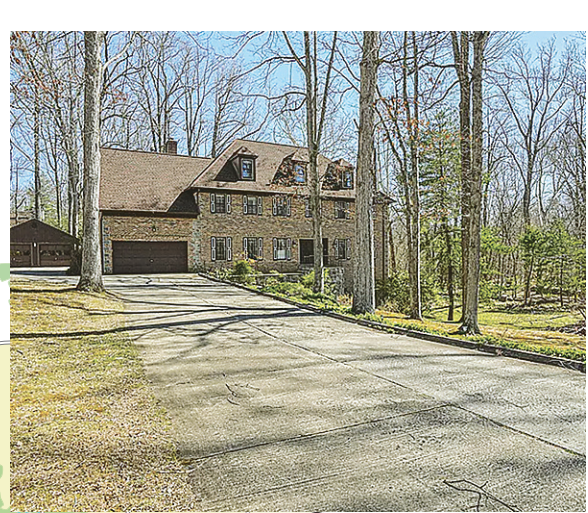
4 8628 Chateau Drive - $1,550,000

BR. FB. HB.. Postal City... Sold Price... Type...... Lot AC . Postal Code...... Subdivision...... Date Sold ....5 ....4 ....1 .....POTOMAC .....$1,600,000 .....Detached .... 0.35 .........20854 ........POTOMAC VILLAGE ......04/18/23 3 9726 BEMAN WOODS WAY .4 ....4 ....1 .....POTOMAC .....$1,575,000.....Detached..... 0.17.............20854..... 4 8628 CHATEAU DR............6 ....5 ....1 .....POTOMAC .....$1,550,000.....Detached ..... 2.19 ............20854 .....................MCAULEY PARK ..............04/21/23 12807 MAIDENS BOWER DR.5 ....4 ....1 .....POTOMAC .....$1,480,000 .....Detached ..... 2.00 ..................20854 .............ESWORTHY PARK .......04/18/23 8 9521 ACCORD DR...........4 ....2 ....2 .....POTOMAC .....$1,385,000.....Detached..... 1.03..........20854.........POTOMAC VILLAGE......04/12/23 COPYRIGHT 2023 MARKETSTATS FOR SHOWINGTIME. SOURCE: BRIGHT MLS AS OF APRIL 30, 2023. http://potomacalmanac.www.clients.ellingtoncms.com/news/2023/may/15/potomac-home-sales-april-2023/