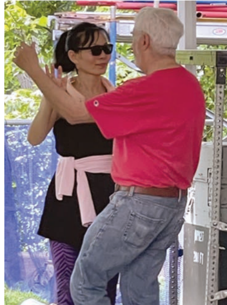
This couple dances to Diangolaya who are playing hot jazz club music, at the Crystal Pool Stage on Saturday.