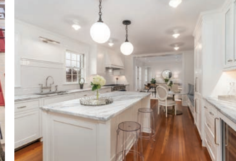
Old Town | $3,495,000

Circa 1840 Victorian gem has been masterfully reimagined by architect Val Hawkins. The double parlor features high ceilings, a spectacular bay window, and woodburning fireplace. A spacious dining room also has a wood-burning fireplace plus patio access. The heart of the home showcases a top-of-the-line chef's kitchen and the adjoining family room offers direct access to the brick-walled patio. 500 Duke St Lauren Bishop 202.361.5079