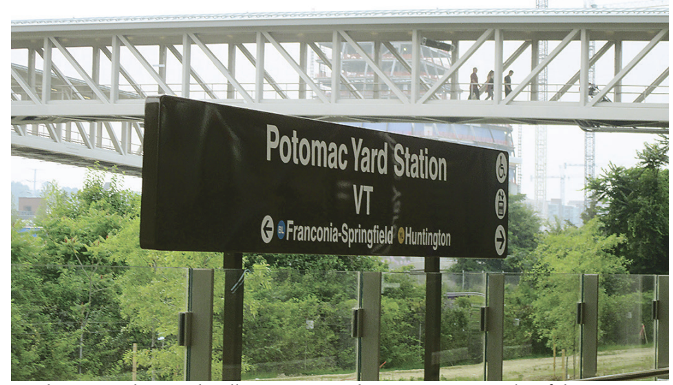
An aboveground covered walkway connects the two entrances/exits of the new Potomac Yard Metro station.

At the opening, local officials said it would generate billions in new private sector in-