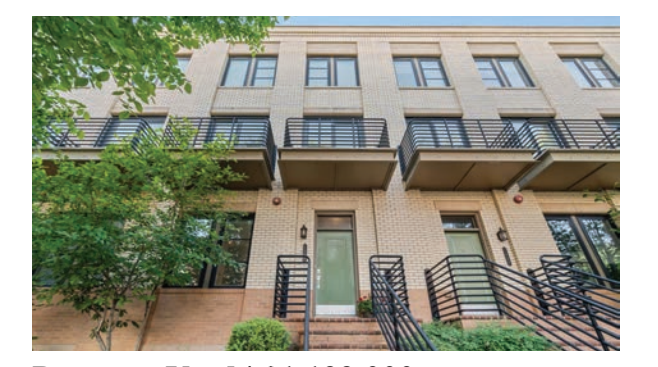
Potomac Yard | $1,199,000 This 4-level, 3-bedroom, 4.5-bath townhouse is the

perfect blend of space and comfort. The open floorplan seamlessly connects the living area with the kitchen and dining area, making it perfect for entertaining guests. 1426 Van Valkenburgh Lane Darlene Duffett 703.969.9015