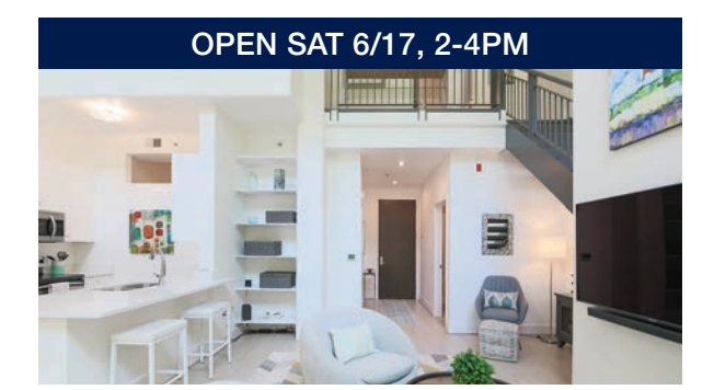
Carlyle Square | $735,000

This spacious 4-bedroom, 2.5-bath home offers ample living and entertaining areas. The brand new kitchen & full bath on the main floor exude modern elegance. Outside, the property boasts a huge backyard, brick patio, and screened-in porch. 8606 Cyrus Place Kate Bertles Hennigan 202.321.3427 www.KateBertlesHennigan.com