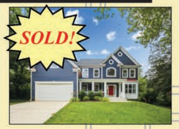
1639 Macon Street McLean, 22101 $2,215,000