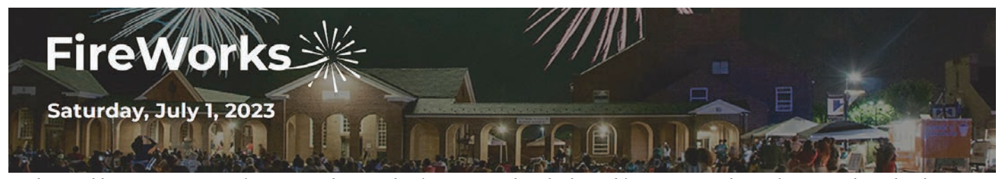
At the Workhouse Arts Center in Lorton, they are having a pre-July 4th show this year, Saturday, July 1. See the calendar on page 13 for other local fireworks, including Vienna, Great Falls, Reston and more.

According to the county, "consumer fireworks legally permitted for sale and use in Fairfax County are known as permissible fireworks," the website states. But that's where they draw the line, and they list illegal fireworks as well. "Aeri-