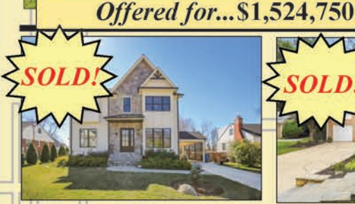
6631 Tucker Avenue McLean 22101 $1,824,750

6013 Woodland Terrace McLean, 22101 $1,399,000