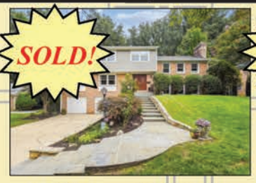
1562 Forest Villa Ln McLean, 22101 $1,550,000