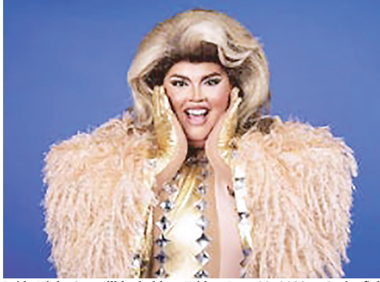
Pride Night Out will be held on Friday, June 23, 2023 at Springfield Town Center.

Shenandoah Conservatory Sundays, June 11 – August 27 7:00 p.m. – 8:00 p.m. Reston Town Square Park