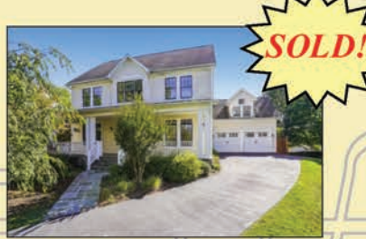
2204 Beacon Lane Falls Church, 22043 $1,795,000

Curious what your home is worth? Call to chat with JD and Ed today