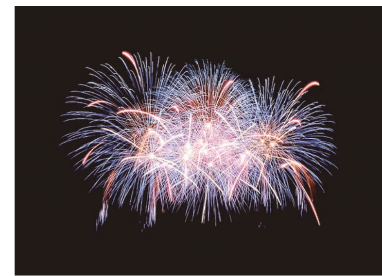
Independence Day Fireworks will be held on June 30 and July 1 at George Washington's Mount Vernon.