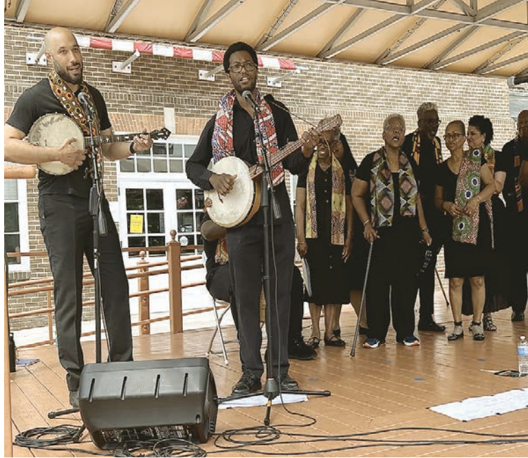
The Washington Revels Jubilee Voices perform traditional African American music as part of the Juneteenth celebration June 19 in Market Square.