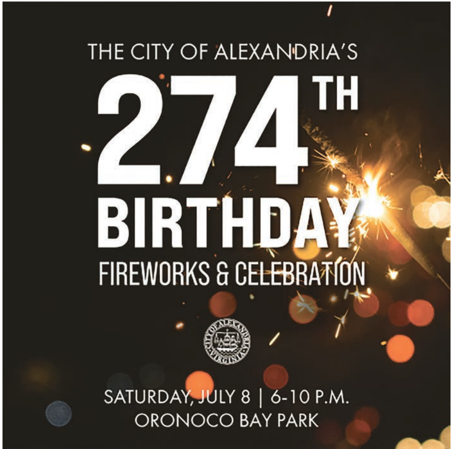
The City of Alexandria celebrates its 274th birthday on Saturday, July 8, 2023.