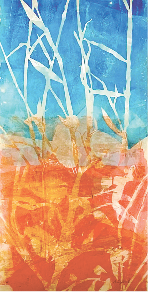
The Hues Exhibit will be held July 1-30, 2023 at the Van Landingham Gallery at Torpedo Factory Art Center in Alexandria.

Free Concerts. Wednesdays from 4-7 p.m. At Old Town Alexandria waterfront. Join in the Waterfront Wednesday Music Series featuring a range