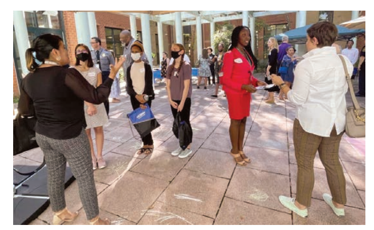
Alexandria's Youth Leadership Conference 2022.