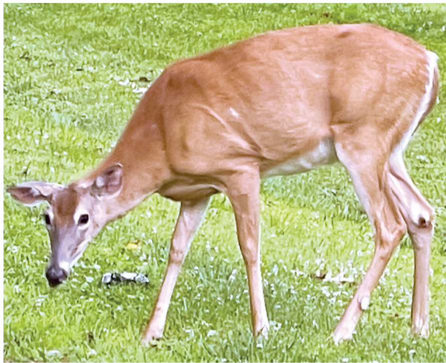
Give feedback on Arlington's Deer Management Plan at a meeting July 11 or online by July 18.