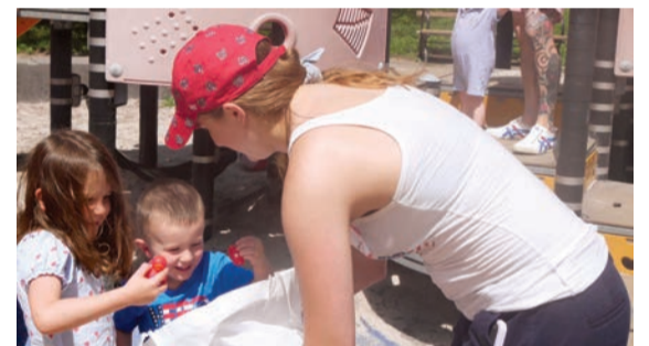
The circulating white bag is full of rubber ducks of all varieties. A small hand plunges deep into the bag. "That's a good one. I would have picked a yellow one, too."