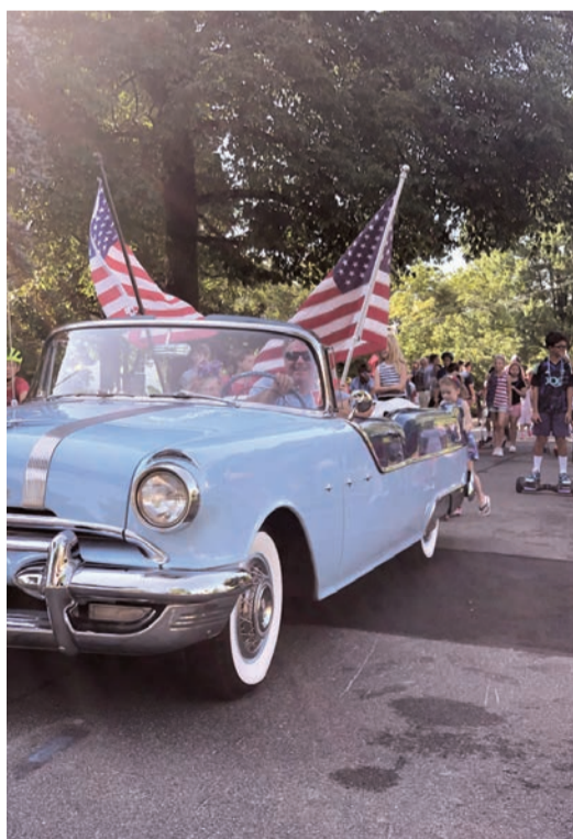
The antique convertible always dresses up the parade.

But some things endure: the allure of donuts and stickers and flags, a small town parade and block party, and pride in the red, white and blue.