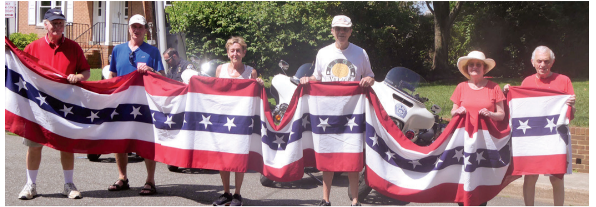
The group of Lyon Village regulars carries the 4th of July banner that traditionally opens the neighborhood parade.