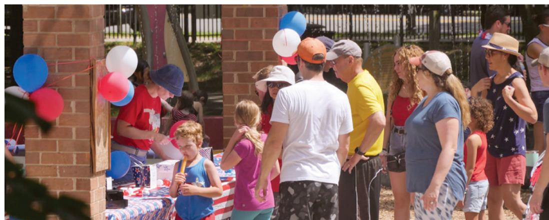
The popsicle table at Lyon Park offers a welcome relief at the end of a hot walk along the parade route on Tuesday morning.