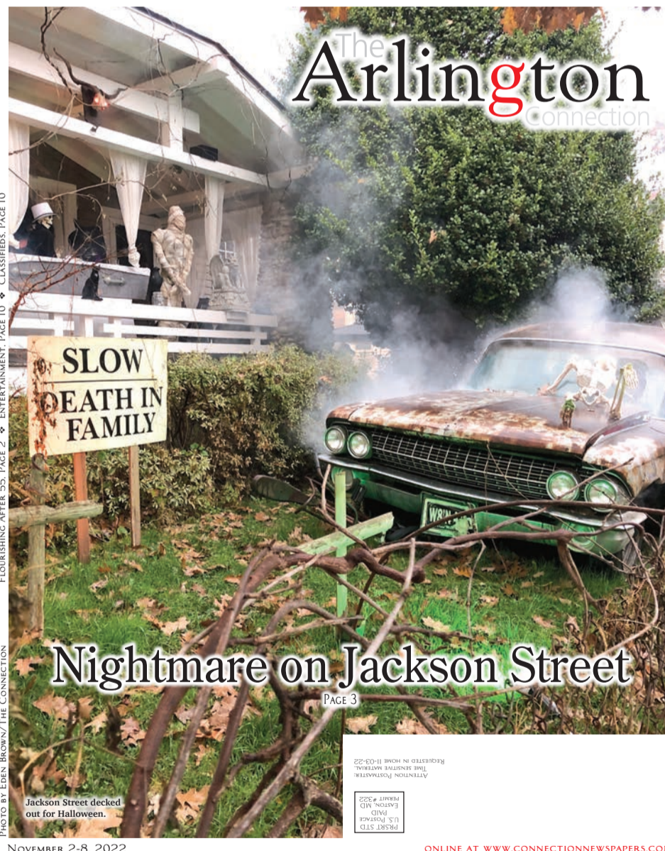
NOVEMBER 2-8, 2022

SEE CONNECTION, PAGE 8 WWW.CONNECTIONNEWSPAPERS.COM