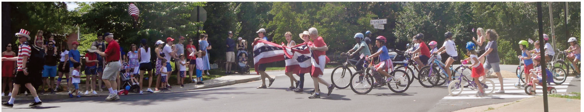
Bicycles, wagons, and skipping feet head down Highland Street to Lyon Park as neighbors stand along the sidewalks waving and clapping as the parade marches by. A squadron of ACPD police cars bookends the parade.