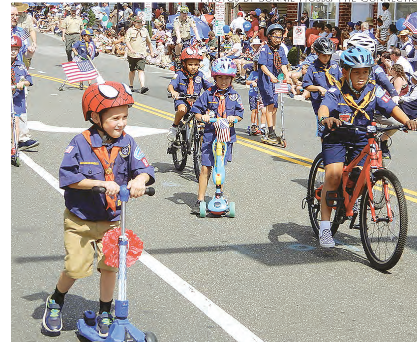
Cub Scout Pack 882 members riding bikes and scooters.