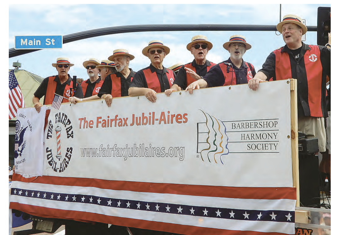
The Fairfax Jubilaires singing barbershop harmony.