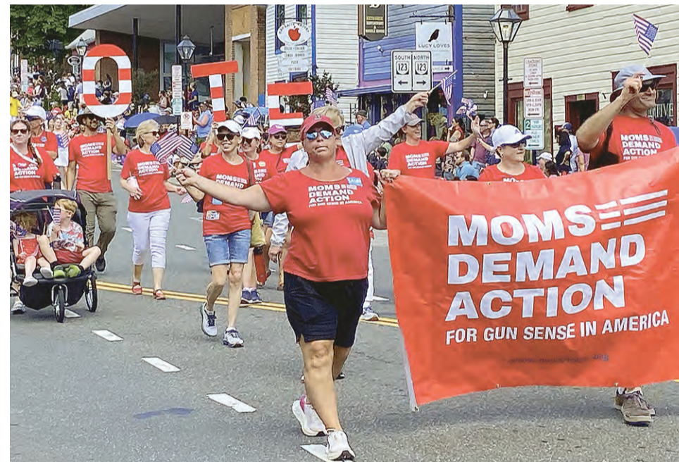
Moms hoping for a brighter future in America.