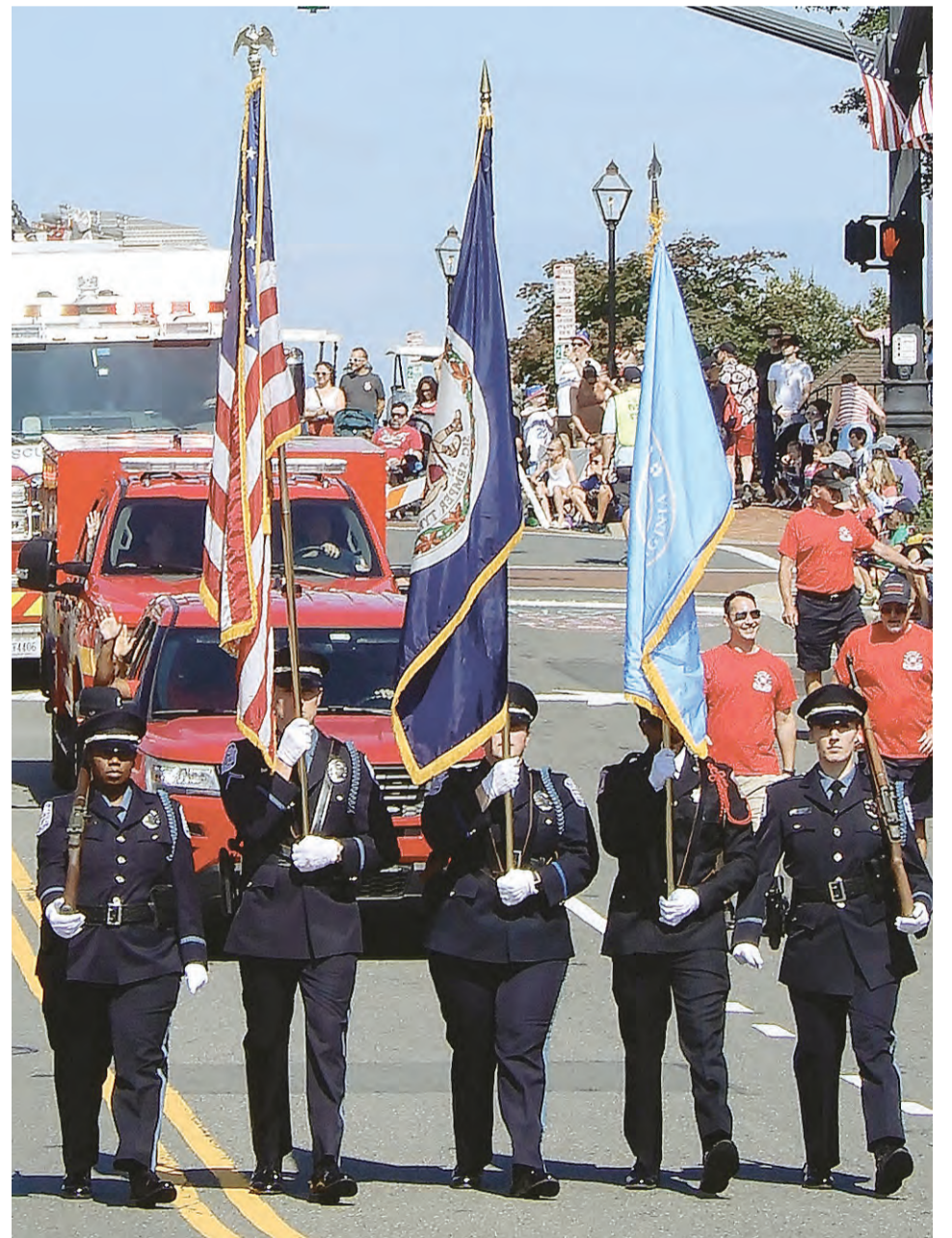
Fairfax City Fire Department Honor Guard.