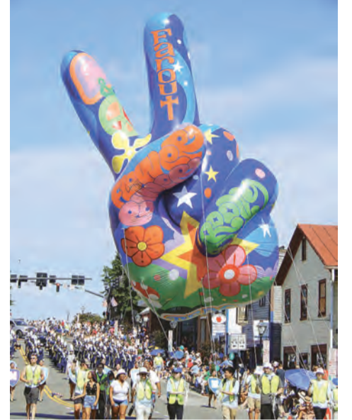
This "groovy" balloon bears the words, "far out" and "flower power."