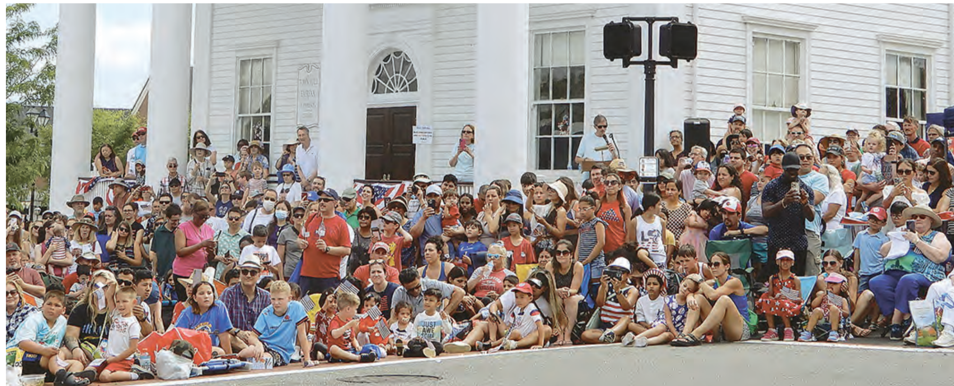
Some of the huge crowd watching the parade from Old Town Hall.