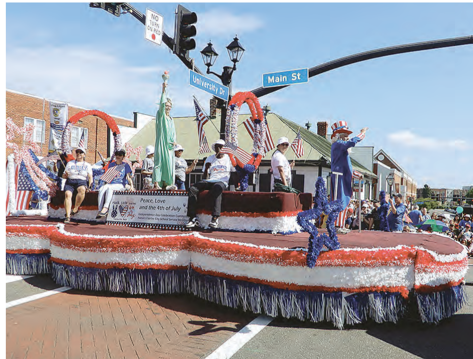
This patriotic float honors Fairfax City Schools service members.