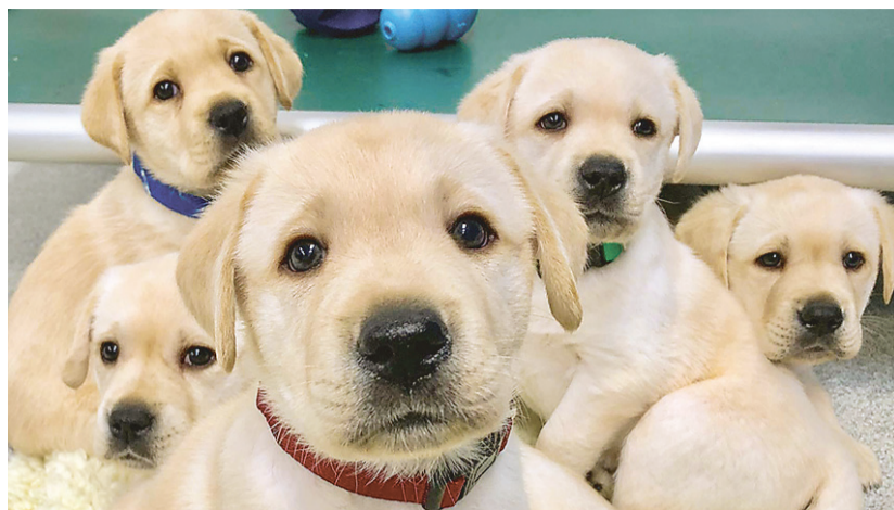
Pups in the Pavilion takes place in July and August at Reston Town Center on Wednesdays.

Pups in the Pavilion. Wednesdays from 5-7:30 p.m. At Reston Town Center, 11900 Market Street, Reston. Reston Town Center Kicks Off "Pups in the Pavilion" this Summer; Pavilion transforms into a leash-free play area during the dog days of summer. Enjoy treats, toys, areas to cool off, pet-friendly giveaways, and more. Visit https://www.restontowncenter.com/