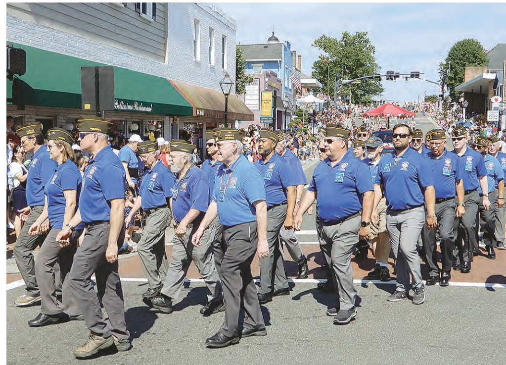
VFW Post 8469 members marching.