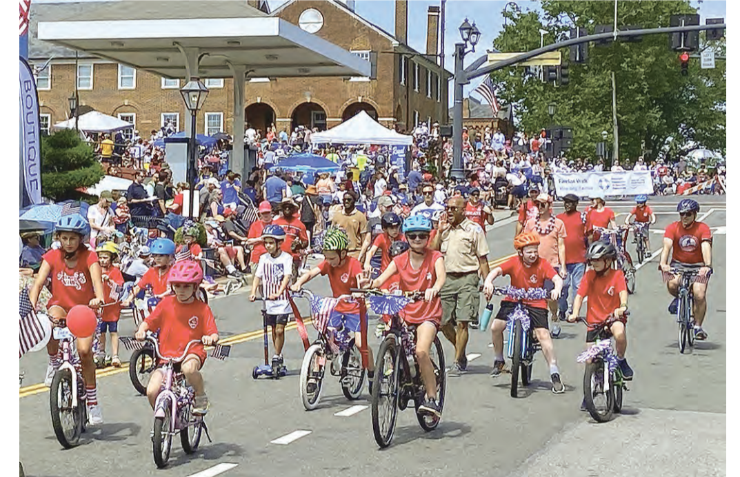
Cub Scout Pack 41 includes girls, too.