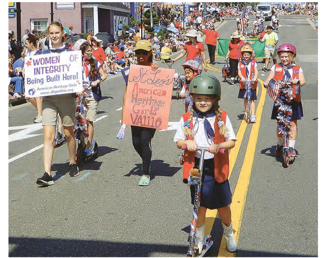
American Heritage Girls of St. Leo's Catholic School.