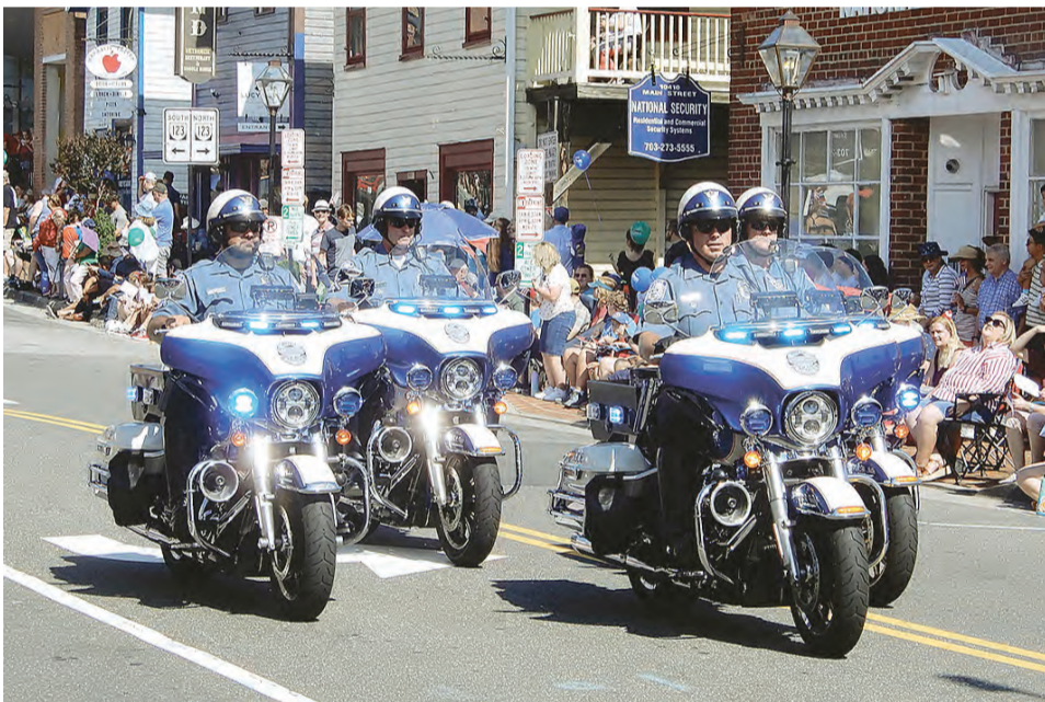
Fairfax City police motorcycle officers lead off the parade.