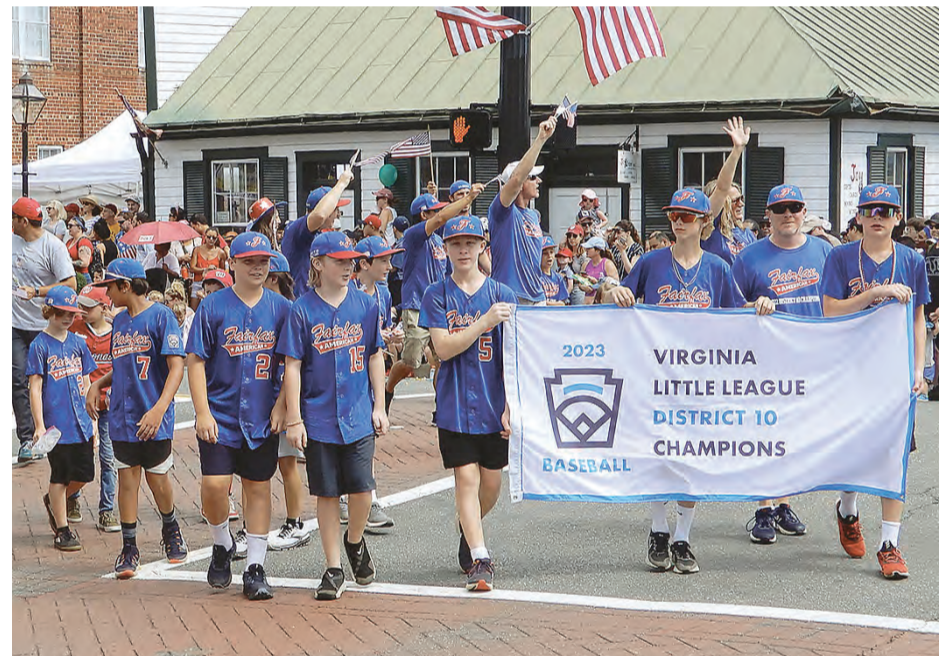
Virginia Little League District 10 champs.