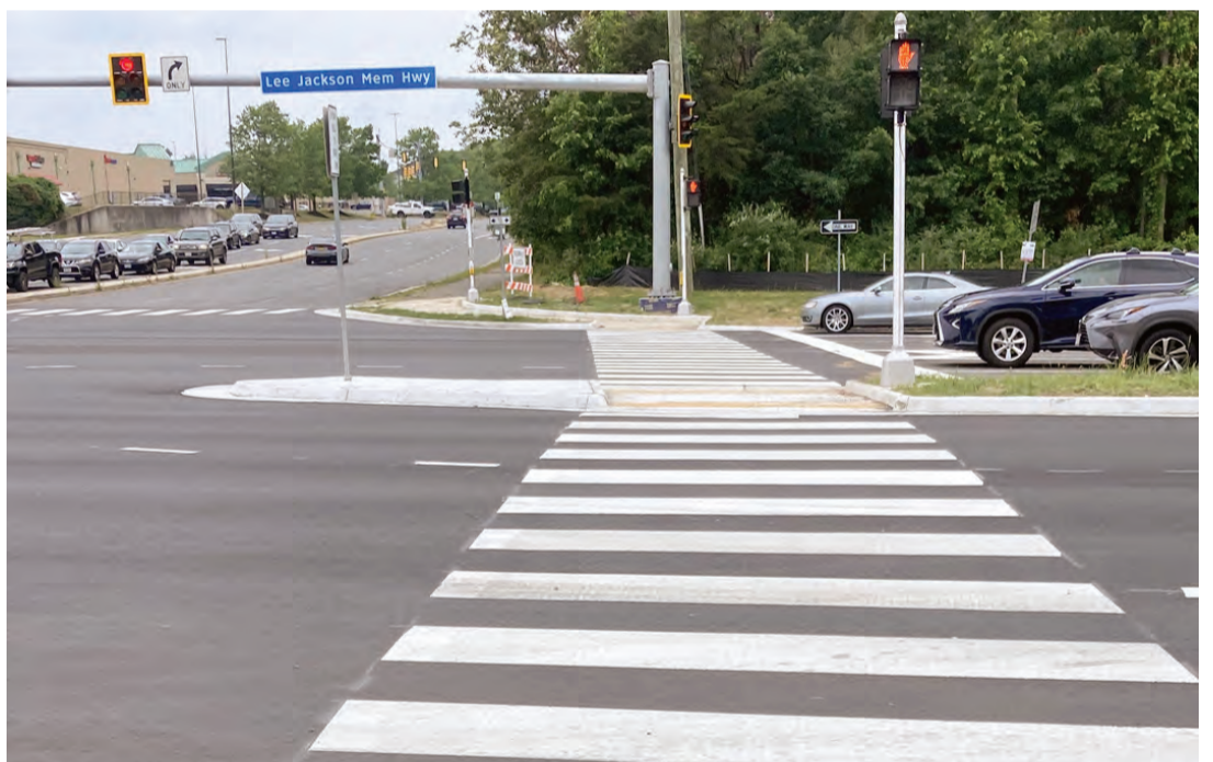
The new bicyclist/pedestrian crossing on Route 50 with refuge island.