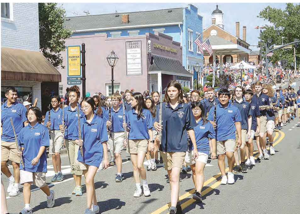
Fairfax and Woodson high schools' bands marching together.