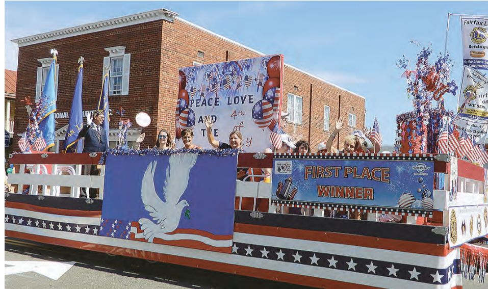
The first-place float carried out the parade's theme, "Peace, Love & the Fourth of July."