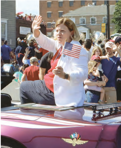
Fairfax City Mayor Catherine Read