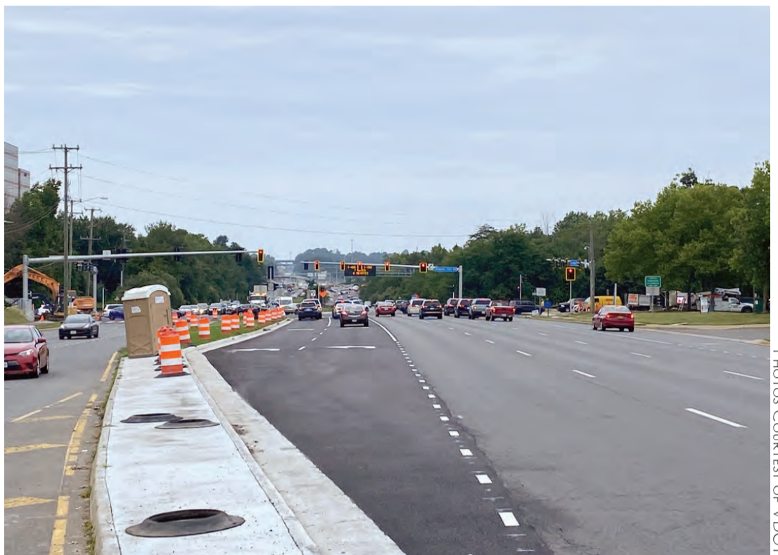
New, additional turn lane from Route 50 west to southbound Waples Mill Road.

The Virginia Press Association has championed the common interests of Virginia newspapers and the ideals of a free press in a democratic society since 1881.