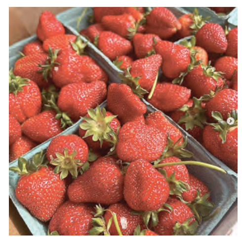
Weekly Farmers Markets has opened on Thursdays at the PARC at Tysons.

Weekly Farmers Markets. Thursdays 12 p.m. to 7 p.m. At The PARC at Tysons, 8508 Leesburg Pike, Tysons. Celebrate Fairfax, a nonprofit organization dedicated to building community in Fairfax County, is excited launch of a weekly farmers market at The PARC at Tyson. The market is run by Potomac Farm Market, which has over 20 years of experience connecting communities to local farmers and artisanal food producers. Each week, residents can expect to find seasonal fruits and vegetables, fresh cut flowers, and other locally sourced specialties.