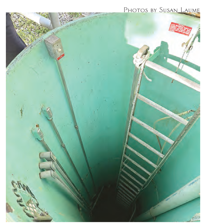
Deep below, sewage under pressure is flowing to the station's tank to be pumped to the next high point, so gravity can assist the movement toward the treatment plant