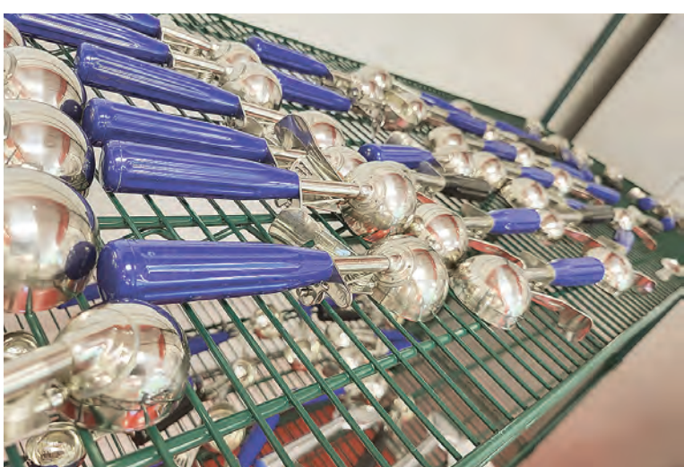
Get the scoop at Bruster's.

At Bruster's they offer 24 flavors of premium ice cream that has a certain level of butterfat in it, and they have three walk-up windows that will cater to the mobile diners.