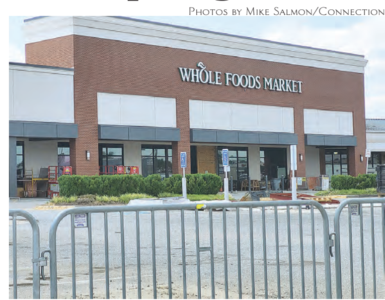
The sign is up at the new Whole Foods location around the corner from Big Blue.

7202 Old Keene Mill Rd, Springfield, VA Free Big Blue Swim School celebrates opening its fifth Northern Virginia location. A ribbon cutting at 10:30 a.m. Then attendees can take a tour of the facility and enjoy refreshments from a BBQ food truck with events and activities for families and little ones to enjoy.