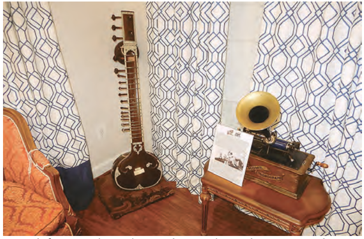
From left, an antique sitar and an antique phonautograph.