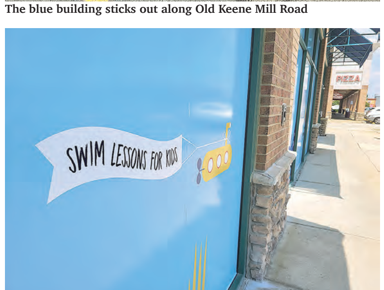
They specialize in children's swim lessons.