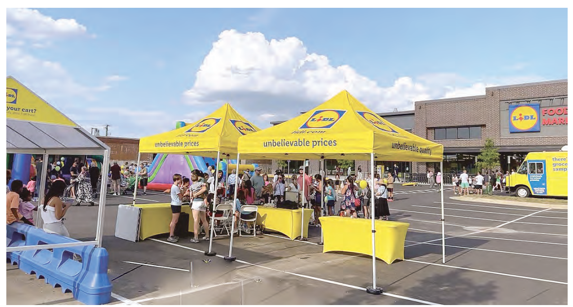
Lidl Lorton's opening preview hours felt like a block party with bounce houses, face painting, and nearby neighbors gathering to celebrate the long awaited store opening