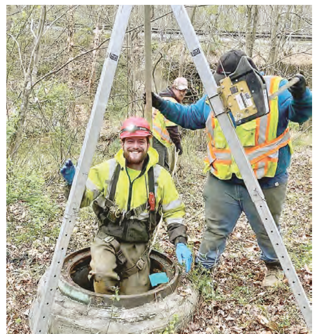
Hundreds of miles of sewer pipes are inspected annually with cameras, sensors, and lasers to assess pipe condition, sometimes requiring entry into the system to retrieve entangled equipment