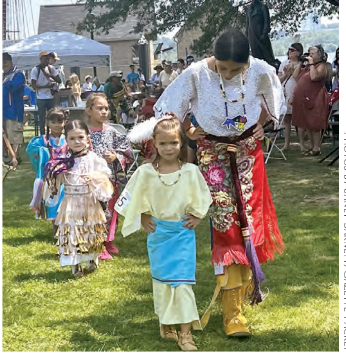
Children prepare for the Running Strong for American Indian Youth Powwow Tiny Tots competition Aug. 6 at Waterfront Park.