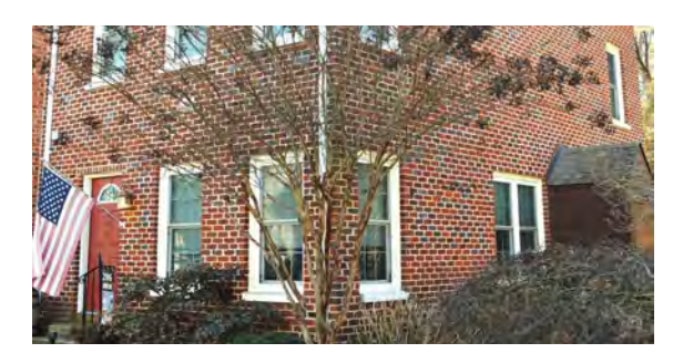
206 CENTER LANE* | SOLD FOR $590,000