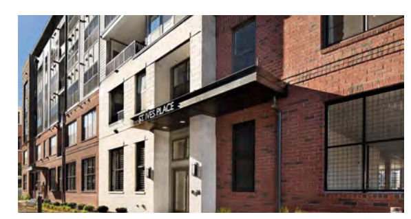
102 ST. IVES PL #20902* | SOLD FOR $550,352