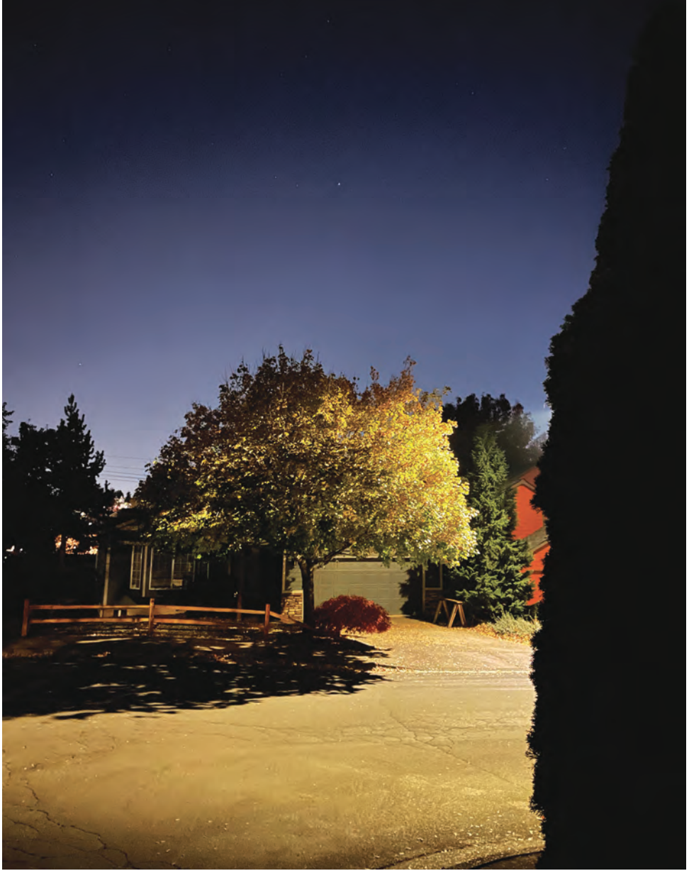
Light pollution, loss of habitat and insecticide use are among the reasons fireflies are in decline. Here, part of the night sky is dark enough to show some stars, the rest is skyglow from suburbs. The foreground is brightly lit by LED street lights that are

ple and wildlife lived under night stars. A 2016 global satellite study dation; and desensitized vision." titled the New World Atlas of Artificial Night Sky Brightness found Native Plants that "more than 80 percent of the world population lives under light and Dead Leaves 6 ALEXANDRIA GAZETTE PACKET AUGUST 10-16, 2023