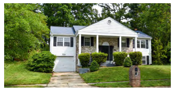
9033 LOUGHRAN RD | SOLD FOR $469,000