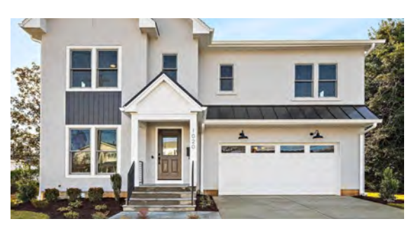
1020 19TH ST S* | SOLD FOR $1,994,000

Looking to buy or sell? Call me for all your real estate needs, I'll Kari You through the process!