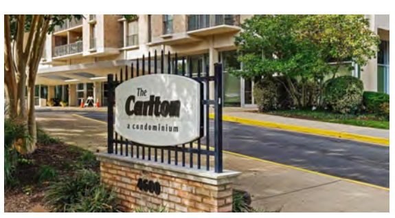
4600 S FOUR MILE RUN DR S #1131* | SOLD FOR $167,000