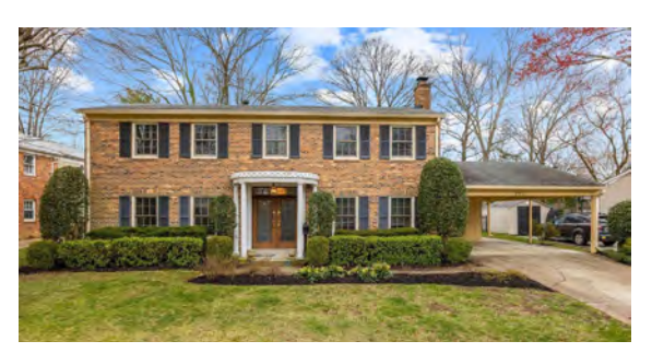
8412 W BOULEVARD DR* | SOLD FOR $970,000