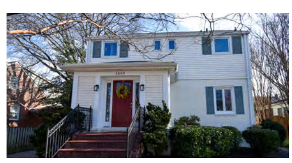
2809 CENTRAL AVE | SOLD FOR $1,115,000 *REPRESENTED THE BUYER