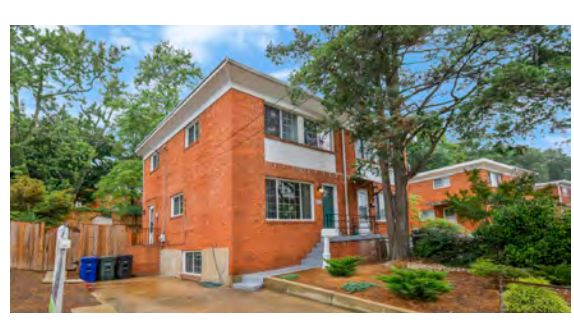
842 S DINWIDDIE ST | SOLD FOR $650,000