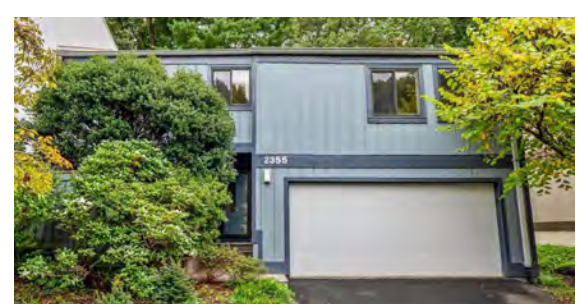
2355 GLADE BANK WAY* | SOLD FOR $540,000