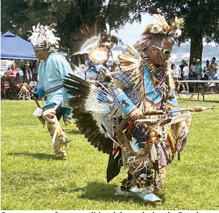
Contestants perform a traditional dance during the Running Strong for American Indian Youth Powwow competition Aug. 6 at Waterfront Park.

"Billy and Eugene joined efforts to address needs on the Pine Ridge reservation, specifi-