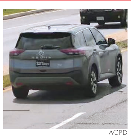
Have you seen this vehicle which was used in the July 24 fatal shooting?