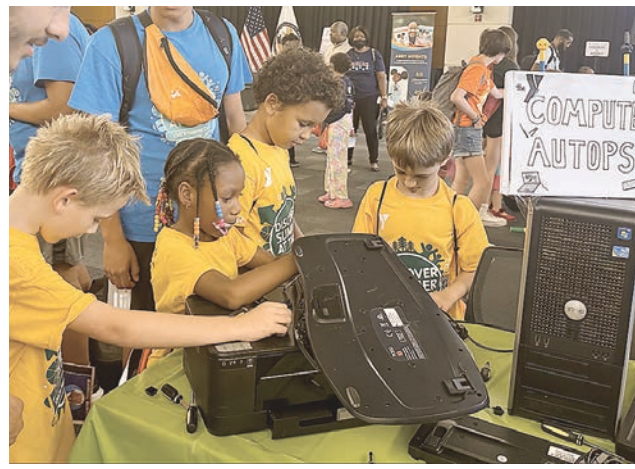
YMCA summer program kids try their hand at the comput- Participants from the Alexandria YMCA create toasted er autopsy exhibit at the Thingamajig Invention Conven- art at the YMCA Thingamajig Invention Convention tion Aug. 2 at the U.S. Patent and Trademark office.