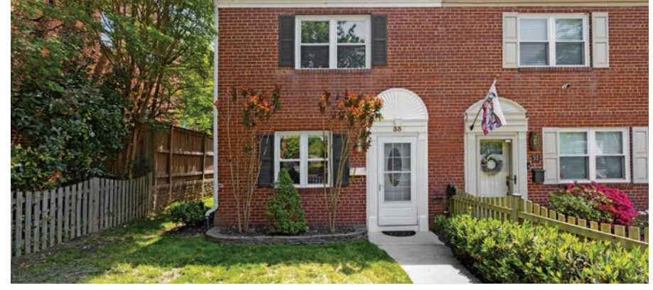
33 Mount Vernon Ave, Alexandria, VA 22301 For Rent for $3,500/mo