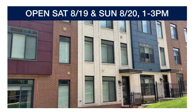
Saint James Townhomes | $925,000 Delightful, luxury, 4-level townhome with 3 bedrooms,

Gorgeous, spacious, bright, and beautifully renovated! Four great bedrooms on one level, new windows and doors, incredible closet space and storage thru-out! An easy stroll to the elementary school and neighborhood swim and tennis club! 7518 Cornith Drive Robin Arnold 703.966.5457 www.robinarnoldsells.com