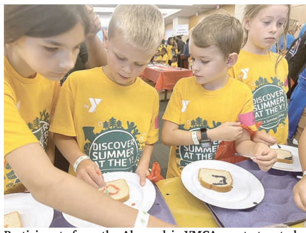
Aug. 2 at the U.S. Patent and Trademark office.