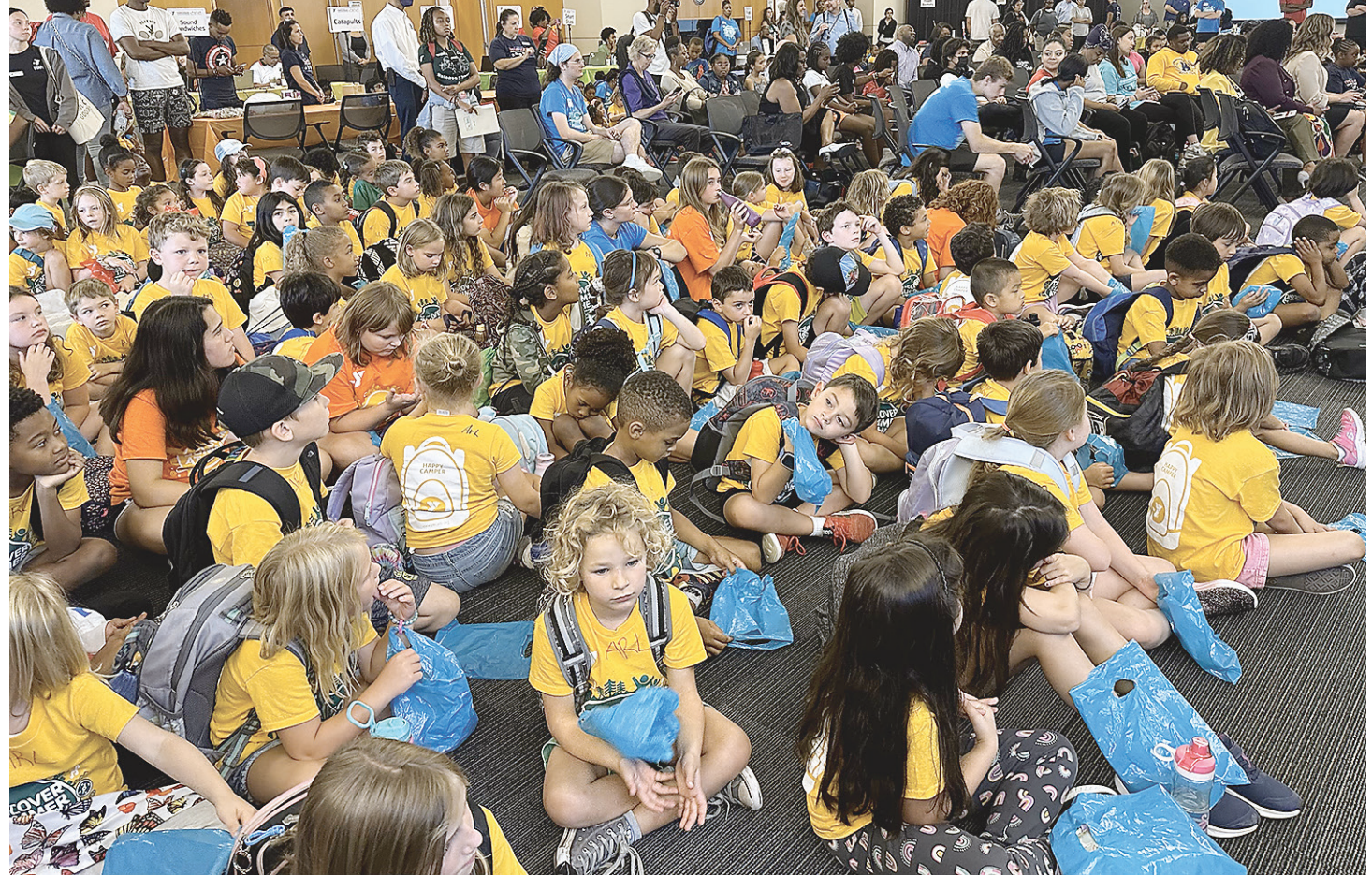
Hundreds of students gather for the YMCA Thingamajig Invention Convention Aug. 2 at the U.S. Patent and Trademark Office..