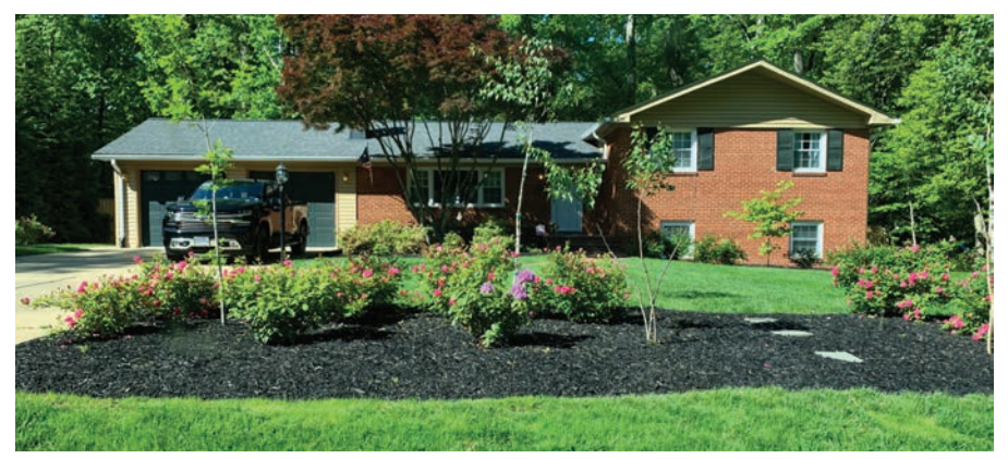
4501 Tarpon Ln, Alexandria, VA 22309 Coming Soon | Offered at $950,000

Coming Soon in Fall of 2023! New construction by local builders WFB Companies, Inc. Currently framed and available to walk through with appointment. This custom energy efficient home sits on a half-acre lot and is nestled among mature trees in the beloved NOVA Fort Hunt community in the sought after Waynewood Elementary School District. With over 5,000 sq ft of above-grade living space, this one-of-a-kind home offers classic architectural features, lots of upgrades and a fantastic layout.