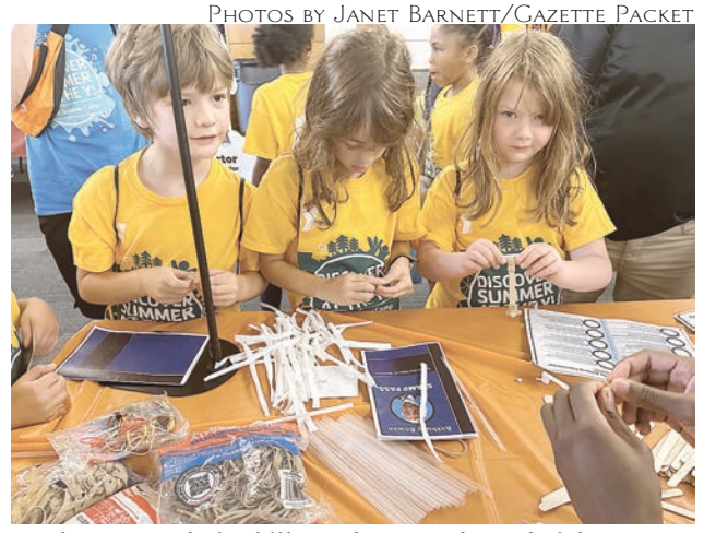
Students test their skills at the Sound Sandwiches exhibit at the YMCA Thingamajig Invention Convention Aug. 2 at the U.S. Patent and Trademark Office.