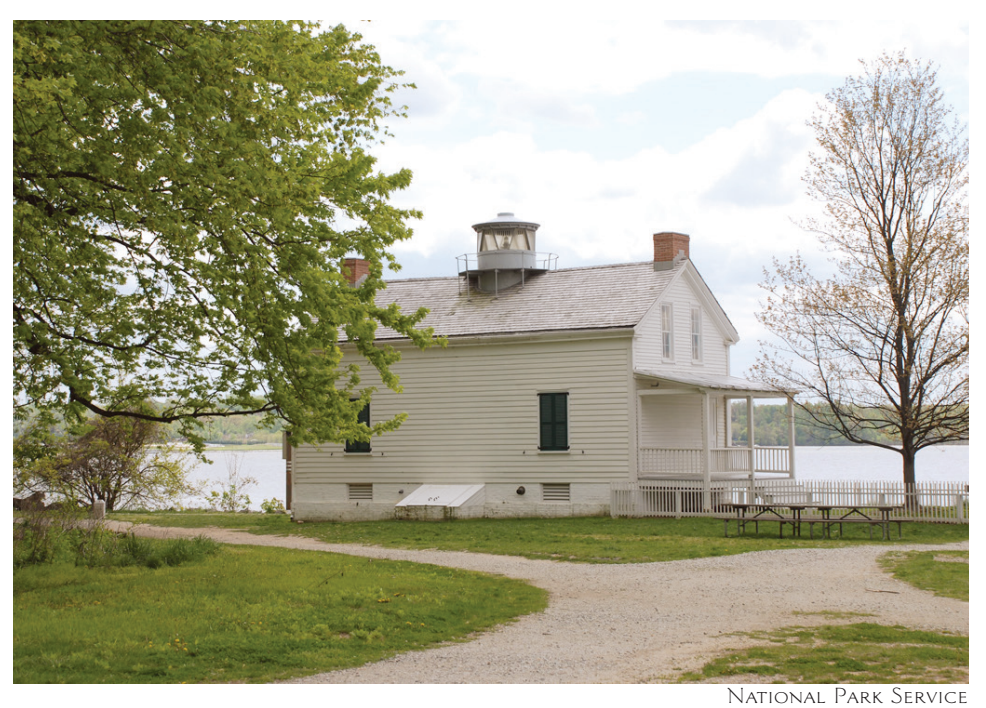
Jones Point Lighthouse, restored, one of the last riverine lighthouses in the country and the only one still standing in the Chesapeake Bay area. Alexandria Gazette Packet 🗞 August 17-23, 2023 🗞 7