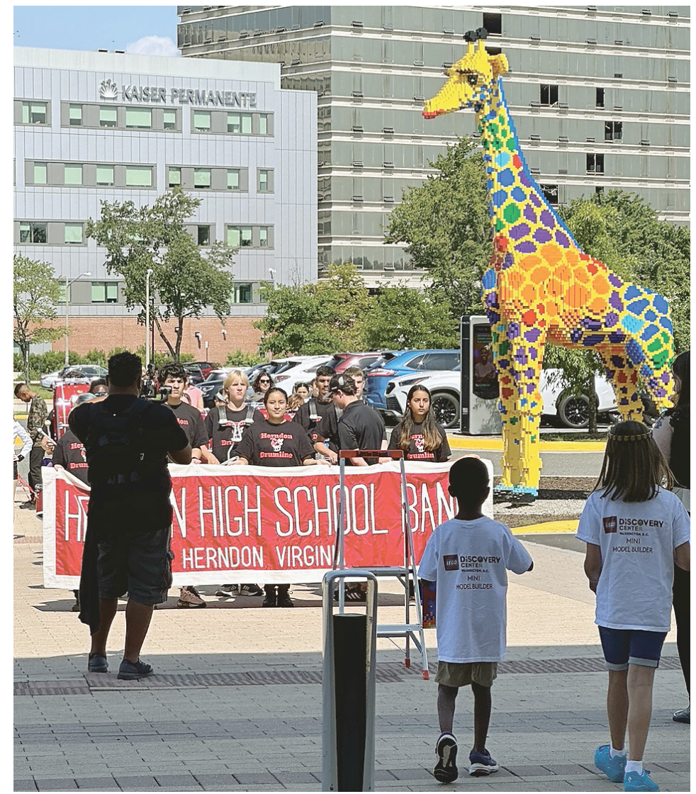
Herndon High School drum band and dancers led a parade of participants to opening ceremonies