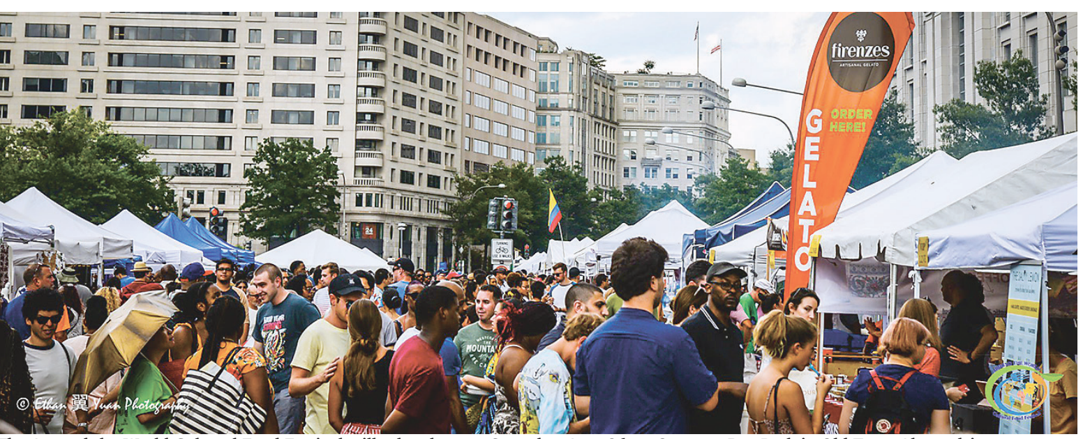
The Around the World Cultural Food Festival will take place on Saturday, Aug. 26, at Oronoco Bay Park in Old Town Alexandria.

The "Treasures of the DMV" exhibit. At Del Ray Artisans Gallery, 2704 Mount Vernon Ave., Alexandria. Features art that celebrates the wonders of DC, Maryland, and Virginia. Come see famous and overlooked regional gems from the perspective of local artists. Opening Reception: Friday, August 4, 7-9pm. Open Thursdays 12-6pm, Fridays 12-9pm, Saturdays & Sundays 12-6pm (Closed on August 27). DelRayArtisans.org/exhibits