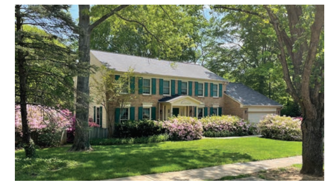
Seminary Ridge | $1,500,000

Wonderful 5-bedroom, 3.5-bath brick colonial home on a gorgeous 6/10-acre, professionally landscaped and cared for lot. Many updates including double pane windows & doors, roof shingles, furnace + more. 2-story sunroom addition. Spectacular! 515 Fort Williams Pkwy Chris Hayes 703.944.7737 Gordon Wood 703.447.6138