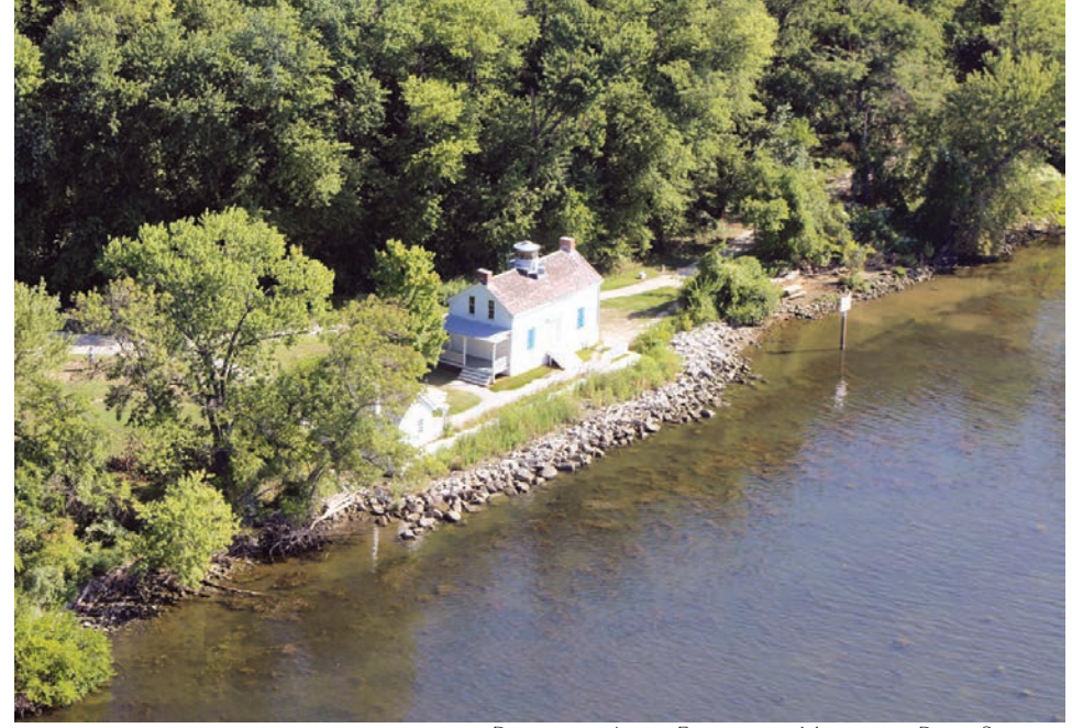
Jones Point Park.