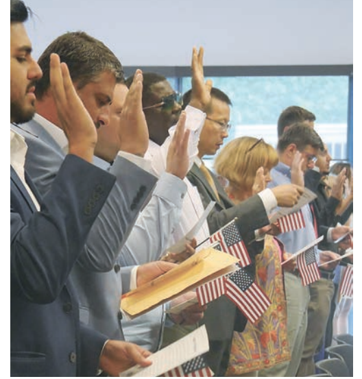
A short but emotion filled ceremony takes place on Thursday morning Aug. 24 complete with the Star Spangled Banner, Pledge of Allegiance and oath of citizenship.