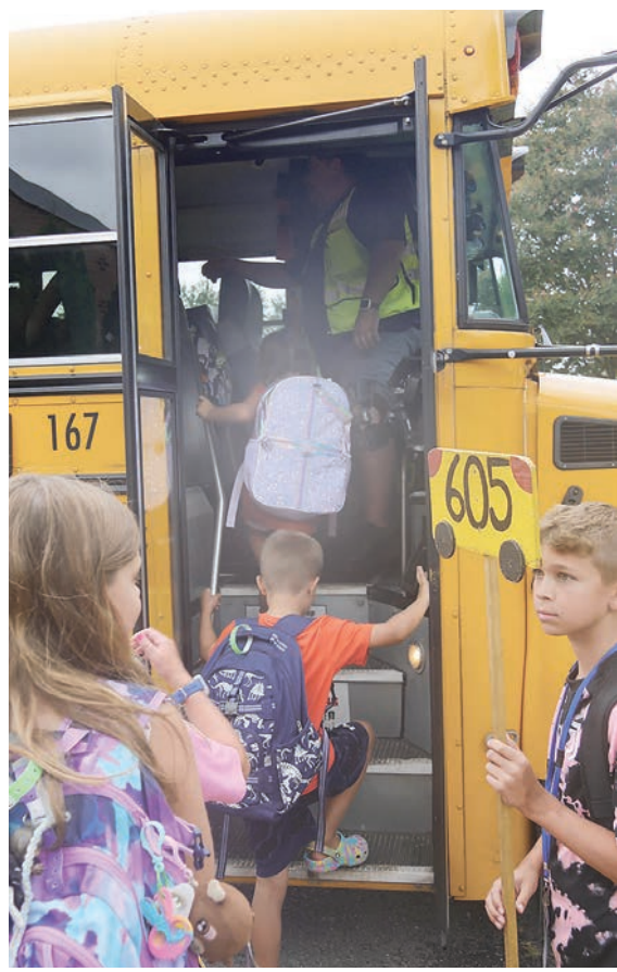
A student holds the bus route 605 sign high, and the students follow him down the sidewalk and up the steps of the bus at about 4 pm on their first day of school.