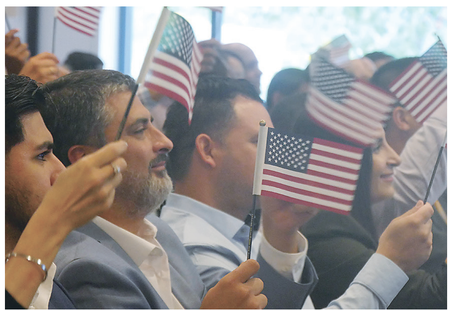
New citizens celebrate by waving the American flag after taking the oath of allegiance on Aug. 24 at Arlington Central Library.