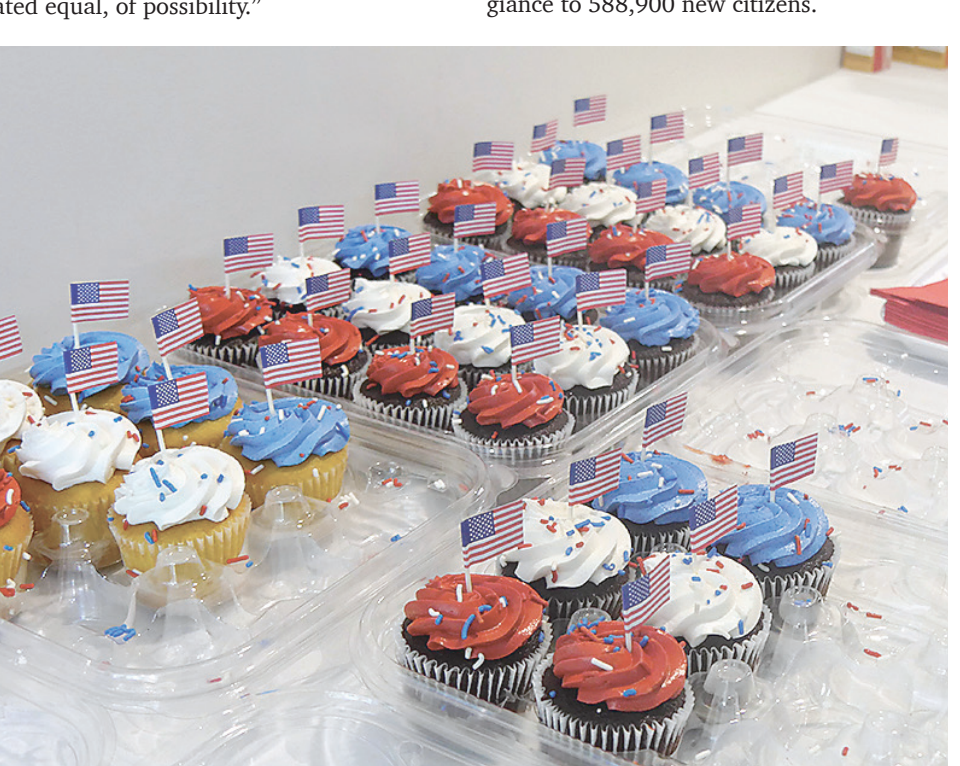
Red, white and blue cupcakes are spread out to welcome the new citizens and their families after the ceremony.

The Space Force color guard from the ROTC program at the Career Center marched down the aisle in a display of the colors to open the immigration ceremony.