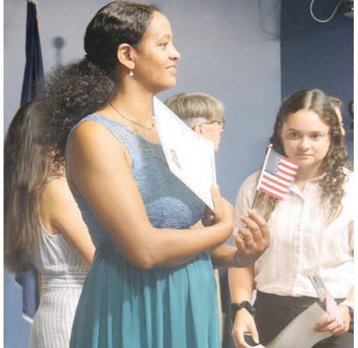
Each new citizen marched across the stage of Central Library auditorium and received a long awaited certificate of citizenship. Some stopped at the edge of the stage and held up their certificate so that relatives in the family section could record the event.