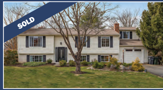
Great Falls $1,080,000