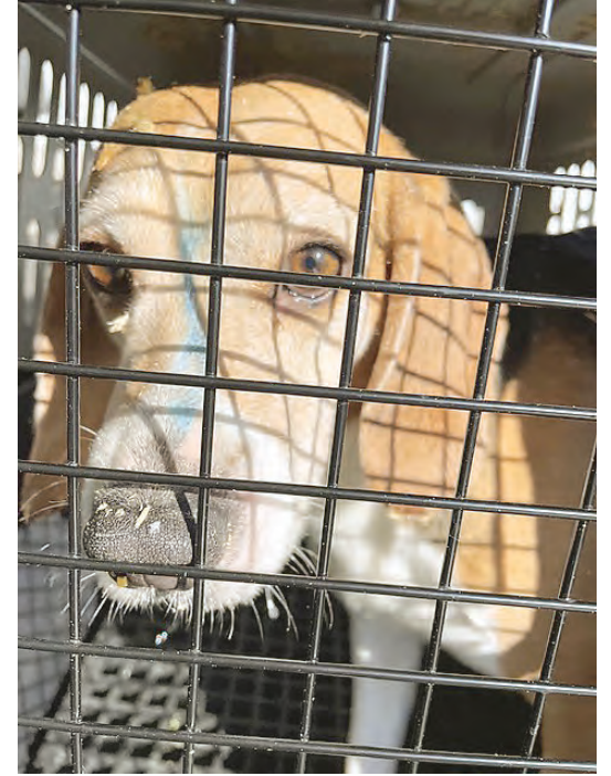
On their day of rescue, no beagle could know