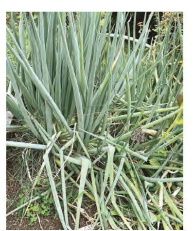
Chives belong to the Allium family, which includes leeks, garlic, and onions. They are poisonous to dogs and cats.