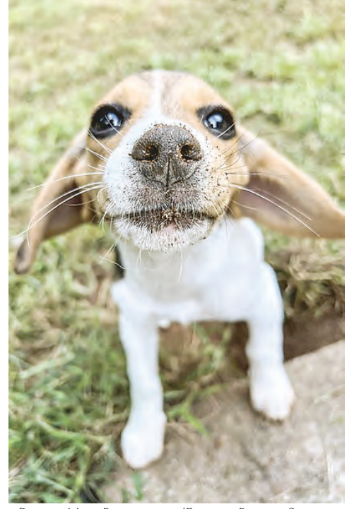
Puppies who knew only cement discovered

Some of the beagles had spent ing stock or test subjects. Others Heartbreak of were there for various lengths of weeks or months after their birth. Early Traumas pending sale to overseas research Adopters described seeing the well, but tonight he started tearing come inside and live with us."