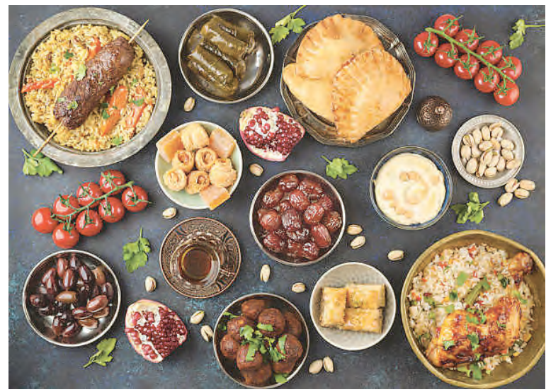
The 30th Annual Middle Eastern Food Festival will take place Sept. 2-3, 2023 at Holy Transfiguration Church in McLean.