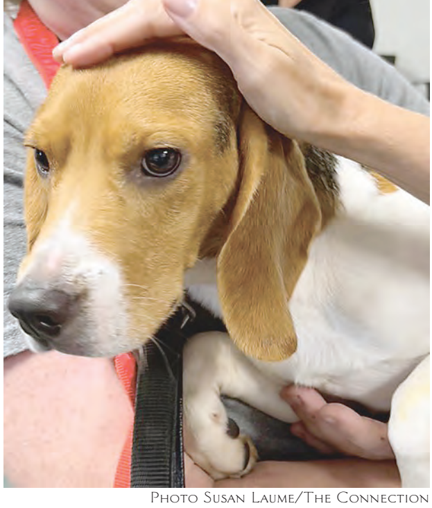
Next stop, the arms of many well-meaning strangers, The first days and weeks were tiring for pups and humans as as beagles arrived at partnering rescue organizations.