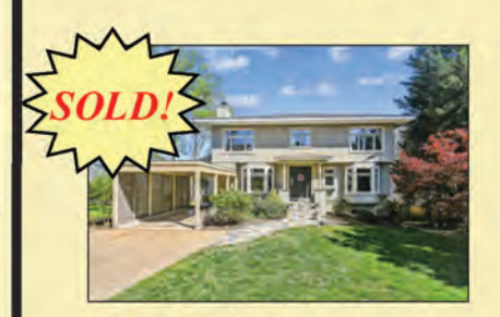
1741 Fairview Avenue McLean, 22101 $1,570,000

2049 Rockingham Street McLean, 22101 $4,695,000 NEW CONSTRUCTION!