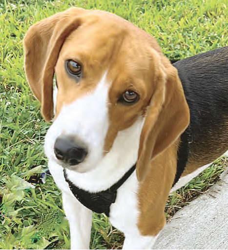
Ashton found comfort and security by flattening in grass.