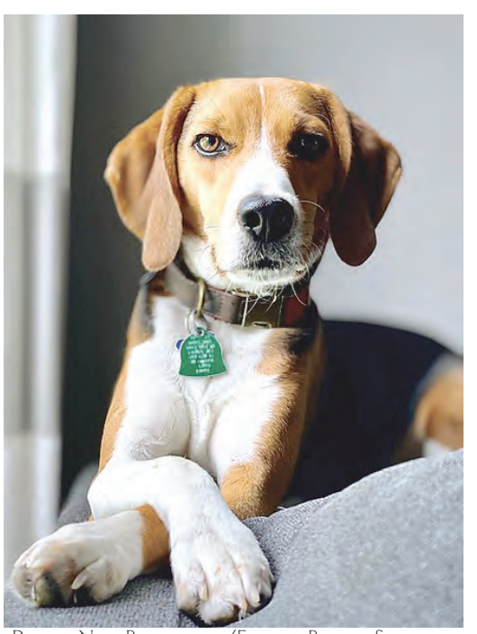
Photo New Beginnings/Envigo Beagle Survivors A now confident and comfortable Birdie rules