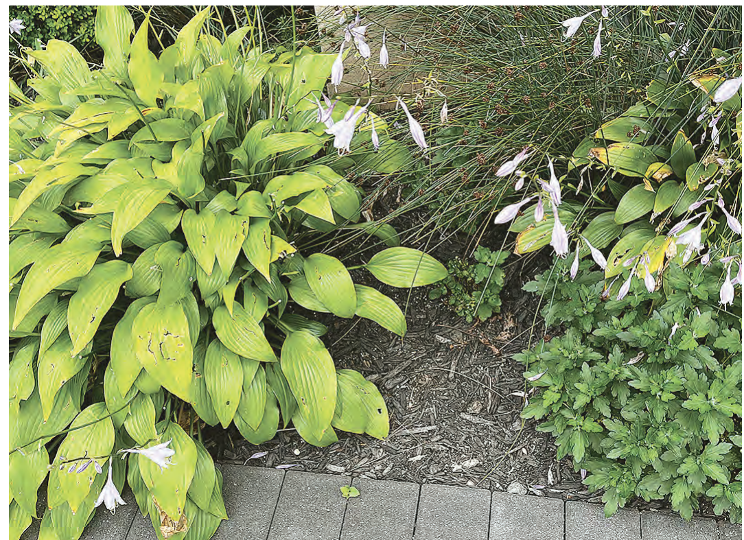
From left, all parts of a hosta plant — leaves, flowers, and roots — are toxic to dogs and cats. Right, any plant in the chrysanthemum family, such as asters, mint, dahlias, carnations, lilies, marigolds, and more, is toxic to your dog. All parts of the chrysanthemum are highly poisonous: leaves, stems, flowers, and sap because they contain pyrethrins. If your pet may have ingested chrysanthemum, get them to the vet immediately.