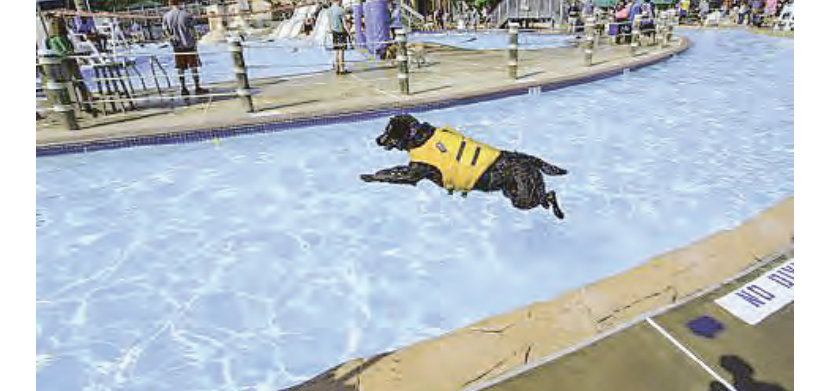
The Dog Daze event will be held Saturday, Sept. 9, 2023 at The Water Mine in Reston.