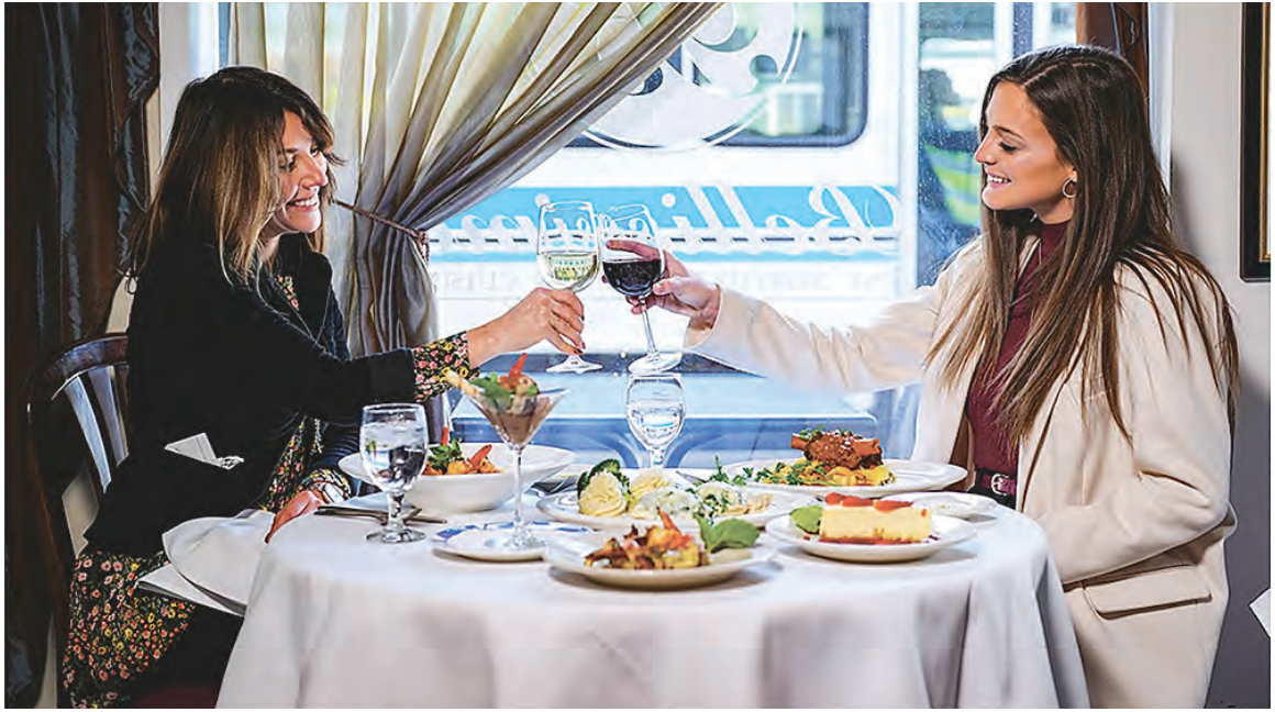
Fairfax City Restaurant week Sept. 4-10, 2023 in the City of Fairfax.