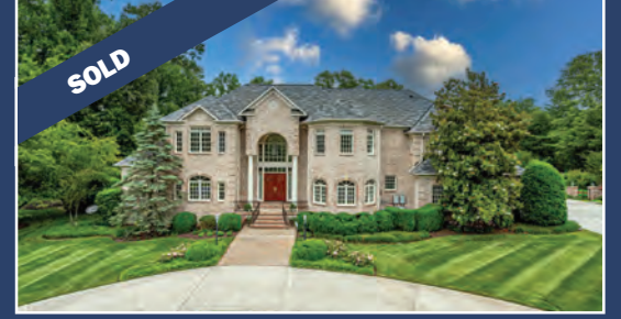
Great Falls $2,915,000