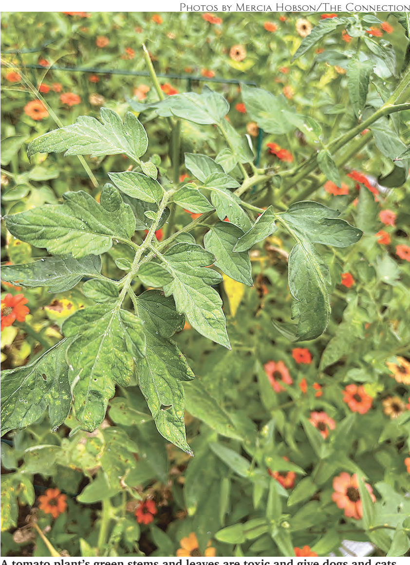
A tomato plant's green stems and leaves are toxic and give dogs and cats severe stomach pain and slows the heart. Dilated pupils are a tell-tale sign your pet may have eaten them.

Fast forward a few hours. We are still in the lobby. A technician asks if we want to hold Oshi. The hospital campus offers a complete critical care unit and an ICU. Taken to another private room, we sit with her, softly stroking our little dog. She remains still. Her eyelids flutter but quickly close. She mews