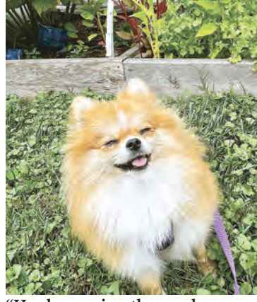
"Ha- ha, seeing the garden again makes me so happy," little Oshi, a nine-month-old Pomeranian, seems to be saying after her near-death experience. "But let's learn what's poisonous to me, Pom Mom.'