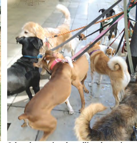
Other dogs enjoy the rolling dynamics of a large pack, with professional dog walkers on the way to the dog park.