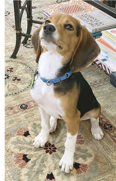
Young pup Thistle puts on a brave face in