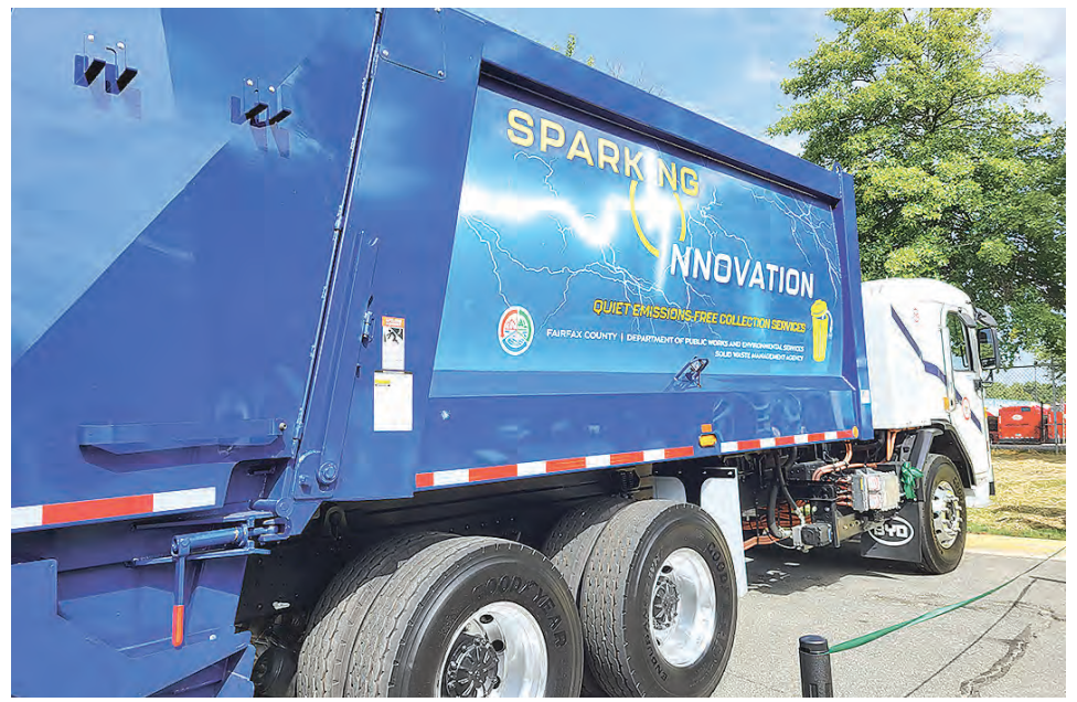
The new truck is clean and ready to go out on trash day.