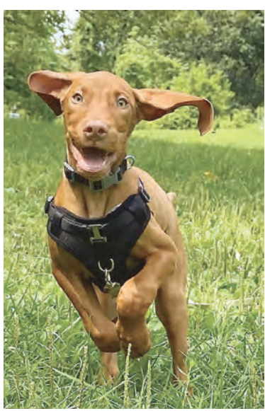
Four month old Rue, of Alexandria, would prefer flying to walking, if only his ears were a little bigger and the wind a little