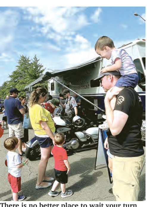
There is no better place to wait your turn to meet the Fairfax County Motor Squad officers than seated high on Dad's shoulders.