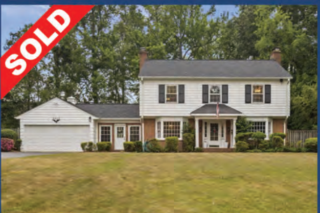
4413 Neptune Dr | $970,000