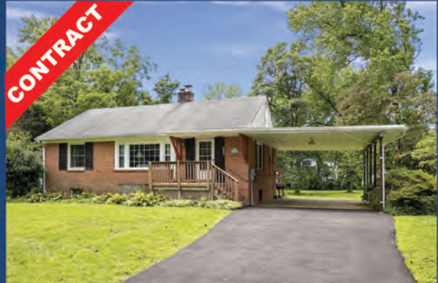
5109 Mount Vernon Mem Hwy | $611,000