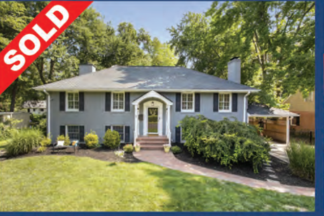
1800 Hackamore Ln | $1,100,000