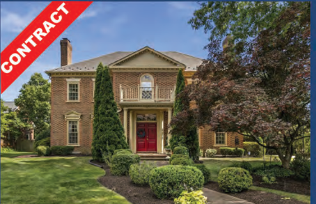
9333 Mount Vernon Cir | $1,675,000