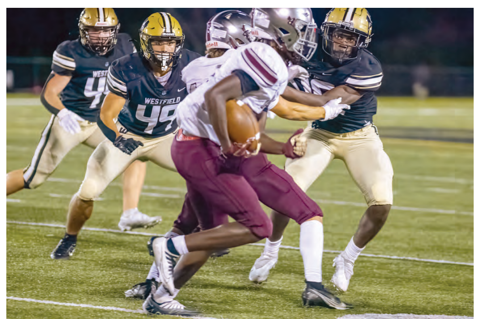
The Westfield defense all have their eyes on a Mount Vernon runner.

Westfield (2-0) will play at Lake Braddock on Friday. Mount Vernon (0-2) will host Friendship Collegiate Academy.