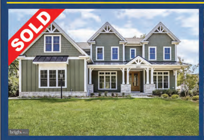
3801 Colonial Ave | $1,565,000