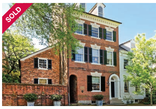
210 Duke Street