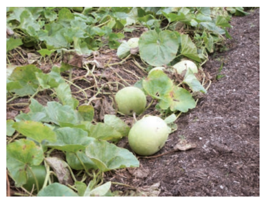
Gourds growing today resemble melons.