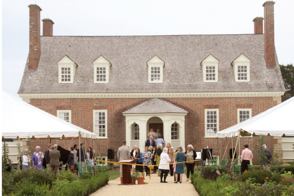
Guests entered the garden from the mansion's back door.

The one-acre plot of four rectangles today has vegetables, ornamental plants and small apple trees. Eventually, it will have over 80 different perennial flowers and bulbs, over 30 types of annual flowers, 34 different vegetables, 16 apple varieties and roses common in the 18th century. The Masons collected seeds, cuttings and plants "from around the Atlantic world," notes a press release. Vegetables grow in the center and ornamentals along the sides, typical of the