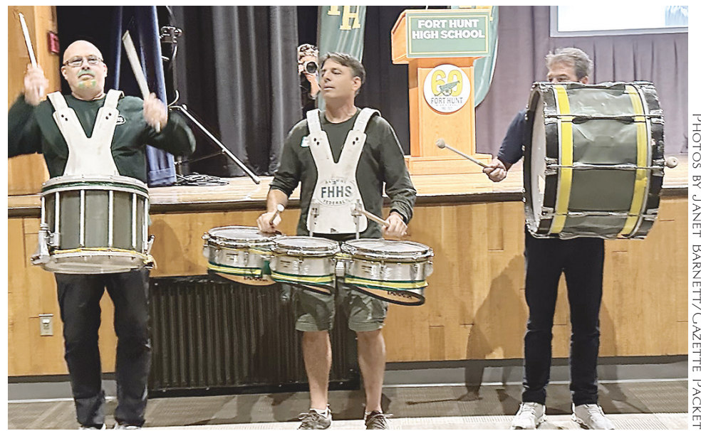
Former Fort Hunt High School band members play at the school's 60th anniversary reunion Sept. 30 at Carl Sandburg Middle School.