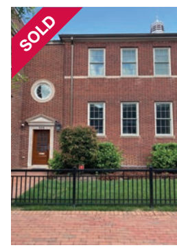
525 N St Asaph Street