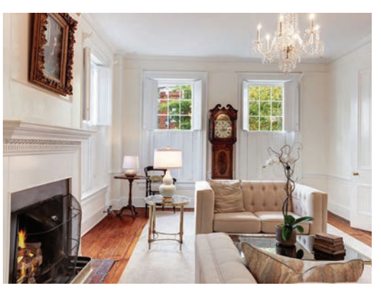
411 Prince Street - $2,950,000