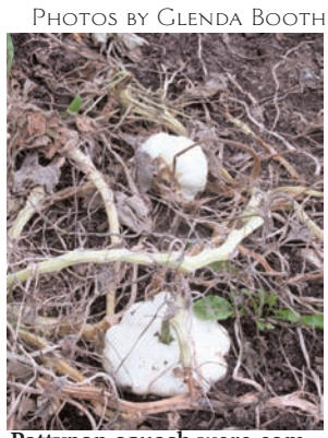
Pattypan squash were commonly grown in the garden.