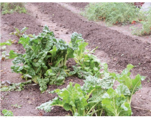
Chard is thriving in today's garden.