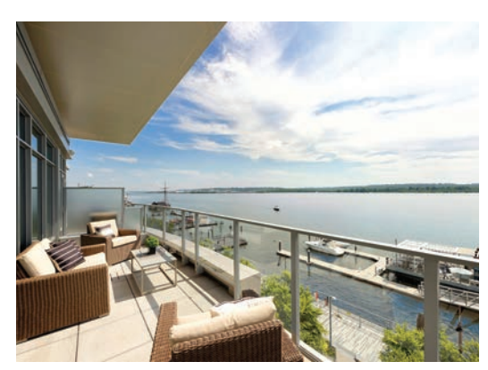
5 Pioneer Mill Way, #501 - $4,850,000