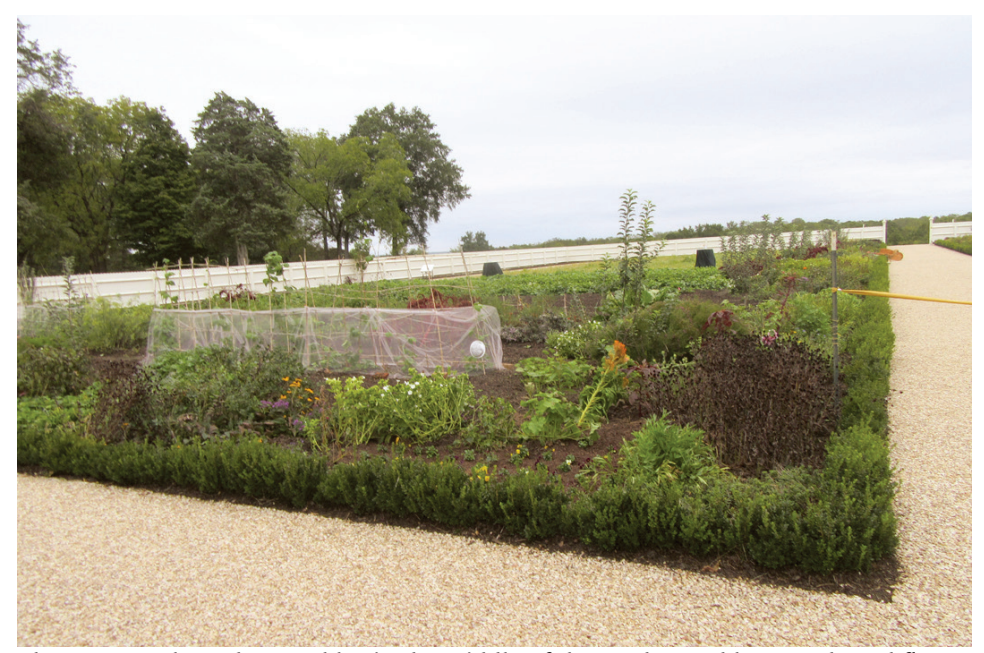
The Masons planted vegetables in the middle of the garden and boxwoods and flowers on the sides.