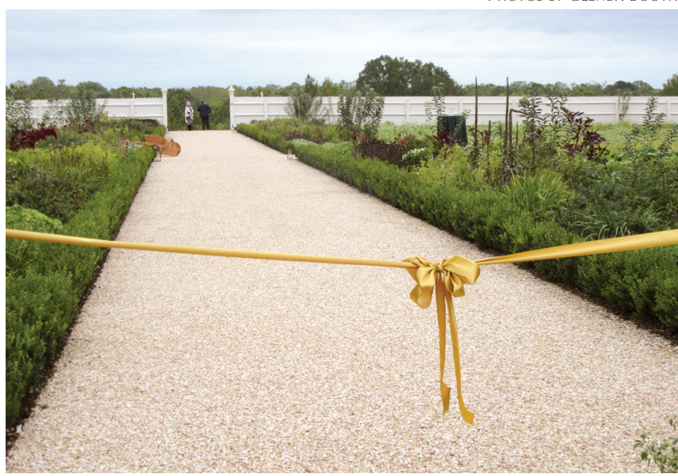
Officials cut a gold ribbon at a September 28, opening event.