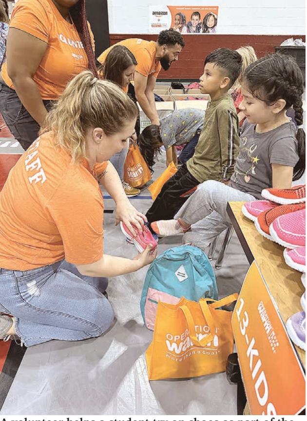
A volunteer helps a student try on shoes as part of the Sept. 27 Amazon-Operation Warm coat and winter clothing donation day at Cora Kelly School for Math, Science and Technology.