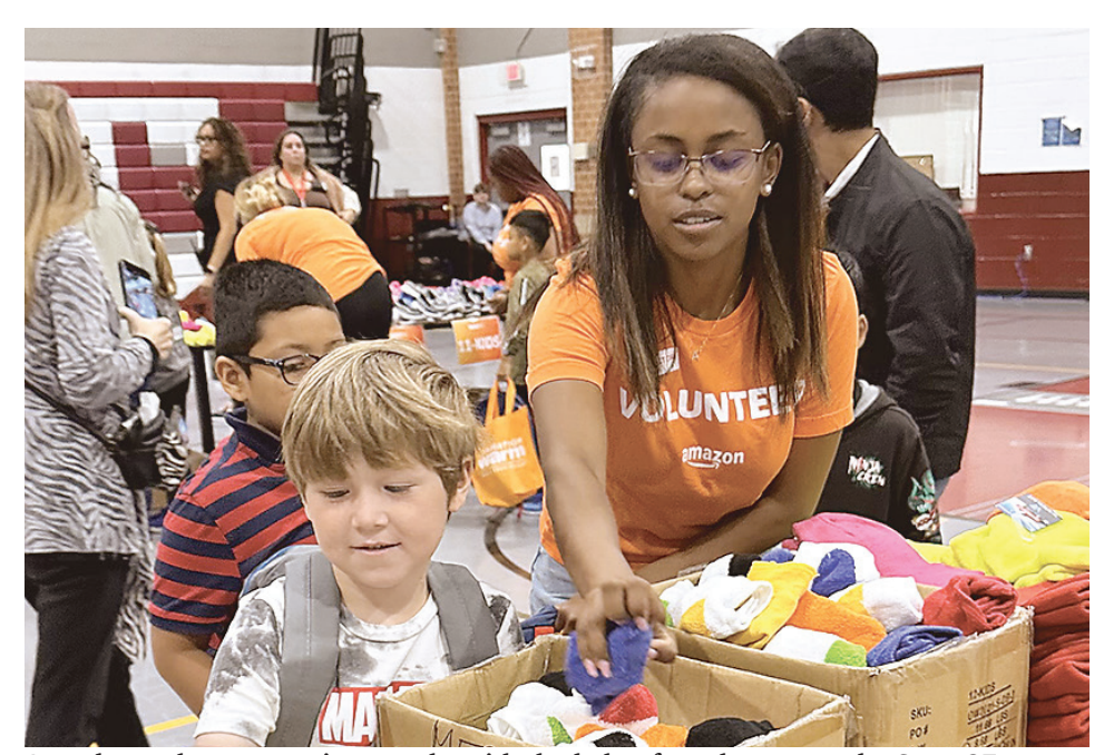
A student selects new winter socks with the help of a volunteer at the Sept. 27 Amazon-Operation Warm coat distribution at Cora Kelly School for Math, Science and Technology.