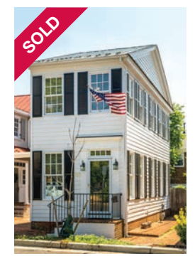
510 South Pitt Street

If you are thinking of selling your Old Town home in this fall market, call Babs and put her expertise to work for you!