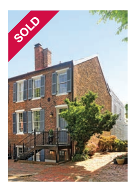
214 South Lee Street