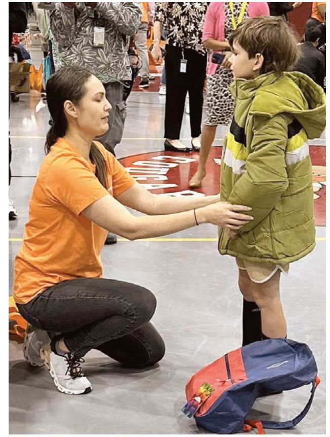
An Amazon volunteer helps fit a student with a new winter coat during the Sept. 27 winter coat donation at Cora Kelly School for Math, Science and Technology in partnership with Operation Warm.