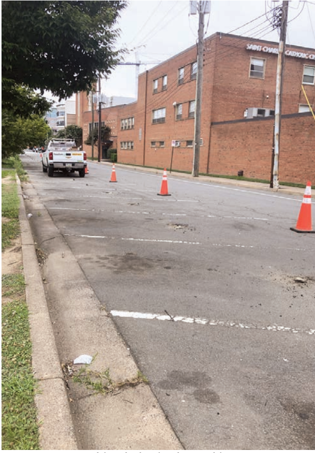
Contractor punching holes in the parking spots near Northside Social.