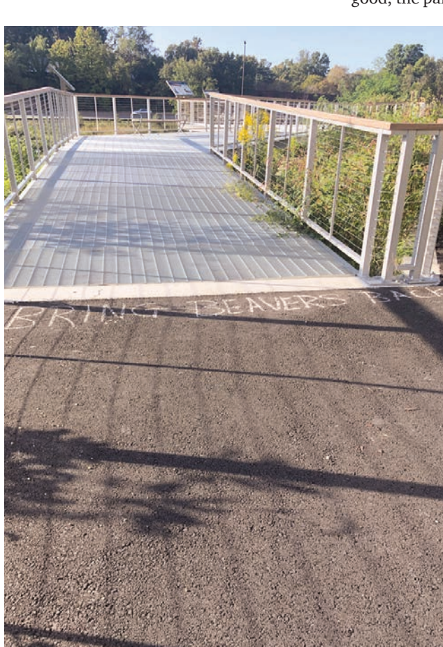
Someone wrote "Bring Beavers Back" at the beginning of the pathway after the park had only been open a few days. 6 ARLINGTON CONNECTION OCTOBER 4-10, 2023

If you go, free parking does not exist along the park or nearby, it is best reached on foot or bike. See: https://www.arlingtonva.us/Government/Departments/Parks-Recreation/Locations/Parks/Ballston-Wetland-Park