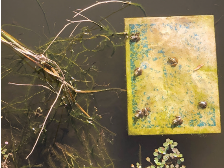
Six green and speckled frogs sat, not on a log, but on a specially designed sunning platform.

The overwhelming noise of Route 66 traffic thrashing its way west, even on a Sunday afternoon, detracted from the wetlands scene, a dab of impressionist green in an abstract cityscape of traffic. It didn't help that a smoker left a pack of Kool cigarettes under one of the benches as they finished smoking,