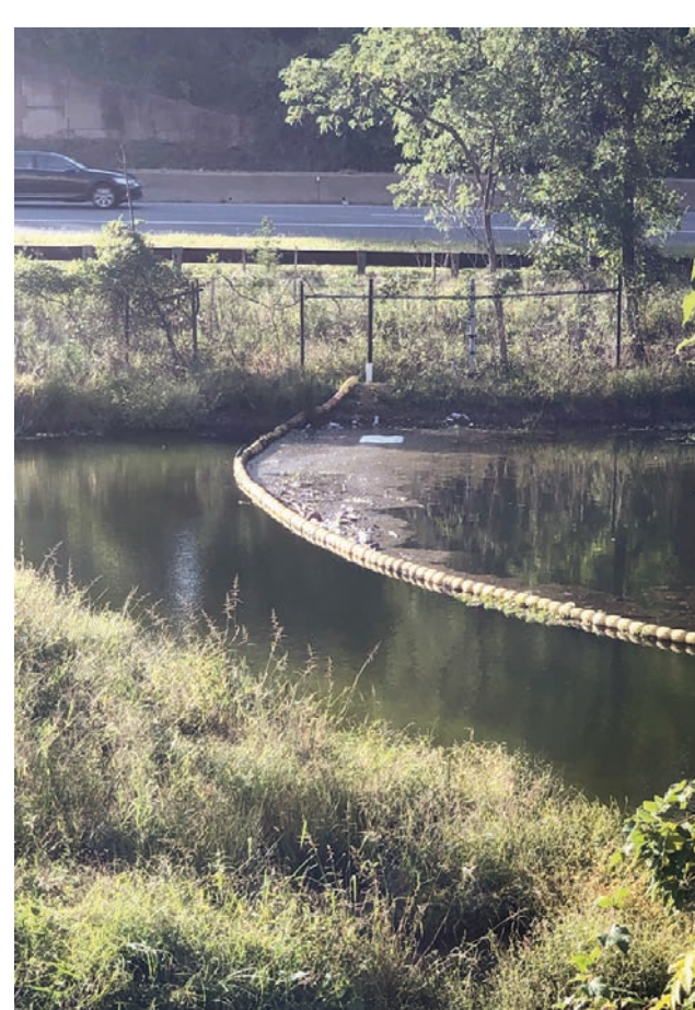
A barrier at the north end of the wetland keeps trash from continuing down the flow of Lubber Run.