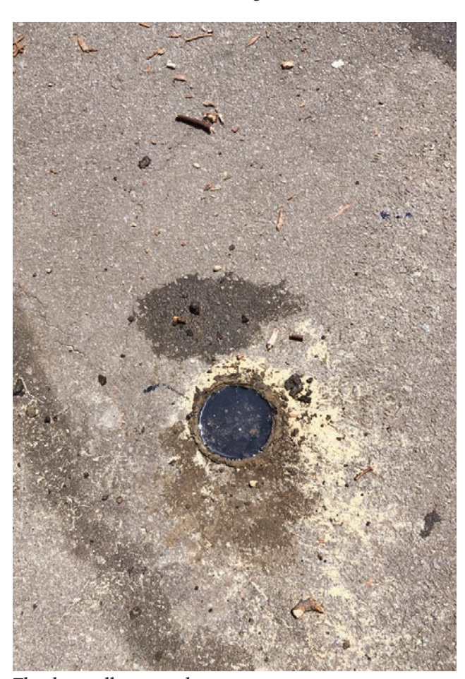
The data collector under your car. 4 ARLINGTON CONNECTION OCTOBER 4-10, 2023

For more information, see: https://www.arlingtonva.us/Government/Programs/Transportation/Parking/Performance-Parking-Pilots