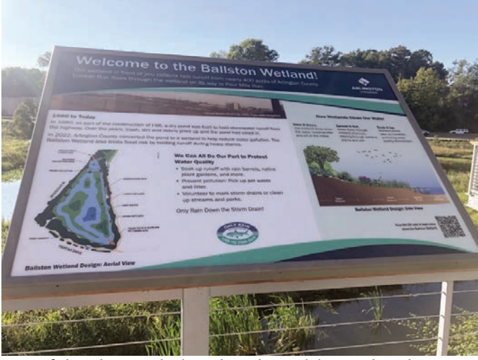
One of the plaques designed to show visitors what they might see in the park includes educational information on how the park is helping water quality and why "only rain goes in the storm drain."

to hold storm runoff from the newly built I-66. The tiny park is now cleared of sediment that had built up in the pond, and is capable of taking excess rainwater from 450 surrounding acres. The retrofitted wetland system improves stormwater flow and filtering, as well as capturing trash, while also serving as a wildlife refuge for some, if not all, urban critters.