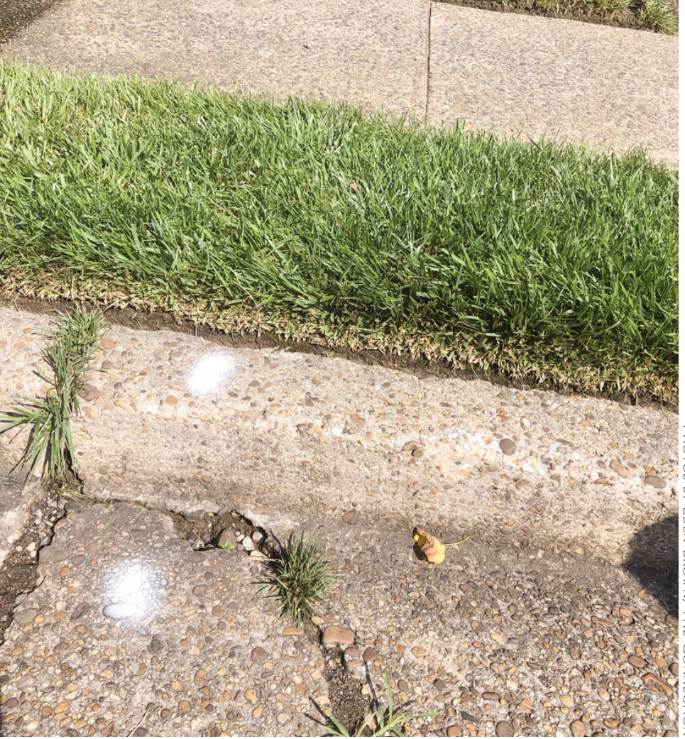
Mystery spots on the curb.

But what about the holes being dug in perfect rounds where cars park near Northside Social and Courthouse? They are even more worrisome looking. The contractor punching the holes in the street shrugged and said, "These are for monitoring cars that