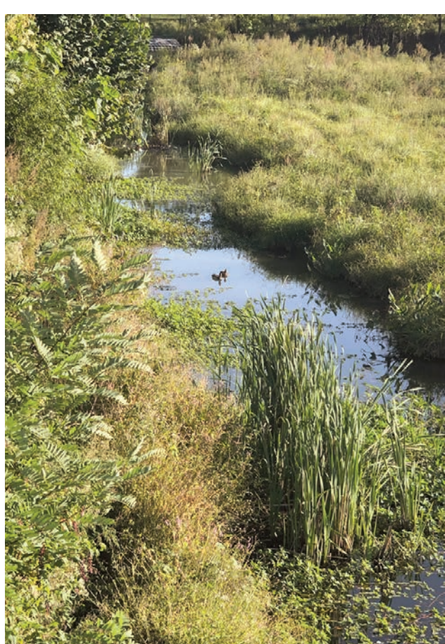
A pair of ducks is happy to paddle along the grassy wetland park.