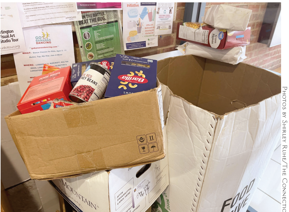
AFAC collection boxes are located inside the Central library and most branches as well as businesses and county offices. AFAC also posted Hunger Month information inside five library branches.