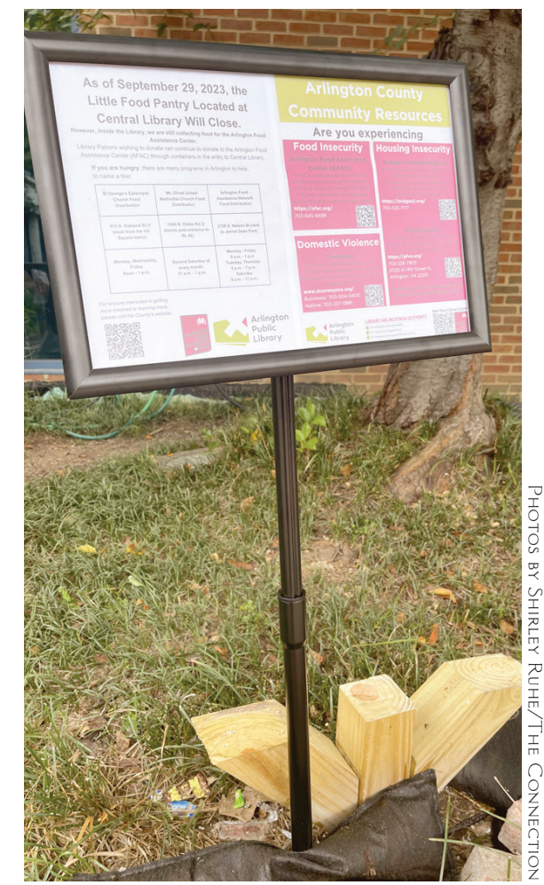
The Library unexpectedly removed the Little Free Pantry on Sept. 30, 2023, leaving only the wooden stubs remaining. They had posted a sign a few days before indicating their intention.