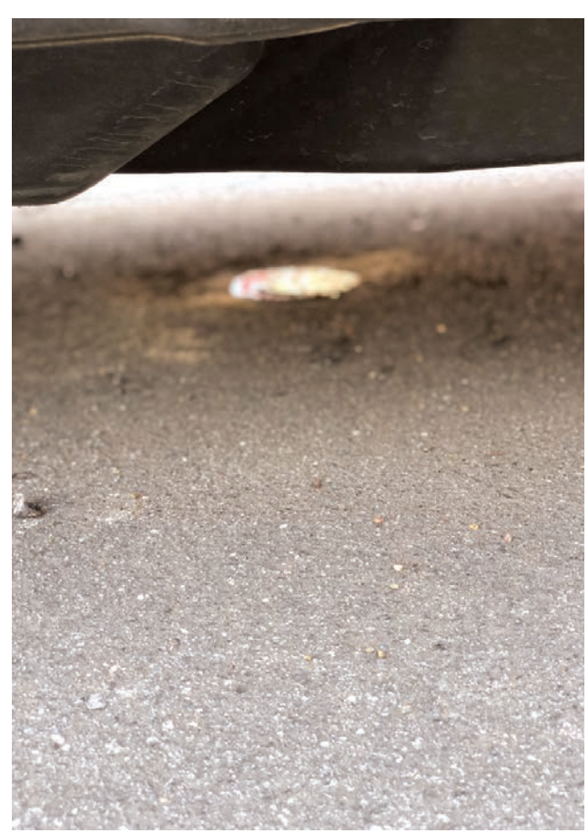
Round disks under cars are collecting data on the parked car.