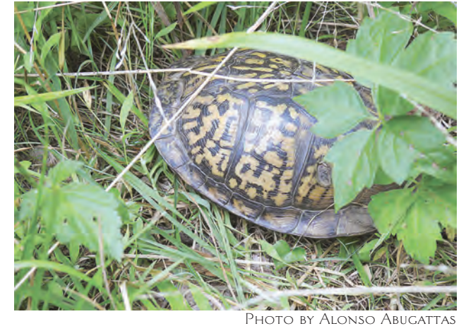
A box turtle hiding