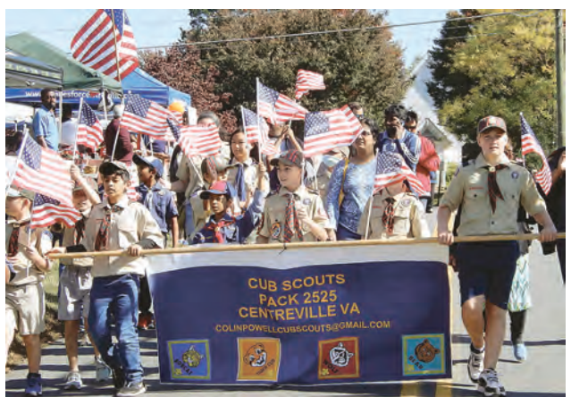
Cub Scout Pack 2525 waves American flags during last year's parade.