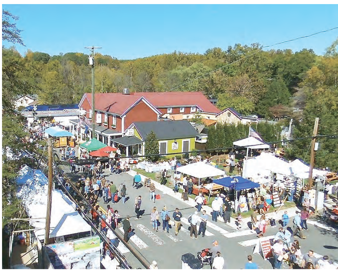
Clifton Day will be held Sunday, Oct. 8, 2023 in the Town of Clifton.

Design+Build, Paola One Design, and Green Build Group. Visit the website https://mads.media/2023dc-metro-modern-home-tour/