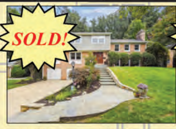
1562 Forest Villa Ln McLean, 22101 $1,550,000