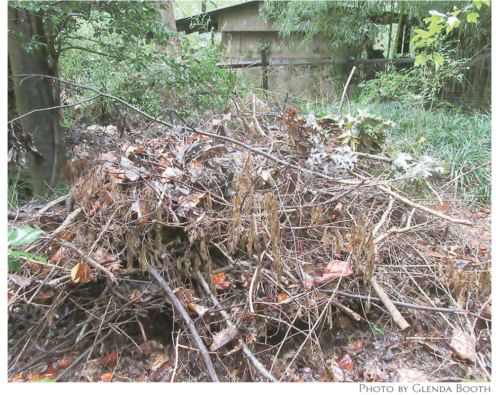
A brush pile supports many wildlife species.

Most experts recommend starting with a sturdy base, putting the largest logs or limbs