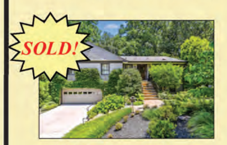
1405 Layman Street McLean, 22101 $1,420,000

2049 Rockingham Street McLean, 22101 $4,695,000 NEW CONSTRUCTION!