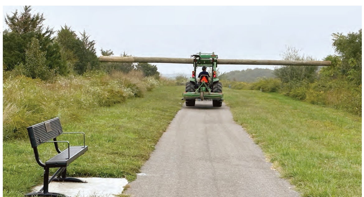
A recycled 50-foot utility pole is moved to the site by maintenance operations employee Alex Guevara-Santos in advance of installation day.

assist from the loading machine for stability, maneuvered the pole slowly and gently, coaxing it up and into the hole, earning a cheer from watching crew and volunteers. A climbing guard to ward off predators will be added.