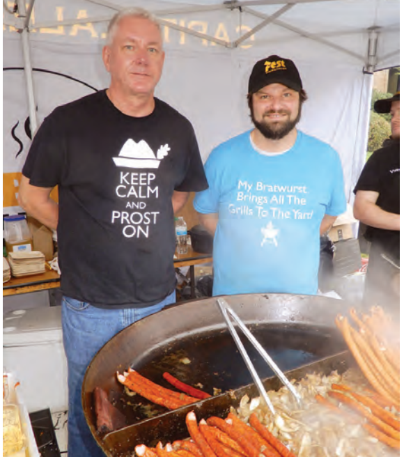
tal Ale House cook Polish sausage and onions.