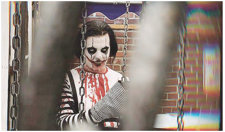
The Haunted Trail at Workhouse Arts Center runs now through Oct. 31, 2023 in Lorton.