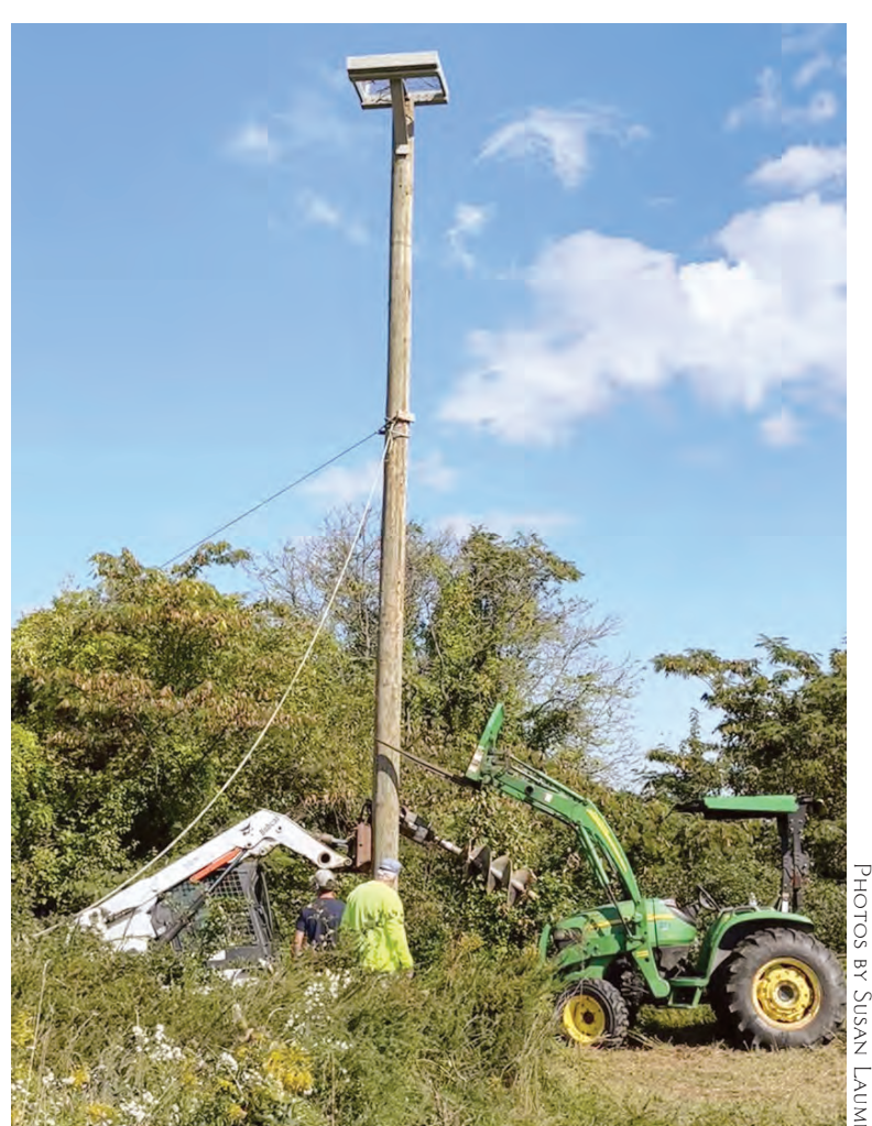
A new osprey nesting platform slips into place commanding the open sky of Laurel Hill Park.