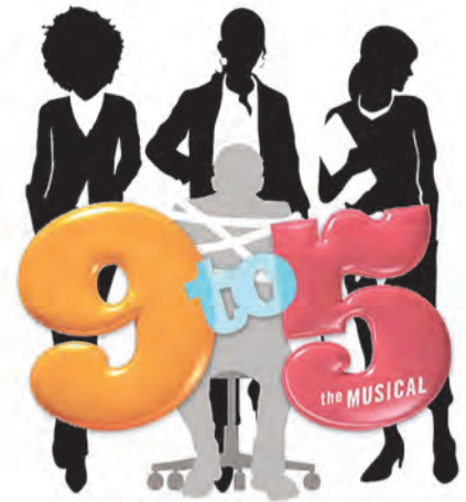
"9 to 5 The Musical" takes place Oct. 27-29, 2023 at GMU's Harris Theatre in Fairfax.

Two-Day LEGO Model Train Show. Noon to 4 p.m. Saturday; 1-4 p.m. Sunday. At Fairfax Station Railroad Museum, 11200 Fairfax Station Road, Fairfax Station. The Washington D.C. Metropolitan Area LEGO Train Club (WamaLTC) members will hold a two-day LEGO based train show at the Fairfax Station Railroad Museum. All trains, buildings and scenery in the display are built from LEGO blocks and shapes. Donations of unwanted LEGO pieces and sets are appreciated to help support WamaLTC's efforts to bring fun and education to all ages through its activities. Admission: museum members, free; adults 13 and over, $5; children 5-12, $3; under 4, free.