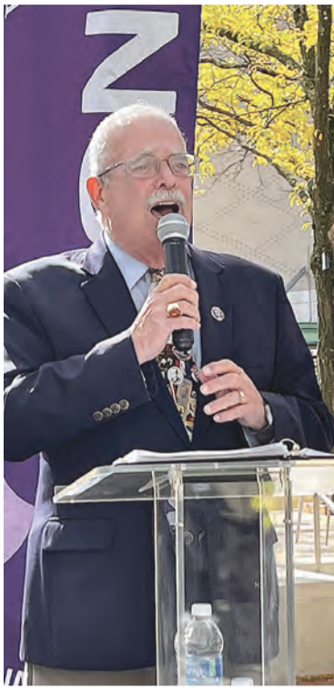
U.S. Rep. Gerry Connolly (VA-11) tells of how his family lost their matriarch to Alzheimer's.