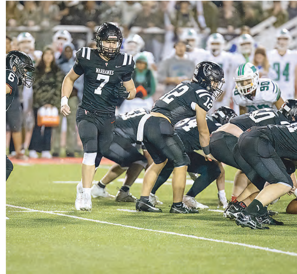
Liden Krush #7 is in motion before the Madison QB takes the snap.