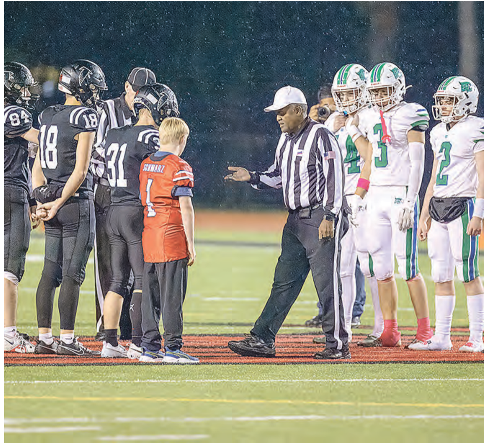
The Madison Warhawks and South Lakes Seahawks gather at midfield for the coin toss.