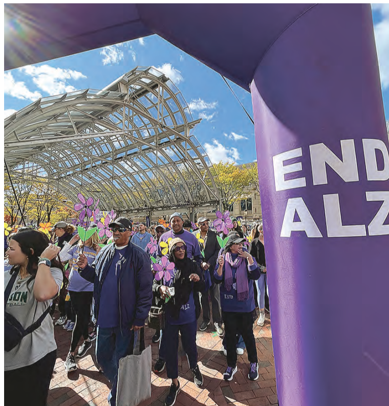
2023 Northern Virginia's Alzheimer's Association Walk to End Alzheimer's, Reston Town Center

While there was no registration fee for the Reston walk, all participants were encouraged to raise critical funds that allow the Alzheimer's Association to provide 24/7 care and support as well as advance research toward methods of prevention, treatment, and, eventually, cure. A white flower represents this goal of a cure. No one has yet to walk with a white flower.