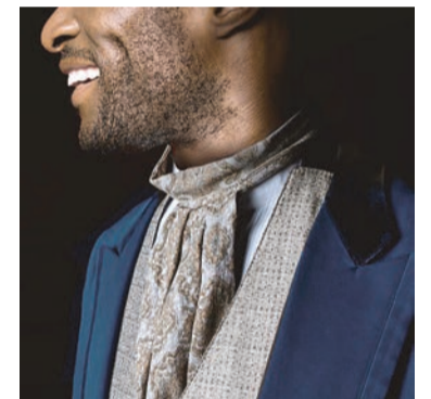
The Hayfield Middle School Dramahawks are producing Disney's "The Descendants" Nov. 16-18, 2023.

"The Descendants." Thursday to Saturday at 7 p.m.; Saturday at 2 p.m. At Hayfield Middle School,