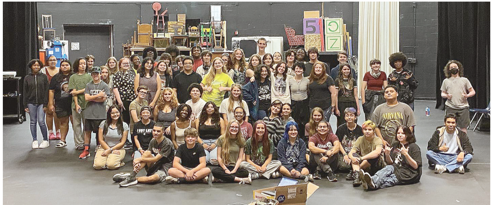
"Peter and the Starcatcher" can be seen at Mount Vernon High School on Nov. 16-18, 2023.

Nov. 27 -- Drew Blue Shoes Magic Dec. 4 -- Music Together Sing and Groove Dec. 11 -- My Gym Dec. 18 -- TBD