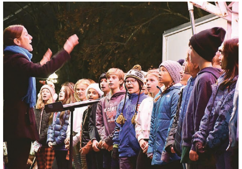
The Church Street Stroll takes place on Monday, Nov. 27, 2023 in the Town of Vienna.

NTRAK Model Train Show. 1-4 p.m. At Fairfax Station Railroad Museum, 11200 Fairfax Station Road,