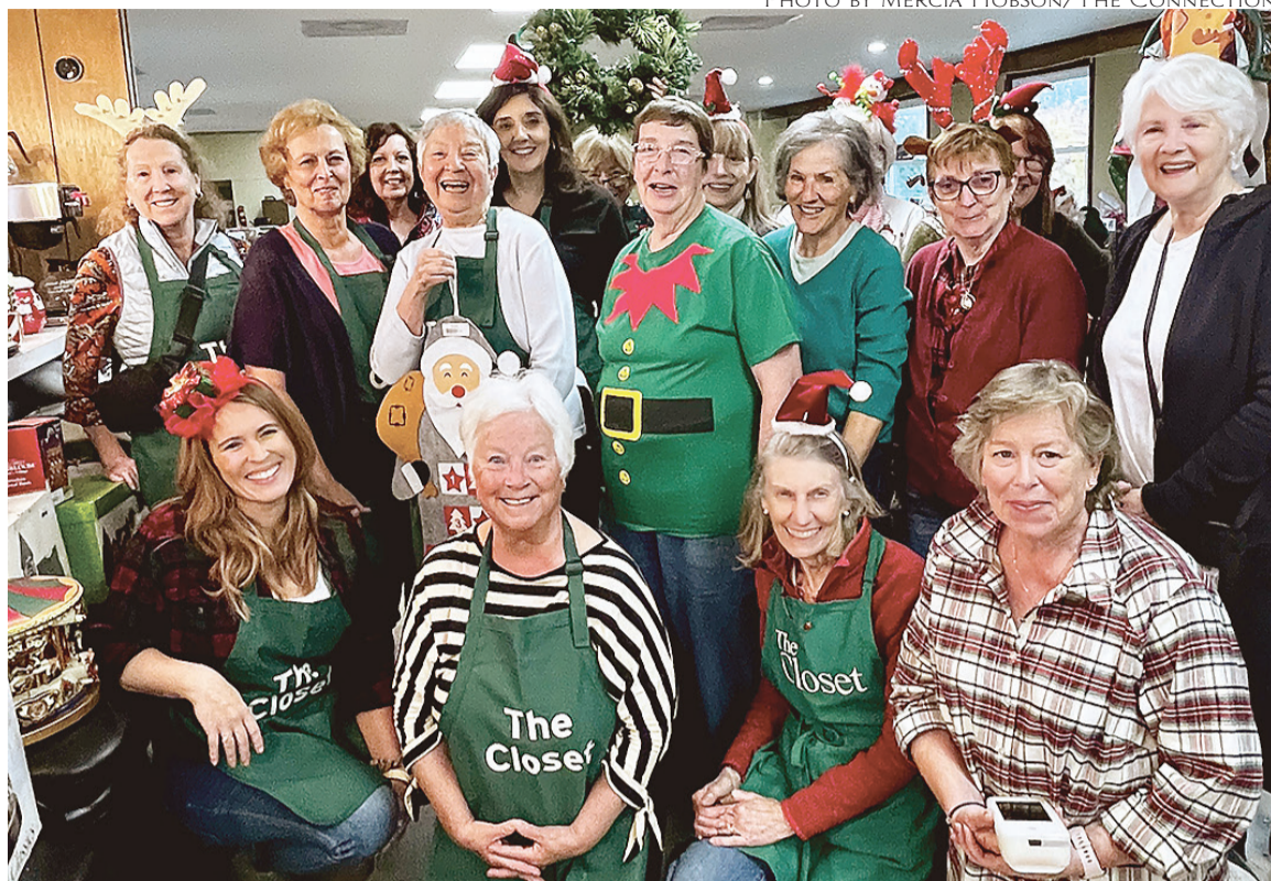
The volunteer elves of The Closet's Annual Everything Christmas Sale are ready for the rush.