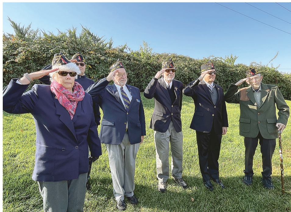
Veterans of the Wayne M. Kidwell American Legion Post 184 Herndon-Reston