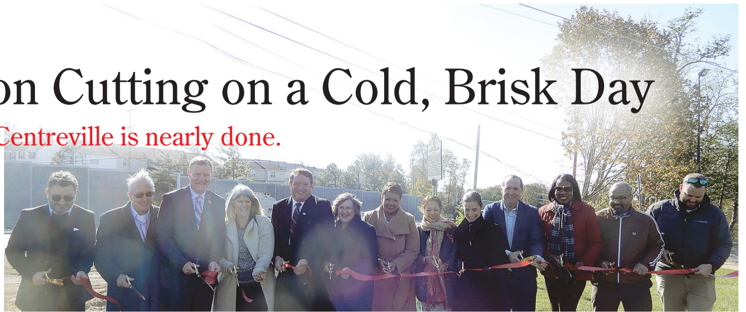
The ribbon cutting for the completion of the Route 28 widening project in Centreville.

Noise-barrier walls are being erected at four points along the project corridor. Along Route 28 north, one will be north of Darkwood Drive and one will be north of Compton Road. Along Route 28 south, one will be north of Green Trails Drive and one will be north of Ordway Road.