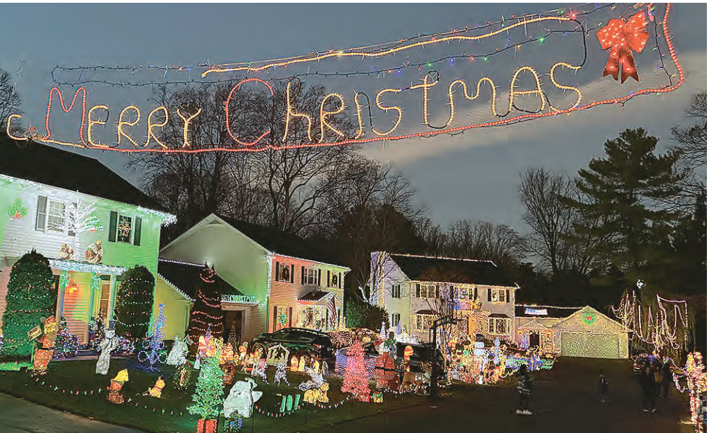
Holiday lights - Decorations vary from small and simple; to use of exaggerated elements; to immense displays encompassing whole blocks, like this well known one on Marshall Pond Road in Burke. Cars line nearby streets for blocks as families walk through the cul-de-sac