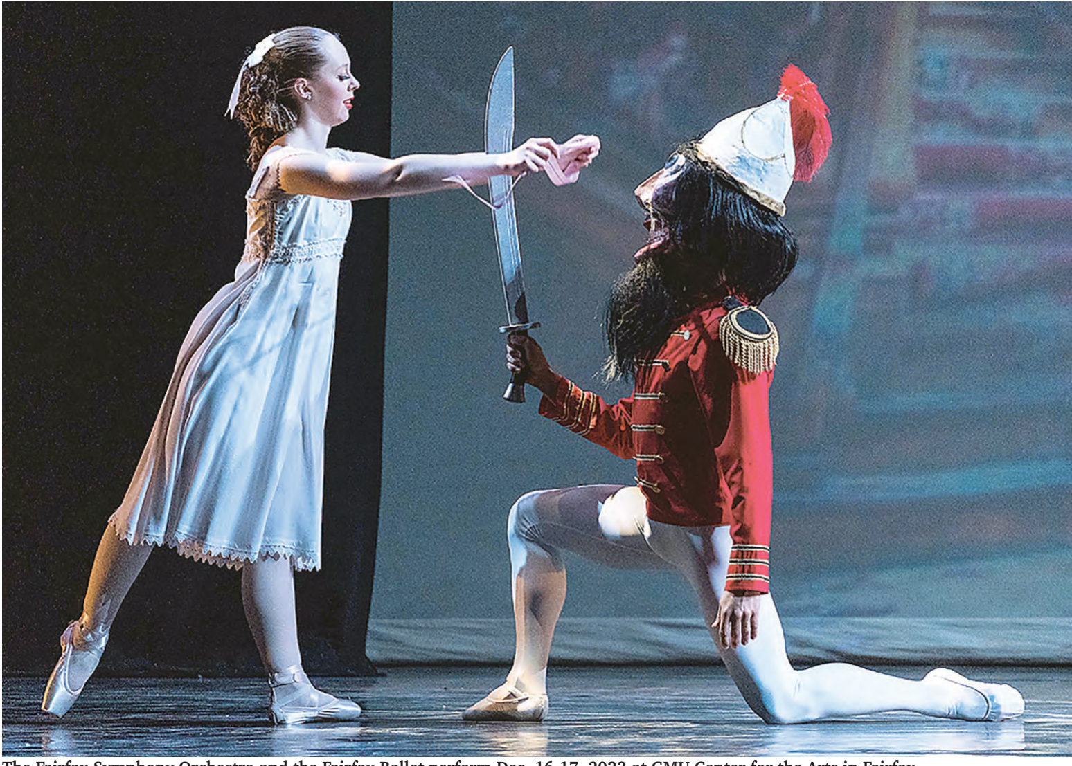
The Fairfax Symphony Orchestra and the Fairfax Ballet perform Dec. 16-17, 2023 at GMU Center for the Arts in Fairfax.