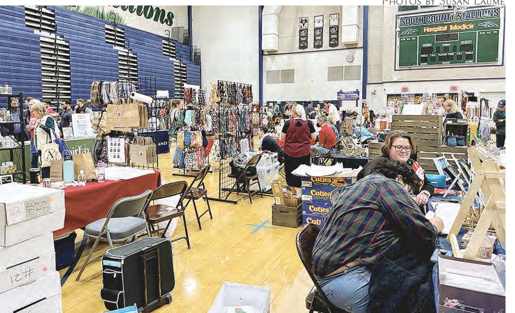
Holiday craft fairs - In its 18th year, the Lorton Holiday Extravaganza, at South County High School on December 2nd, put on by PTSO (Parent Teacher Student Organization), boasts more than 180 craft vendors in its fundraiser which supports the annual all night grad party and provides teacher and student support.