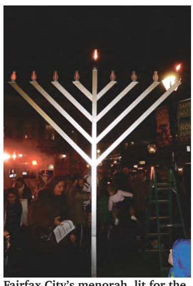
Fairfax City's menorah, lit for the first night of Chanukah.