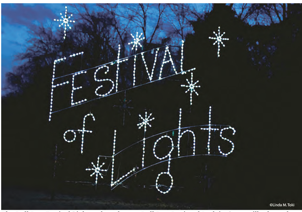
The Bull Run Festival Lights takes place at Bull Run Regional Park in Centreville through the holidays.