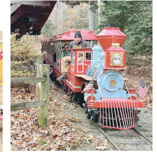
Christmas trains - In all sizes, whether traveling around the tree or through the park, like this one at Burke Lake, capture special attention during the holidays. This one piloted by engineer Chris Wise of Springfield.