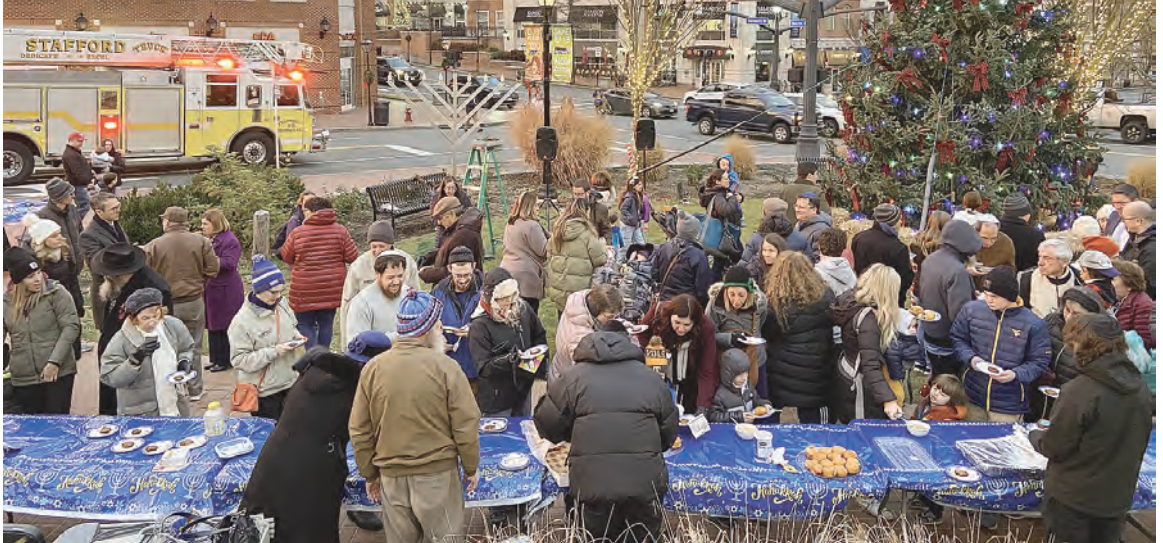
Before the ceremony began, shortly after sundown, attendees enjoyed jelly doughnuts, potato latkes and hot chocolate.