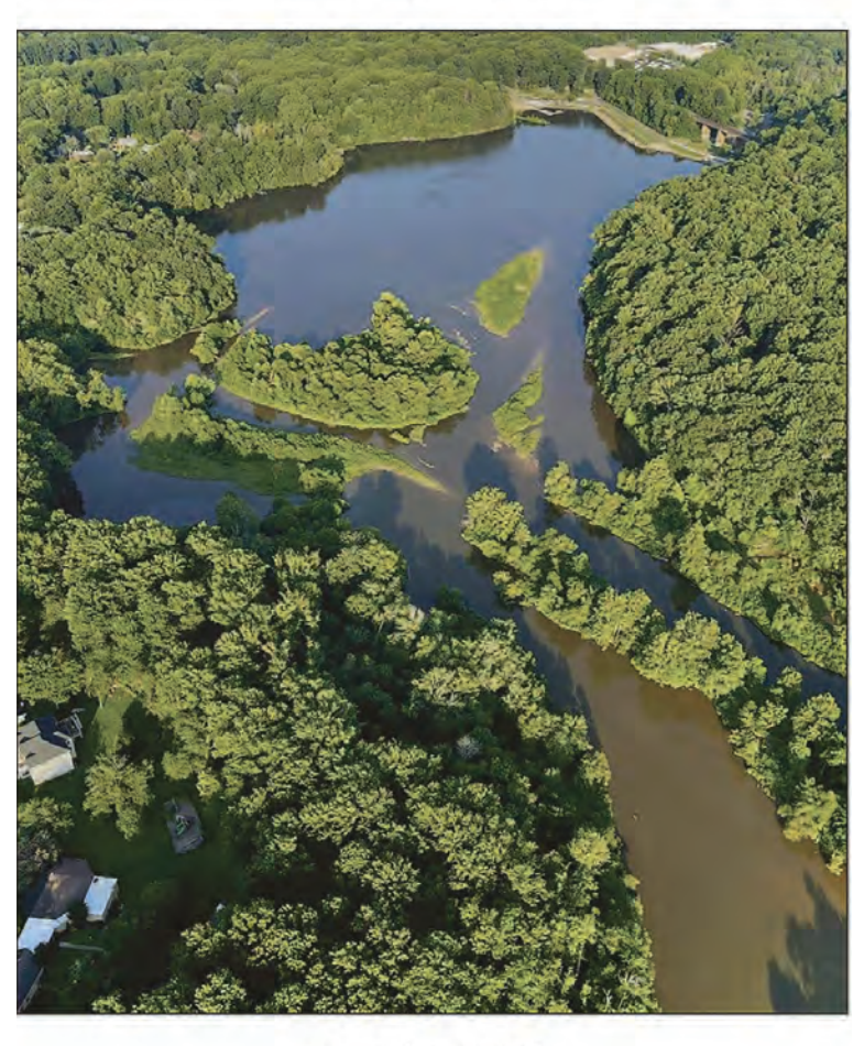
December 8, 2023