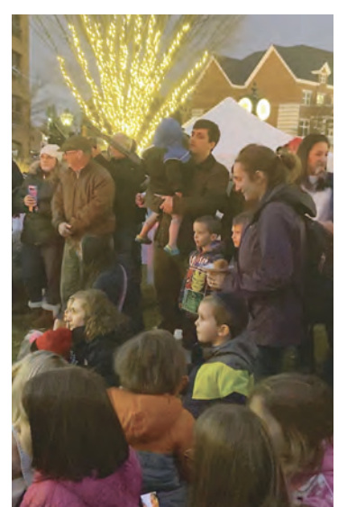
Parents and children watch the Chanukah ceremony.