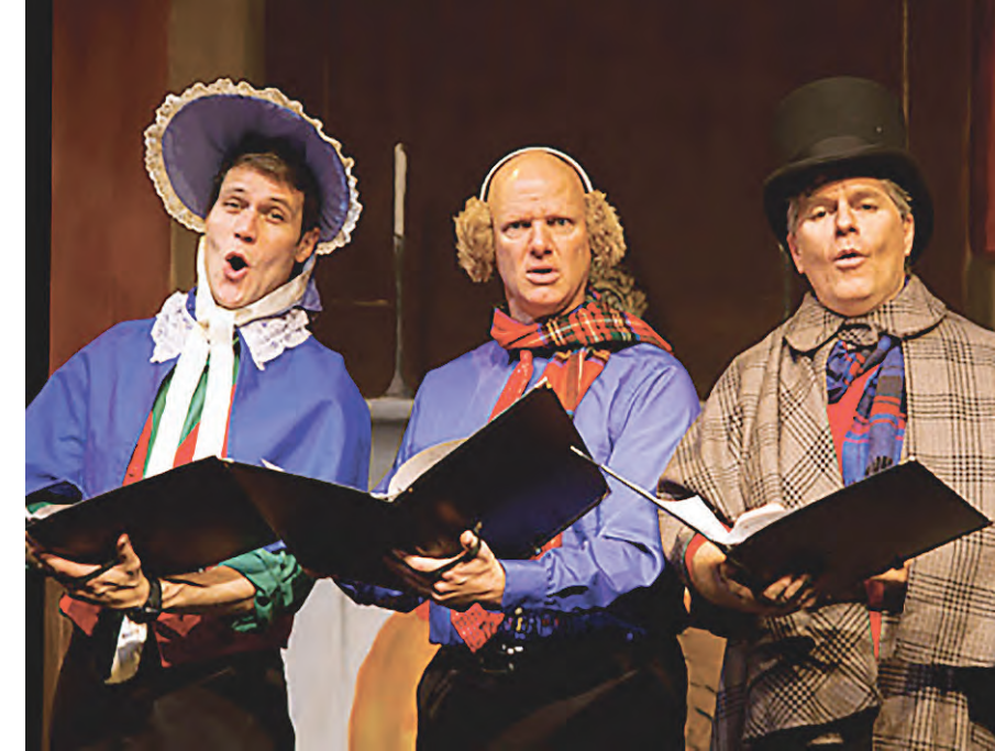
The Reduced Shakespeare Company's Ultimate Christmas Show will be held Saturday, Dec. 16, 2023 at Reston Community Center in Reston.