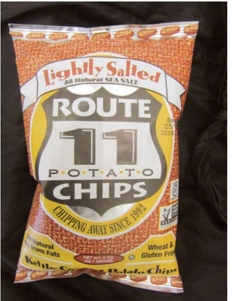
Route 11 Potato Chips.