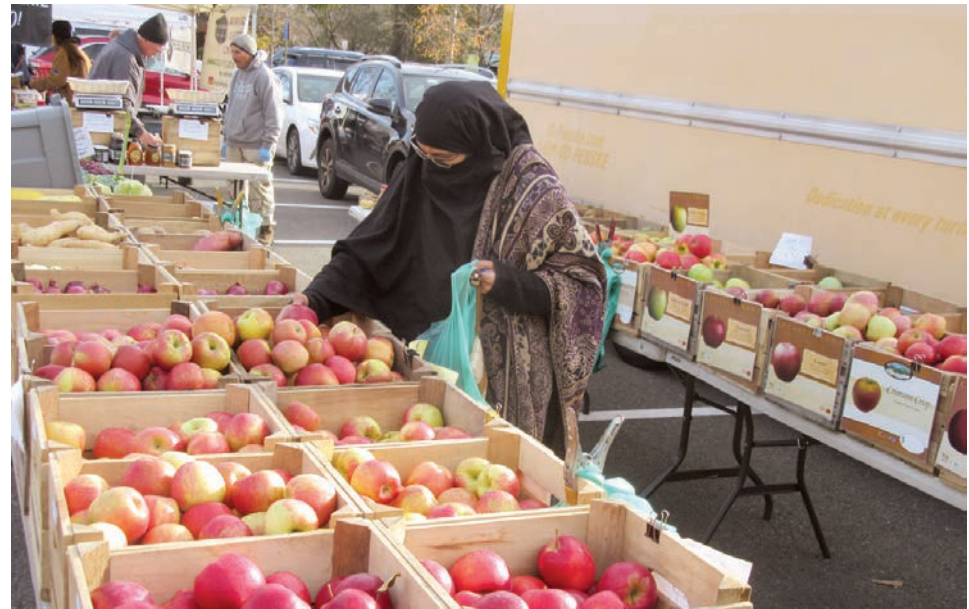
Shopping for apples at the Mount Vernon Farmers Market, December 13, 2023.