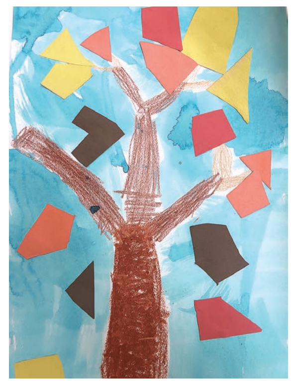
Audrey Babcock, Kindergarten