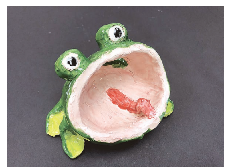
Charlotte Burkholder, 5th grade