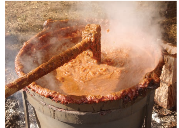
Apple butter in the making at the Graves Mountain Lodge Apple Butter Festival and jars for sale.