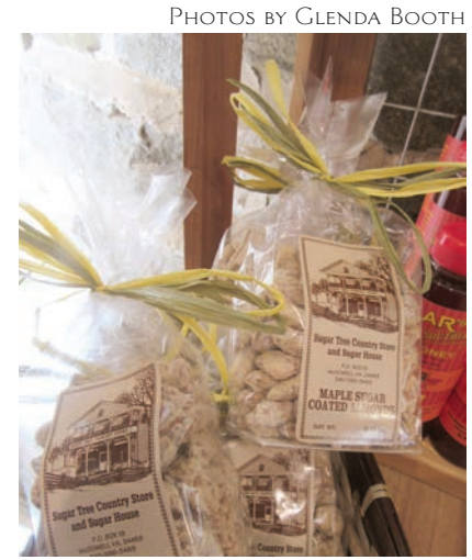
Maple-sugar-coated almonds from Highland County.