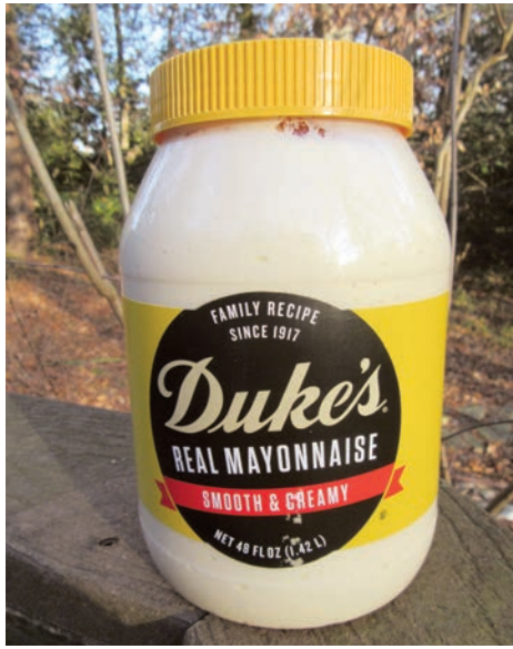
Duke's mayonnaise, a favorite of many Southerners.