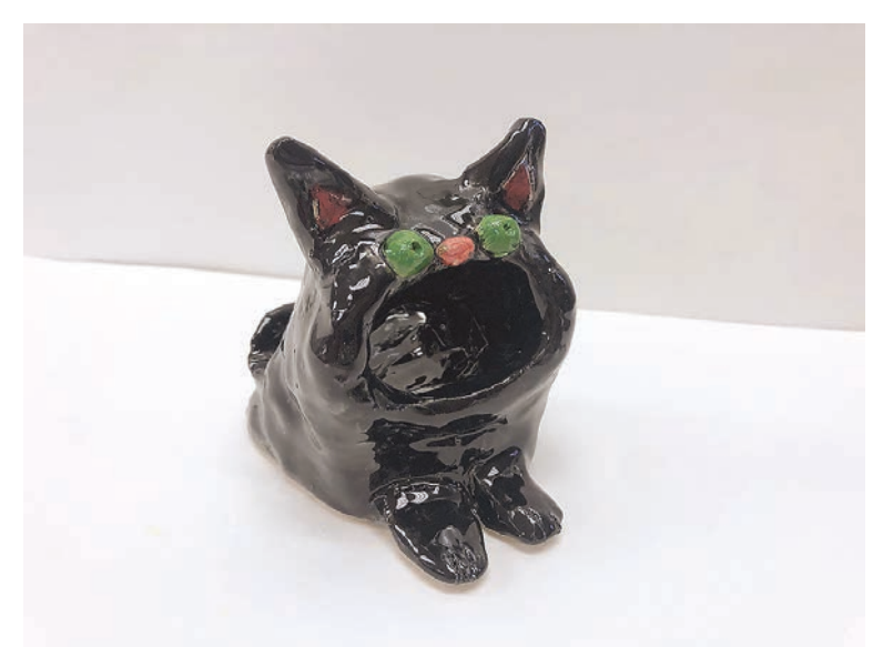
Emily Tryder, 5th grade