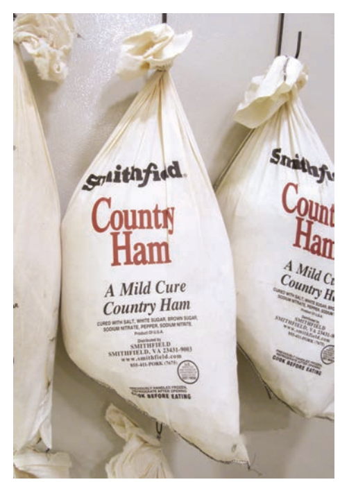
Smithfield ham for sale at the Belle View Safeway.

There are long-standing debates about whether Brunswick stew originated in Virginia or Georgia and about the ingredients that make it genuine. Originally, the central ingredient was wild game like rabbits and squirrels. Today, some gourmands would consider Brunswick stew with chicken or pork "adulterated." A true stew is simmered in a cast-iron cauldron over a fire with vegetables, like potatoes and lima beans.