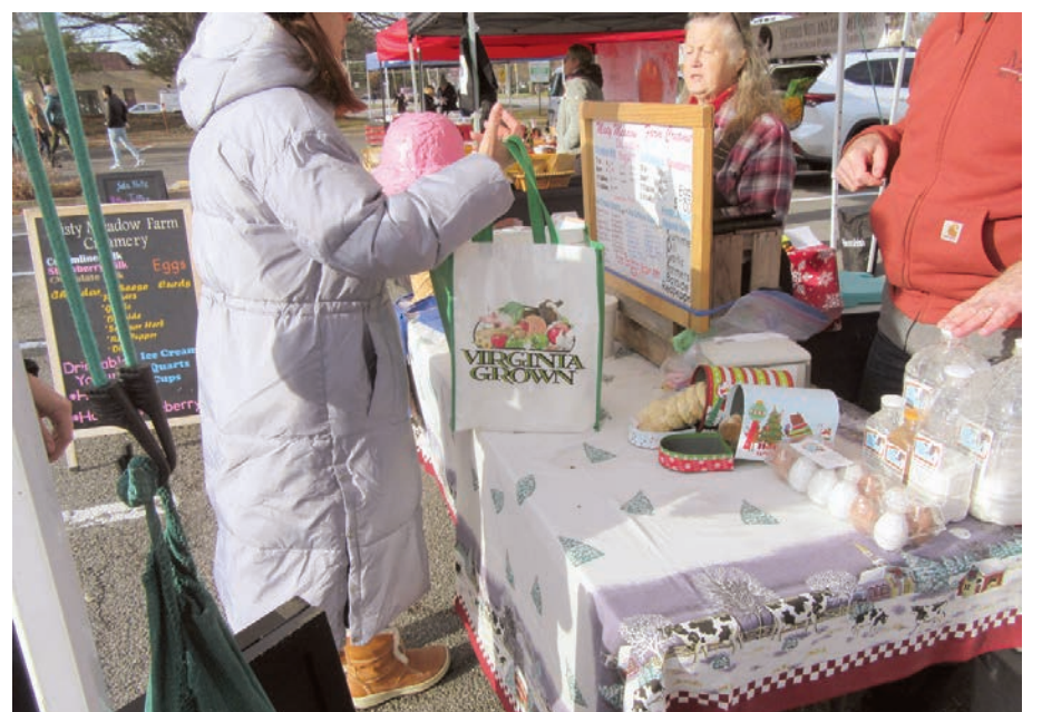
Shopper's bag touts Virginia products at Misty Meadow Farm Creamery at the Mount Vernon Farmers Market, December 13, 2023.