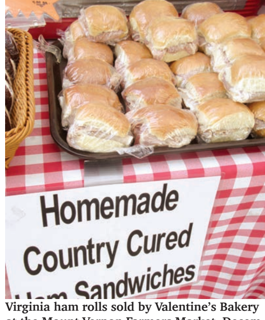
Virginia ham rolls sold by Valentine's Bakery at the Mount Vernon Farmers Market, December 13, 2023,