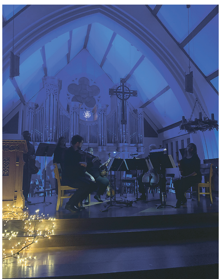
The blue deepened as the concert progressed, like winter turning icy and dark.

Oswaldo Golijov. Despite its jarring short bow strokes and almost "Psycho" like crescendos, "Tenebrae" also then entered another world: a walk on a starry night, a sleigh ride