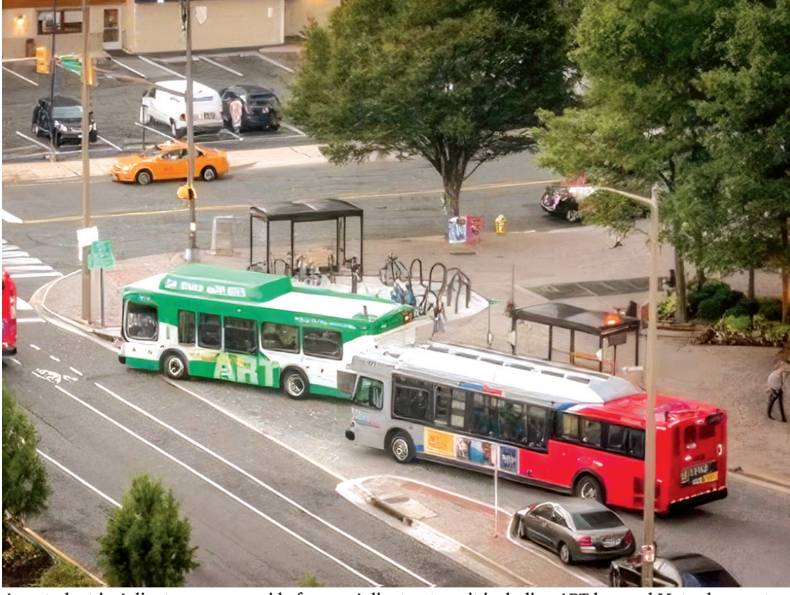
Any student in Arlington can now ride free on Arlington transit including ART bus and Metro bus routes.

"The iRide SmartTrip card will provide young people with great-