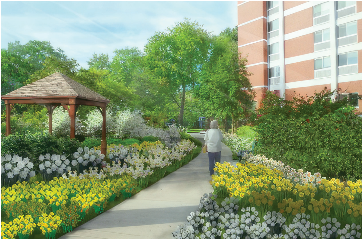
Artist rendering of Culpepper new daffodil garden.