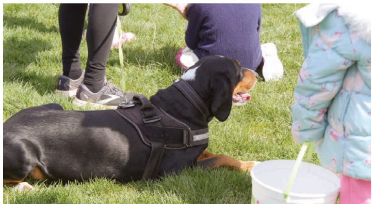
No category for dogs.