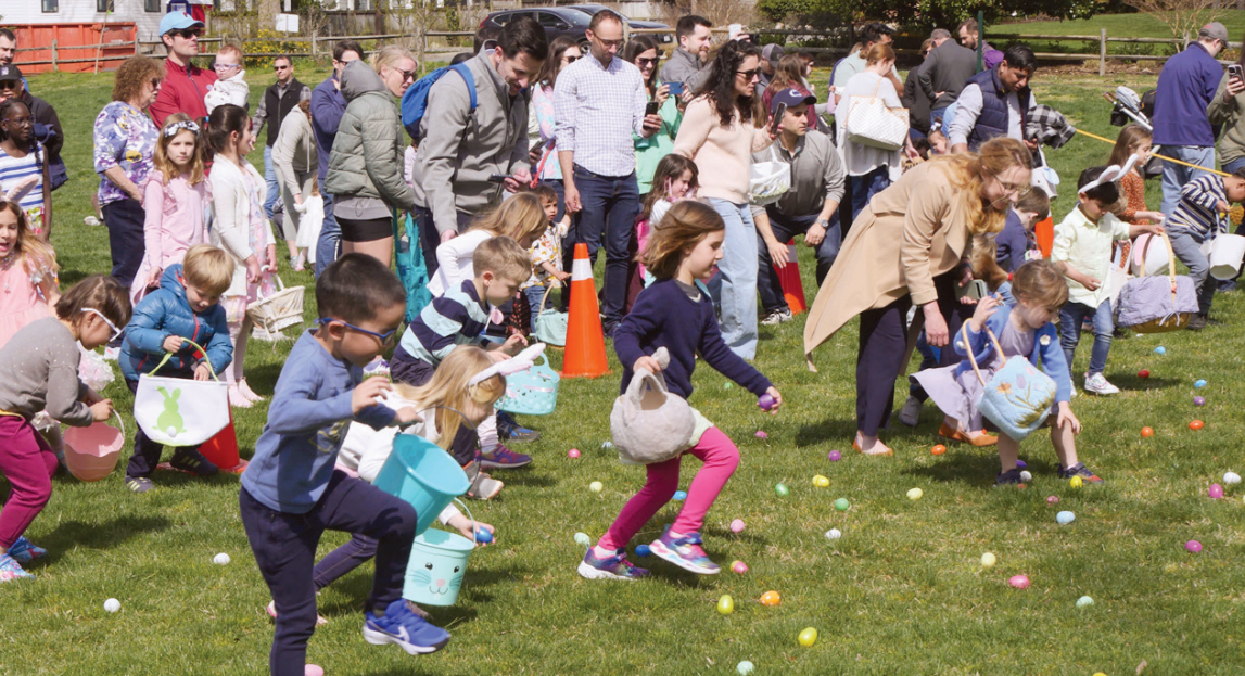
It's a running start for the 4-5-year olds Saturday morning at Woodlawn Park.