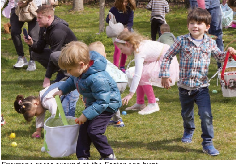
Everyone races around at the Easter egg hunt.