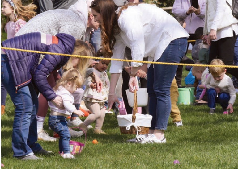
The toddler crowd starts first.