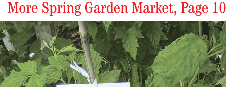
Matt Goldman from Plants with Purpose Farm sold raspberry plants that produce yellow berries.