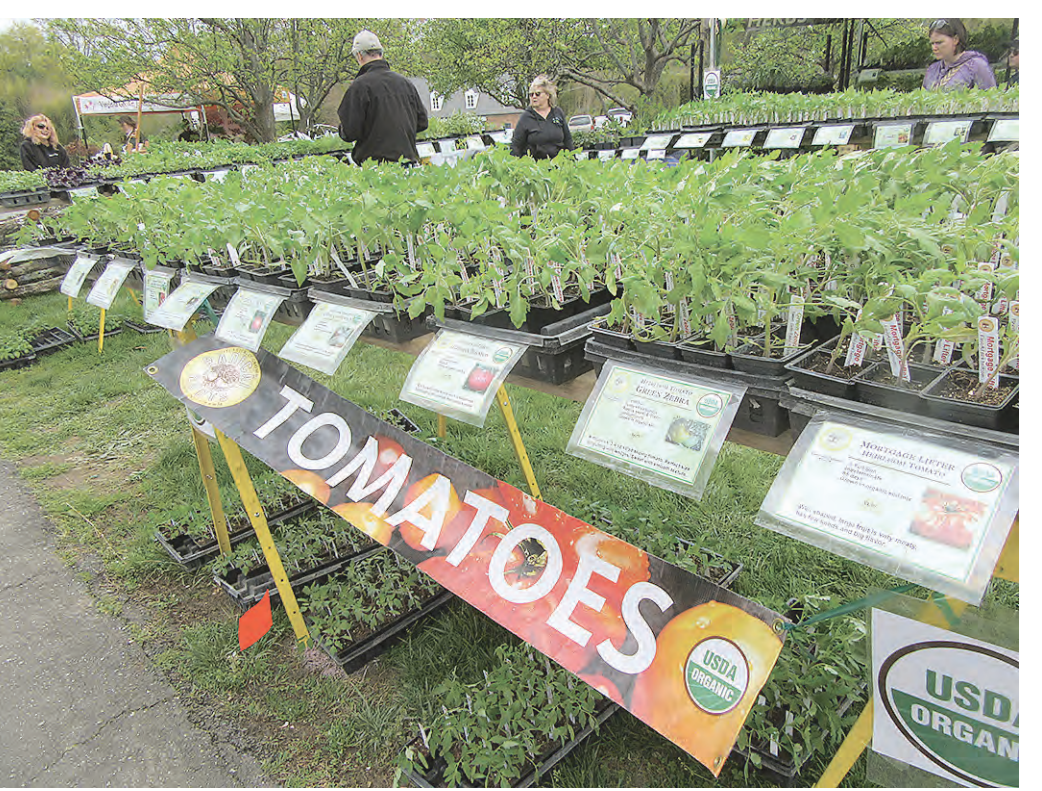
Vegetable plants, especially tomatoes, were popular.