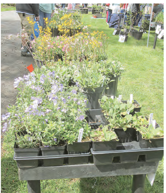
Flowering plants were popular with many shoppers.