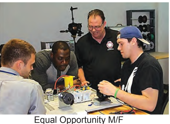
AWARD-WINNING S[z] IS COMING TO ALEXANDRIA

For additional information scan the QR Code.