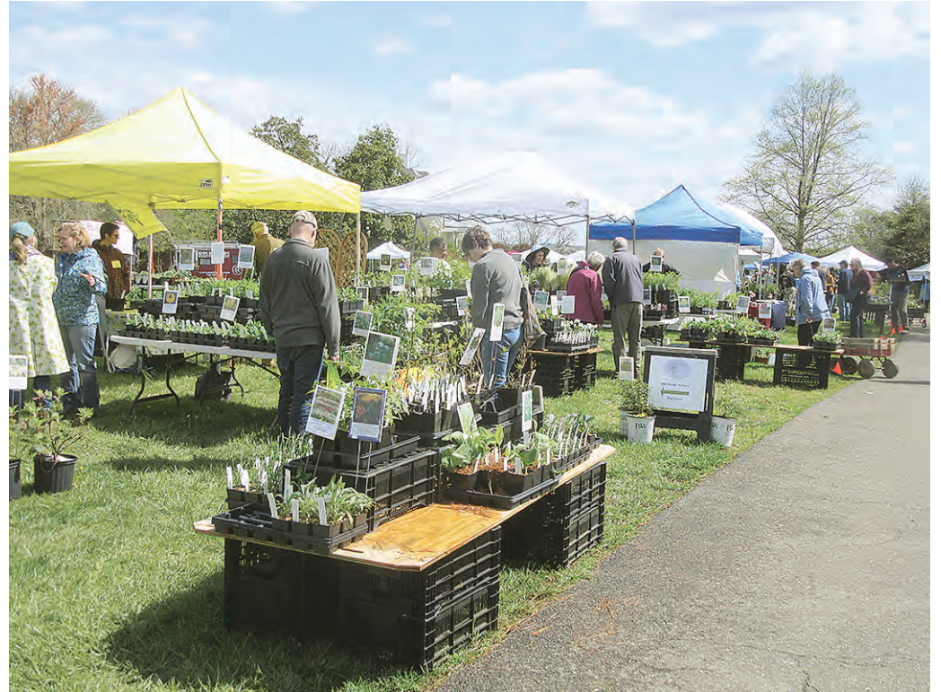
Around 2,300 people shopped at the American Horticultural Society's annual garden market on April 12 and 13.