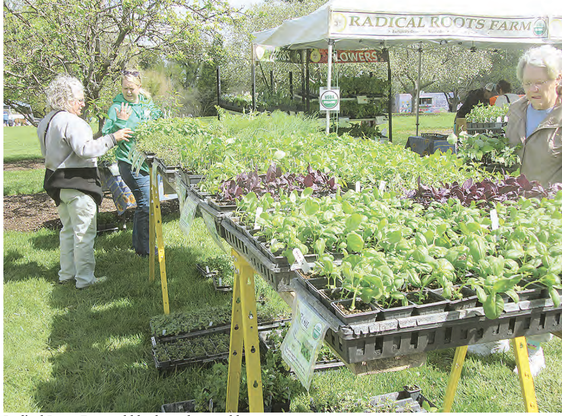
Radical Roots Farm sold herbs and vegetables.