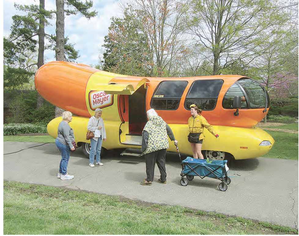
The Oscar Meyer weinermobile was an attention-getter