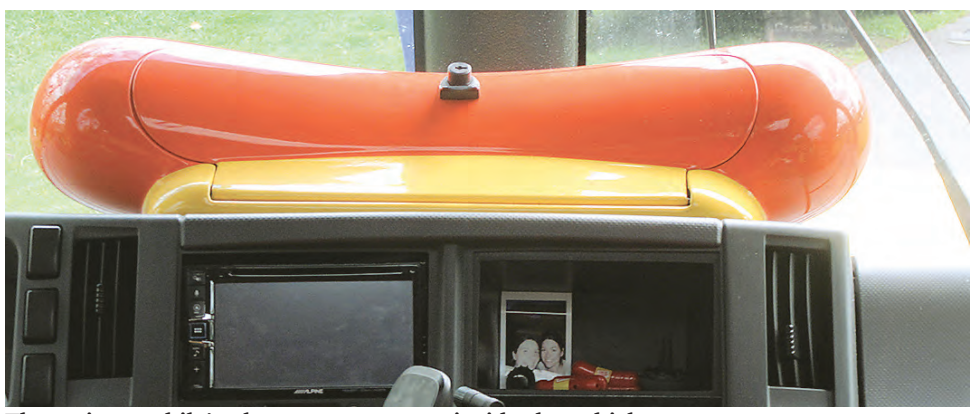
The weinermobile's glove compartment inside the vehicle