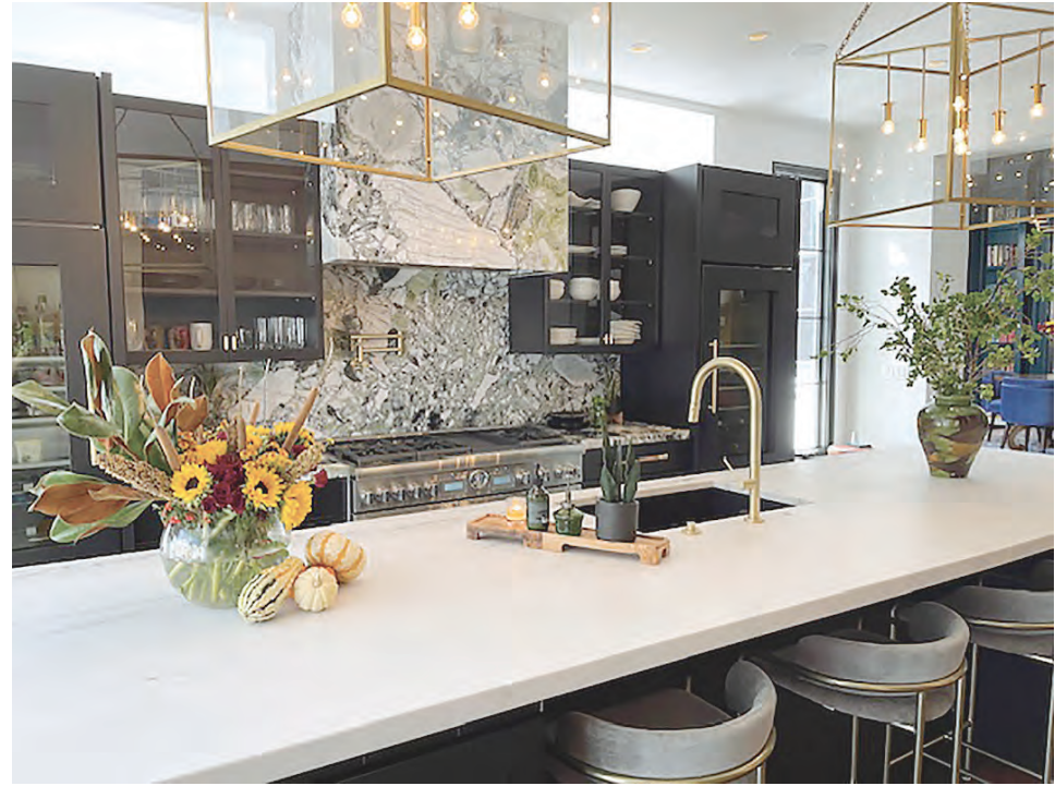
Saturday, April 20, the Garden Club of Virginia hosts its Historic Old Town Home and Garden Tour.