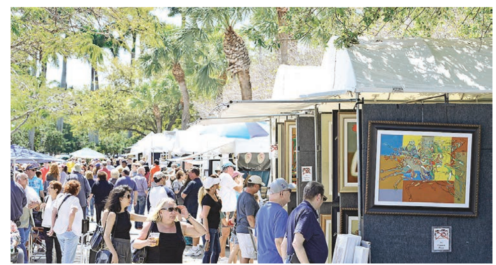
The Arlington Festival of the Arts takes place April 27-28, 2024 in Arlington.

Event will be held in person and online via livestream. Tickets are available for purchase at https://www.9thstreetchambermusic.com/event-details/schubert-and-friends