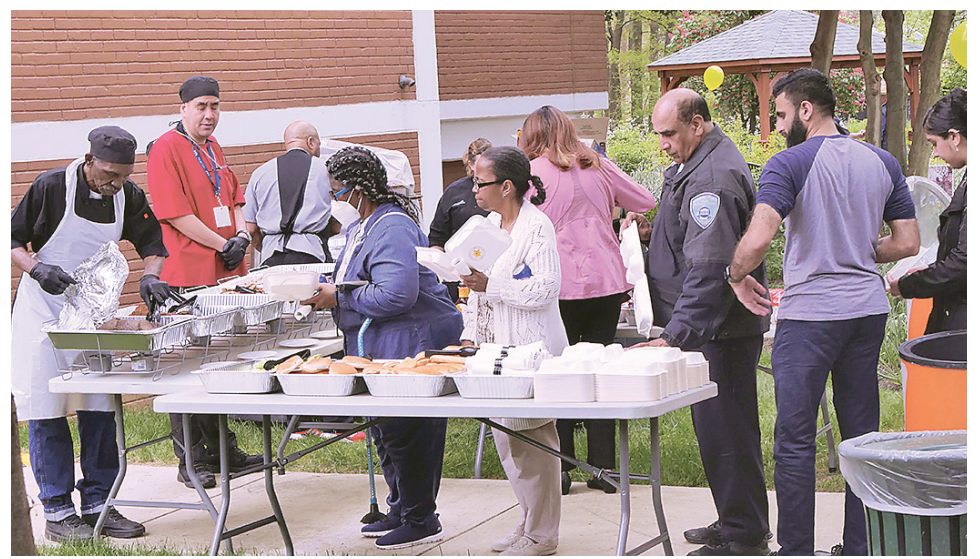
Long line forms for BBQ lunch at first responders ceremony

Libby Garvey, a long time supporter of Cul-