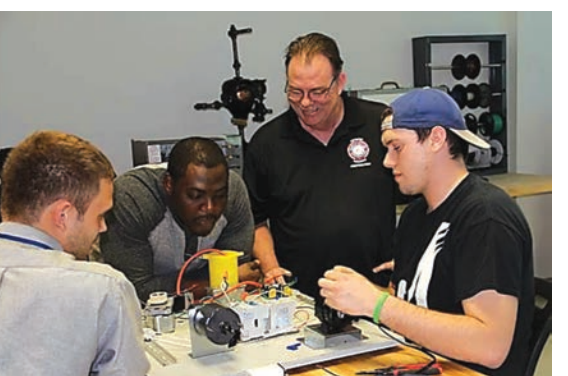
Equal Opportunity M/F

fee includes drug screen. For additional information scan the QR Code.