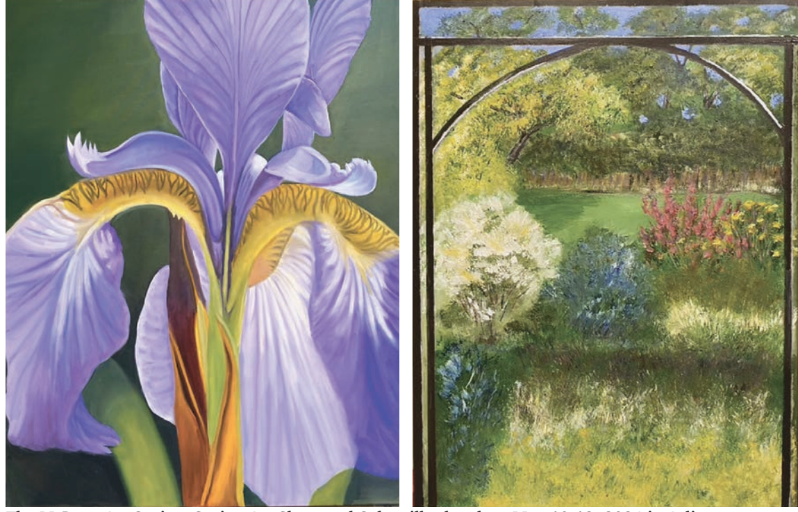
The McLean Art Society Spring Art Show and Sale will take place May 10-12, 2024 in Arlington.