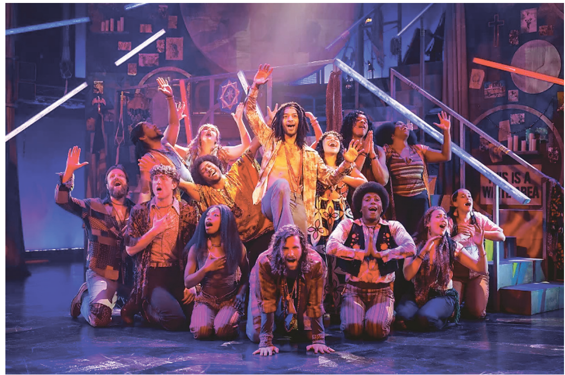
"HAIR" can be seen now through July 7, 2024 at Signature Theatre in Arlington.