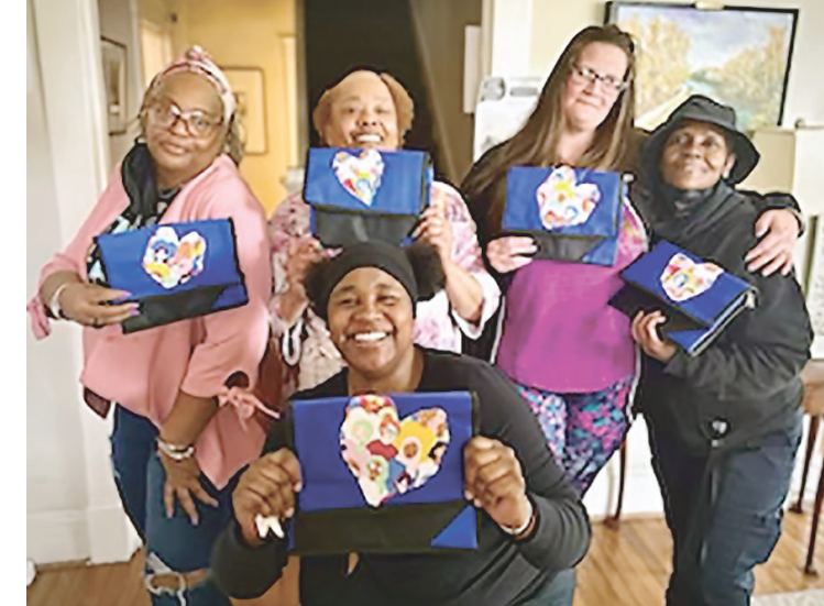
Guest House today. 4 ♦ Alexandria Gazette Packet ♦ May 30 - June 5, 2024