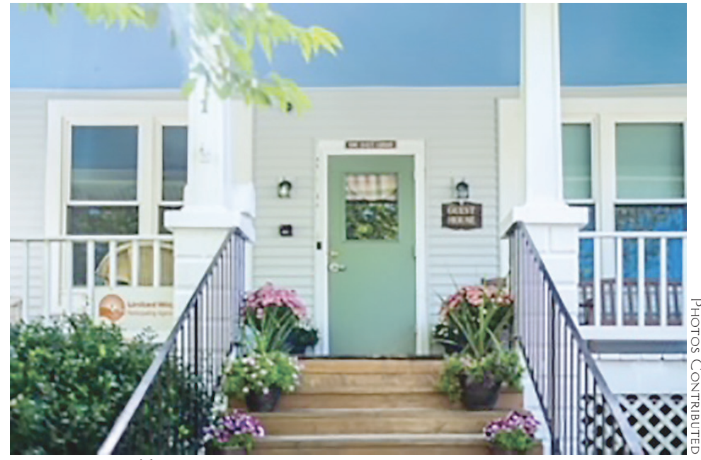
Guest House residence on E. Luray Avenue