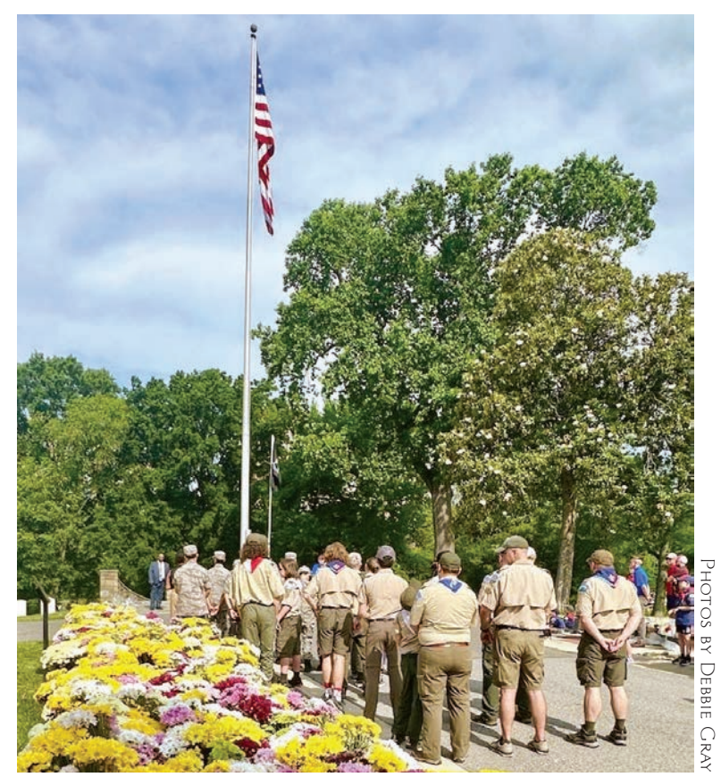
Members of Scouting America troops gather to begin placing flags at the graves of fallen veterans May 25 at Alexandria National Cemetery.