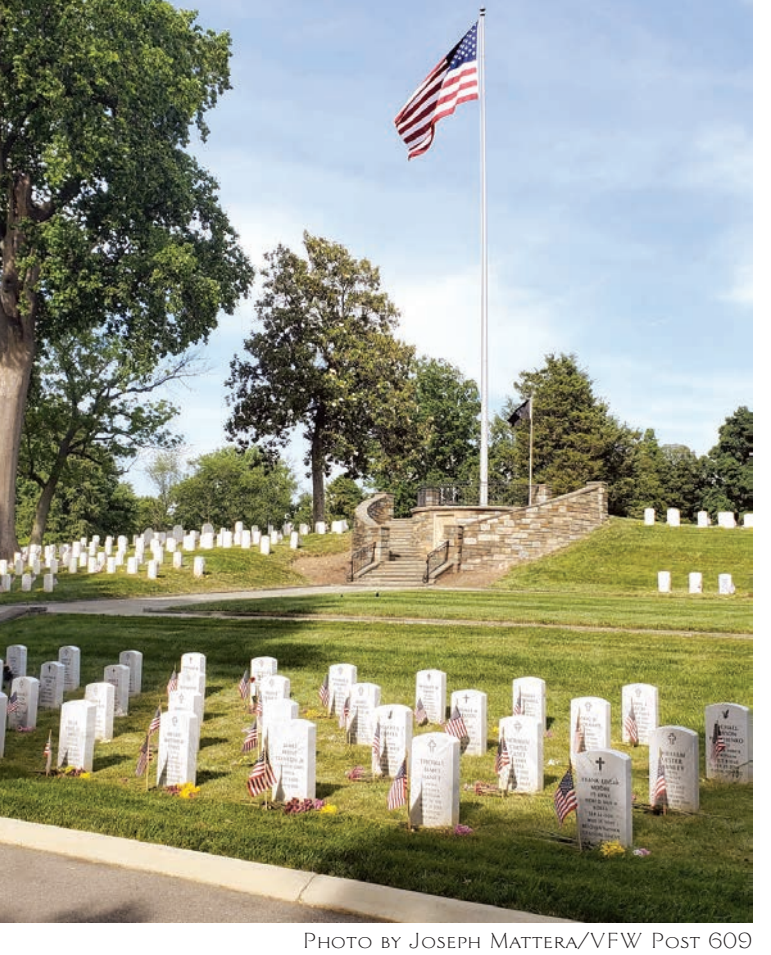
U.S. Flags adorn the graves of more than 4,000 fallen veterans May 25 at Alexandria National Cemetery.