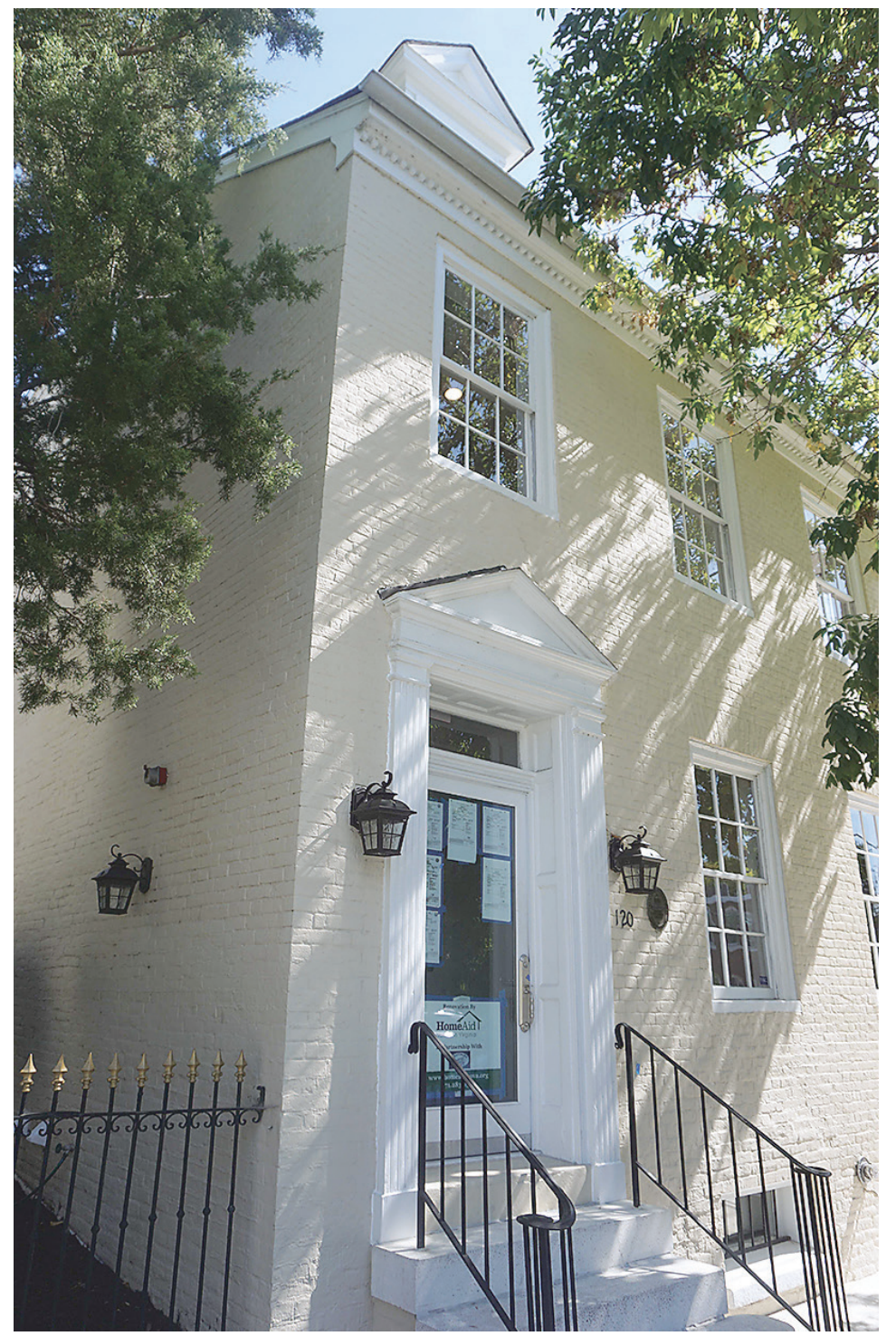
Most recent Guest House additional residence on Payne Street 6 Alexandria Gazette Packet May 30 - June 5, 2024