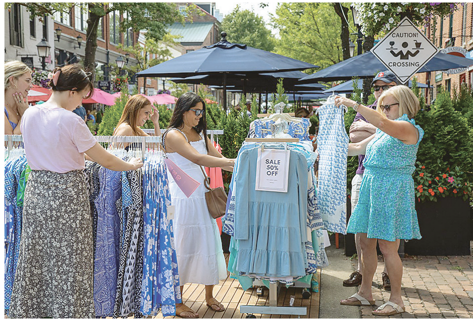
Alexandria Summer Sidewalk Sale takes place Saturday, Aug. 10, 2024 throughout Old Town Alexandria and Del Ray.

At 3701 Mount Vernon Ave., Alexandria. All shows are at 7:30 p.m., unless otherwise