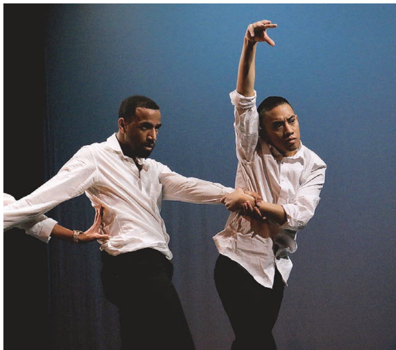
Jane Franklin Dance's At Large Performance will take place on Friday, July 26, 2024 at The Athenaeum in Alexandria.

1-5 p.m. At Patrick Henry Recreation Center, 4653 Taney Ave., Alexandria. Best of the West is a community event showcasing West End Business Association members and restaurant tastings! This event is open to everyone. It is a great opportunity to enjoy a day out in