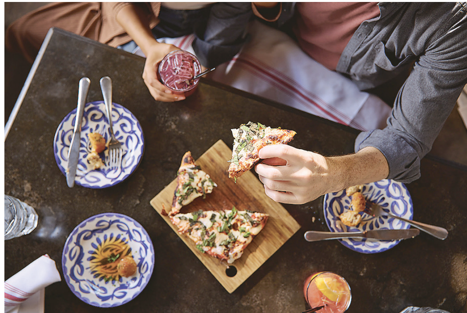
Alexandria Restaurant Week takes place Aug. 16-25, 2024 throughout Old Town Alexandria, Del Ray, Carlyle, Eisenhower and the West End.

noted. Tickets available at Ticketmaster.com . Contact The Birchmere at 703-549-7500 or www.Birchmere.com .