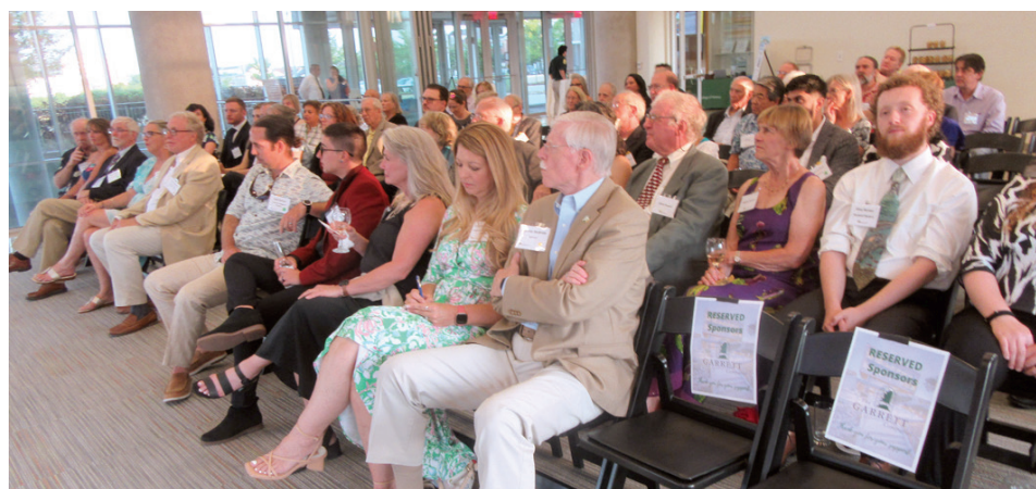
Eighty people attended the June 28 gala.

them in the Potomac and its tributaries since 2004. In those years, tall tales viralized online, alleging that snakeheads could attack people, devour pets and walk on land. "They can breathe air," Nelson said. On their impact, he said, "White perch and banded killifish are increasing. The system has not collapsed."