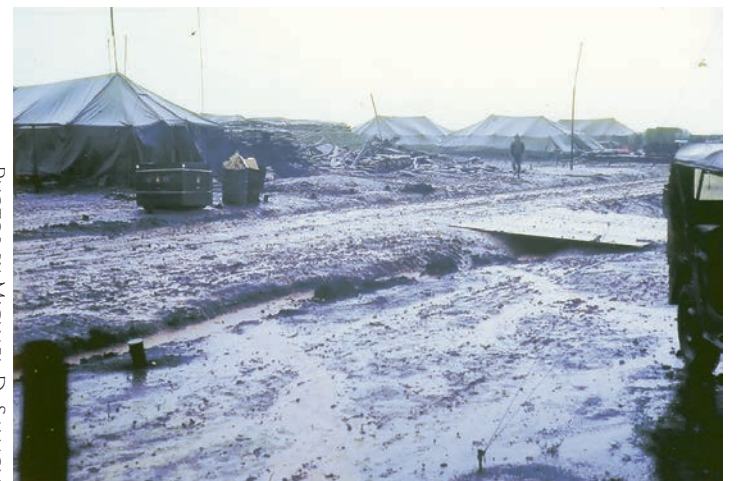
During Vietnam’s rainy season at the US Marine base in Khe Sanh.