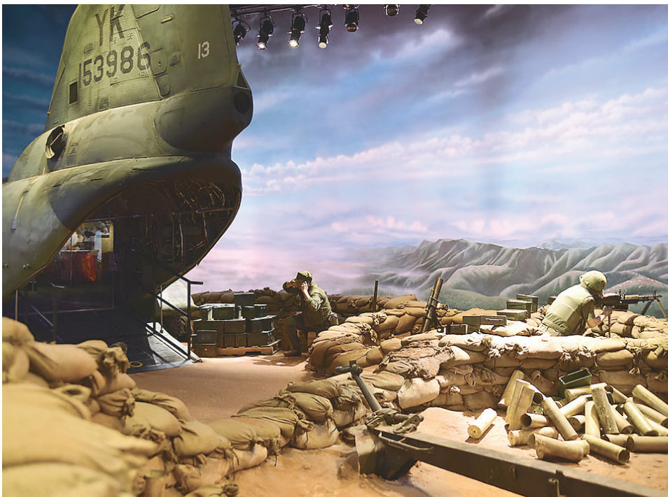
The Khe Sanh exhibit at the USMC museum in Quantico.