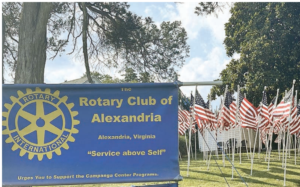
The Flags For Heroes display is sponsored by the Rotary Club of Alexandria.