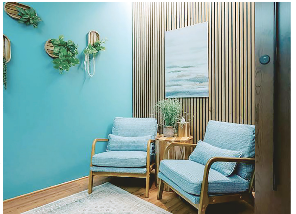
The Respite Room in Quantico.