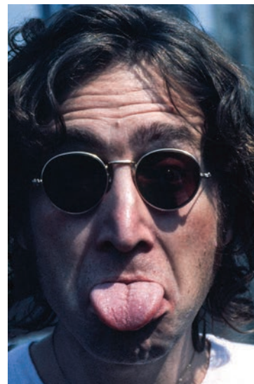
May Pang's photography, The Lost Weekend Exhibit featuring John Lennon, can be seen July 18-21, 2024 at the Nepenthe Gallery in Alexandria.

"American Psycho." At Ainslie Arts Center, 3900 West Braddock Road, Alexandria. Monumental Theatre Company will stage Duncan Sheik and Roberto Aguirre-Sacasa's "American Psycho." Based on Bret Easton Ellis's 1991 novel of the same name, the musical follows protagonist Patrick Bateman. A suave young Wall Street banker, Patrick enjoys the finer things by day with his elite friends, but as night falls, his taste for darker pleasures threatens to uproot his normal facade. Tickets are: $15 in advance, $20 at the door, and $10 for students using code STUDENT (must show ID). Visit http://www.monumentaltheatre.org .