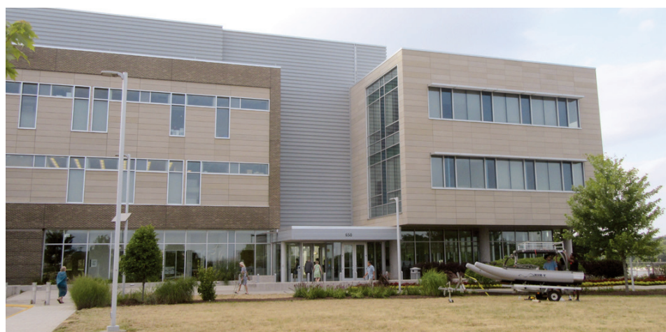
The Potomac Science Center, PEREC's home on Belmont Bay.

Nelson highlighted snakehead fish which are native to Asia. Many invasive species are problematic because they outcompete native species, disrupt native biological communities and degrade ecosystems. In 2002, news of a snakehead in a Crofton, Maryland, pond popped up. State scientists have documented