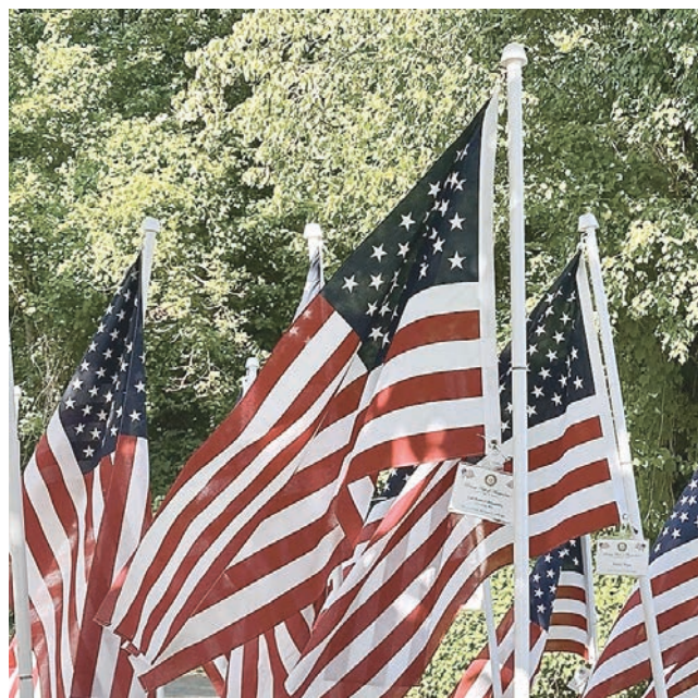
Each flag in the Flags For Heroes Display has a card attached bearing the name of a hero and the individual sponsor.

Local Scout troops joined volunteers from the Alexandria Central Rotary Club, the Alexandria West Rotary Club and the Mount Vernon Rotary Club in positioning the flags at the restaurant's location along