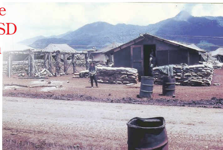
A local villager who was hired to do laundry and clean around the base at Khe Sanh.